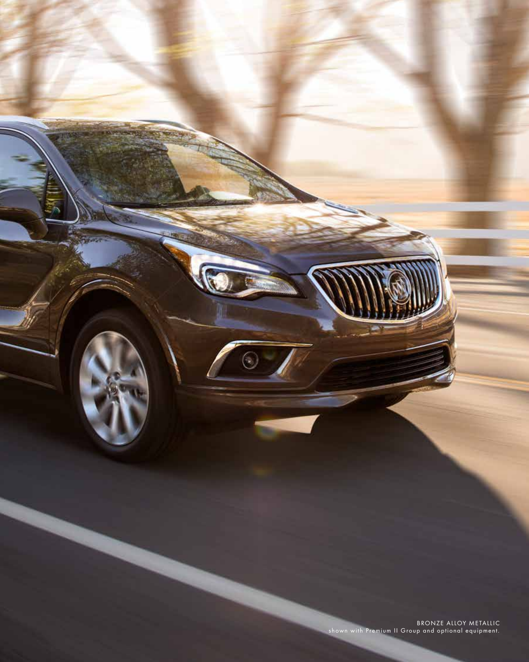
BRONZE ALLOY METALLIC shown with Premium II Group and optional equipment.