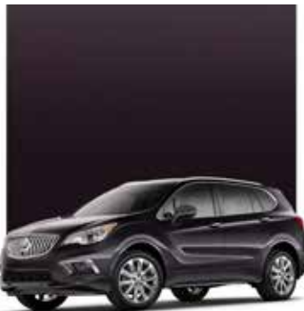
MIDNIGHT AMETHYST METALLIC 1