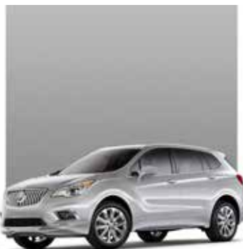
GALAXY SILVER METALLIC