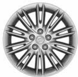
RQH 18" 10-SPOKE PAINTED ALUMINUM