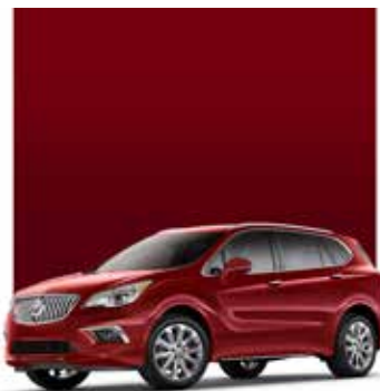
CHILI RED METALLIC 1