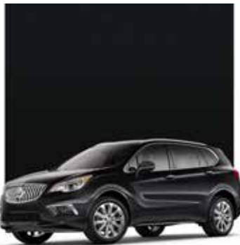
EBONY TWILIGHT METALLIC 1