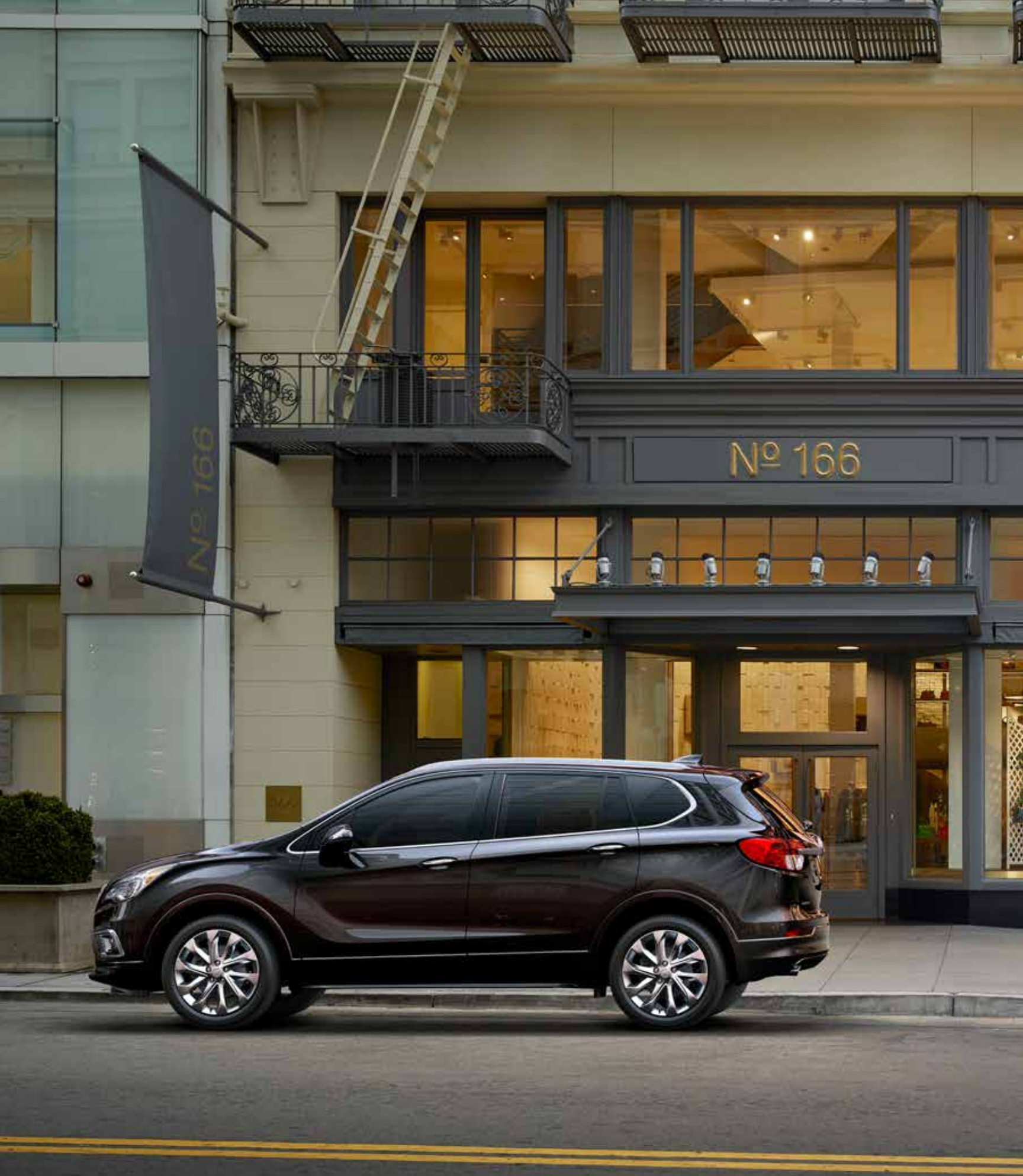
EBONY TWILIGHT METALLIC shown with Premium II Group and optional equipment.