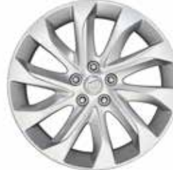
RT7 19" 10-SPOKE ALUMINUM WITH PREMIUM MANOOGIAN SILVER FINISH