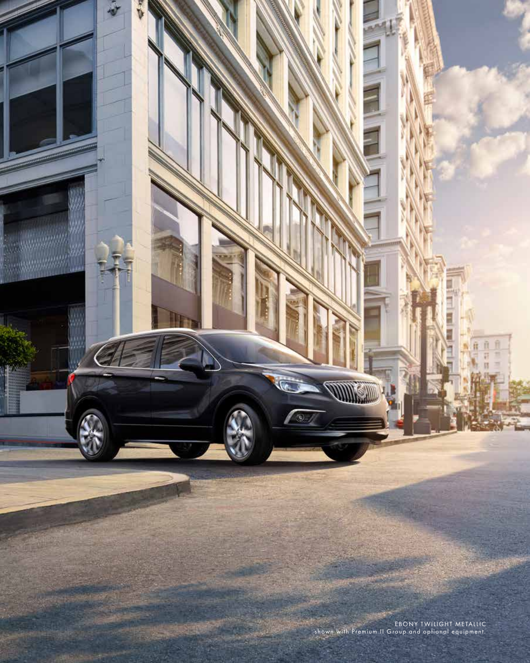
EBONY TWILIGHT METALLIC shown with Premium II Group and optional equipment.