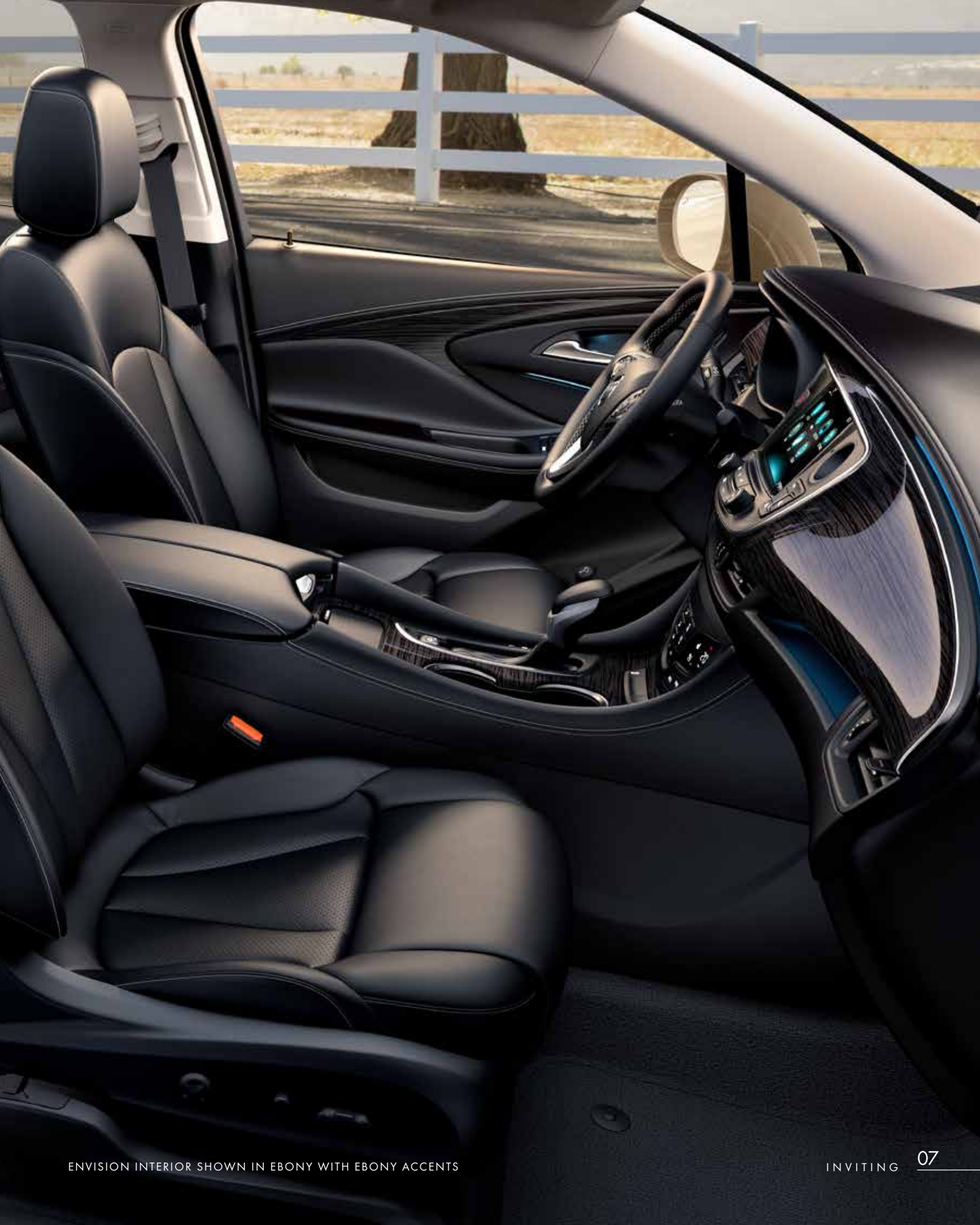
ENVISION INTERIOR SHOWN IN EBONY WITH EBONY ACCENTS