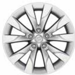
PZW 18" 10-SPOKE POLISHED ALUMINUM