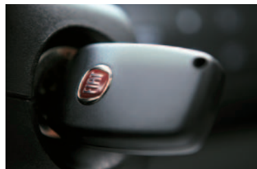
► Anti-theft engine immobiliser with rolling code