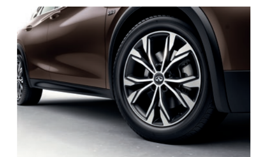
18" RESURFACED LIGHT ALLOY WHEELS WITH 5 DOUBLE-SPOKES, SNOWFLAKE DESIGN, 235/50R18 TYRES