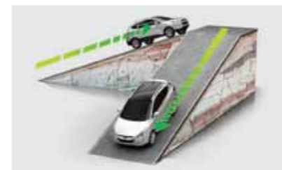
For greater stability on tricky surfaces, the 4WD system takes into account road condition, wheel speed and acceleration and distributes the torque between front and rear wheels.