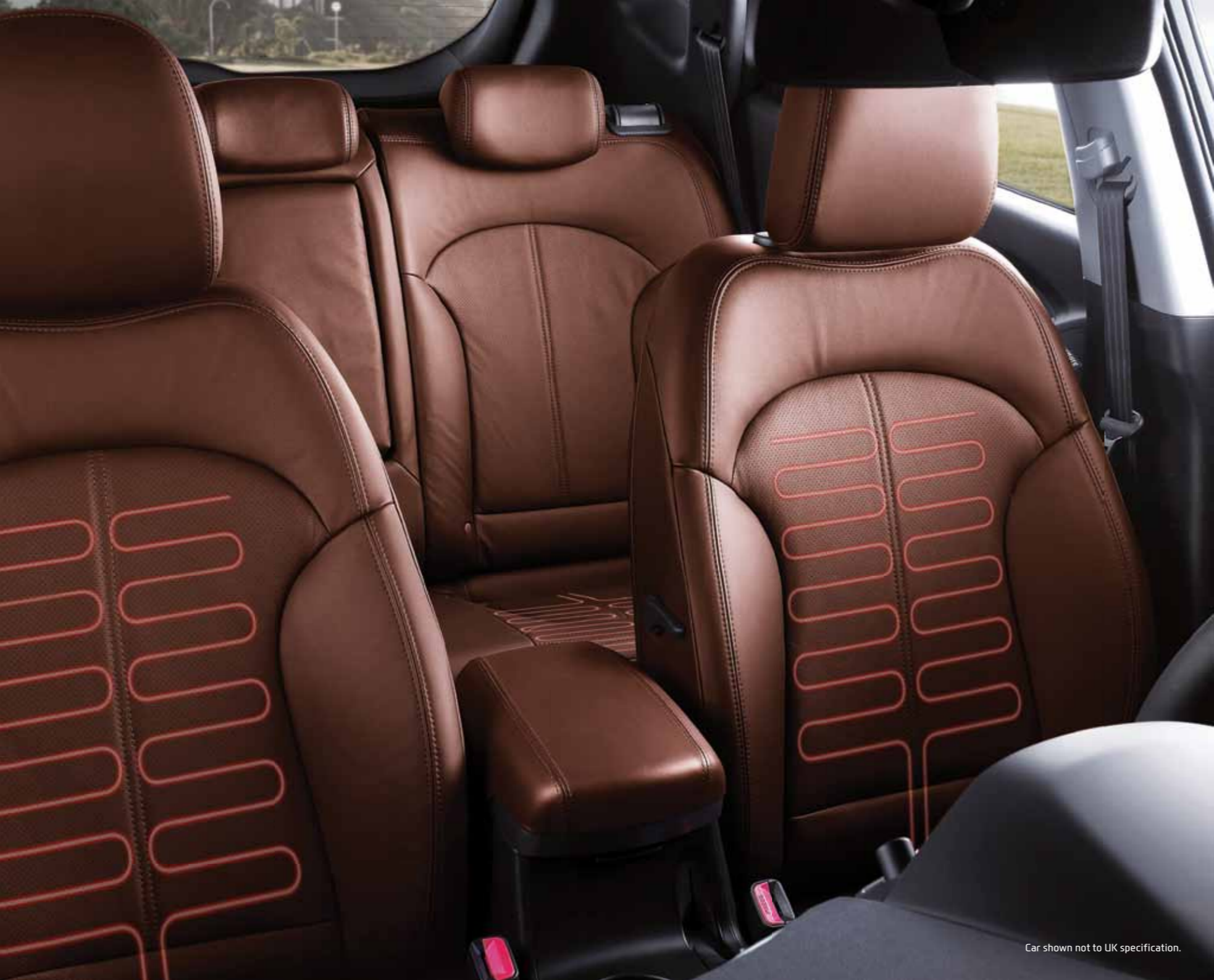
Car shown not to UK specification.