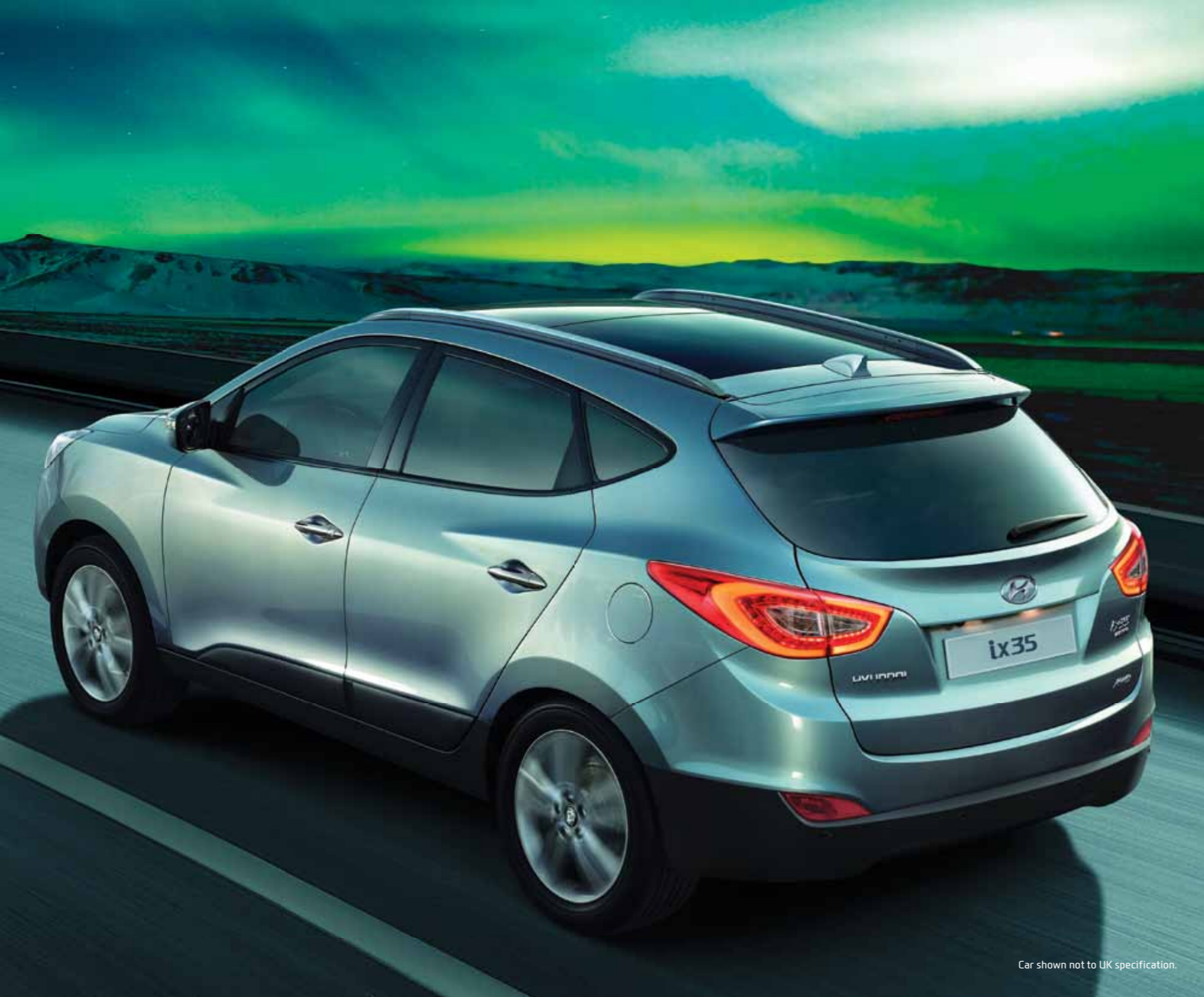
Car shown not to UK specification.