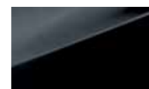
Phantom Black (PAE)