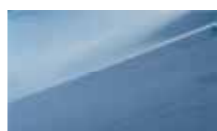
Ice Blue (XAF)