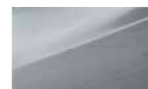
Sleek Silver (RAH)