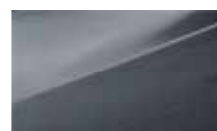
Steel Grey (ZAR)