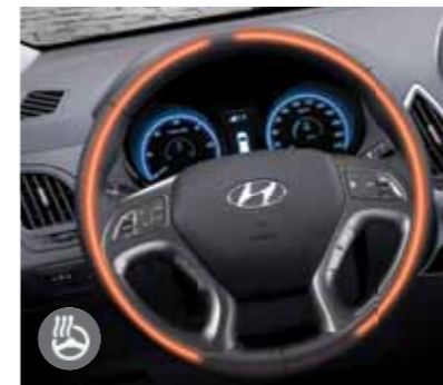
With air conditioning, luxury comes as standard.