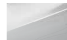
Creamy White (TCW)