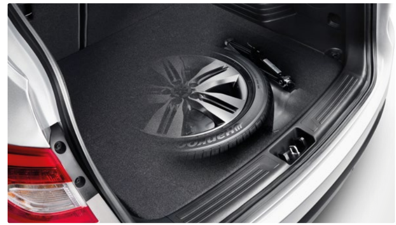
Full size alloy spare wheel – Available on all models