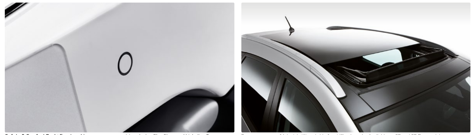
Safety & Comfort Pack: Front parking sensors, supervision cluster, Flex Steer and high-line Tyre Pressure Monitoring System (TPMS) with individual wheel warning – Available on SE, SE Nav, Premium and Premium Panorama models

Enhance your next adventure with a variety of optional extras. Select a panorama sunroof for better views of the great outdoors, choose privacy glass for a more private journey, and opt for the safety and comfort pack to make everything easier. As well as front parking sensors, supervision cluster and a high-line Tyre Pressure Monitoring System (TPMS), the pack also includes Flex Steer which lets you tailor your experience with three driving settings. In addition to normal mode, choose comfort mode for a practical journey around town, then switch to sport mode when you're ready to immerse yourself in the pure pleasure of driving.