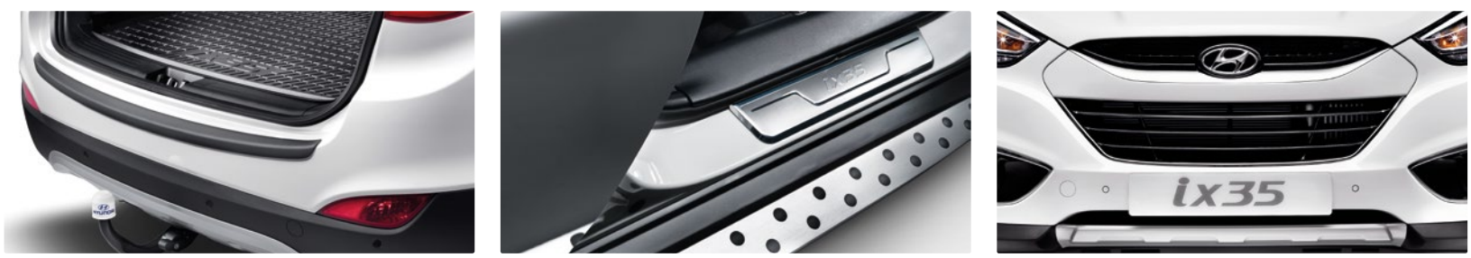
Entry guards and side steps – sport