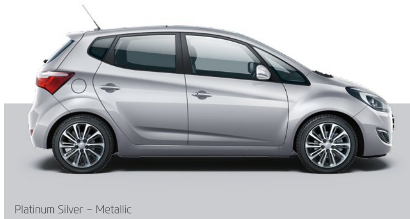
Platinum Silver - Metallic