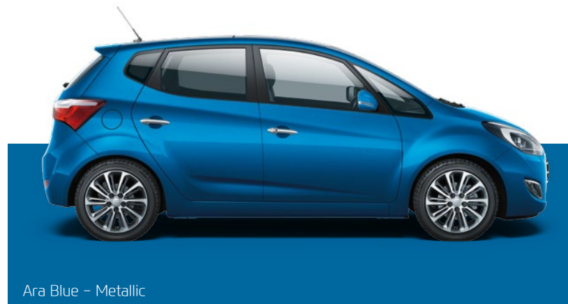
Ara Blue - Metallic