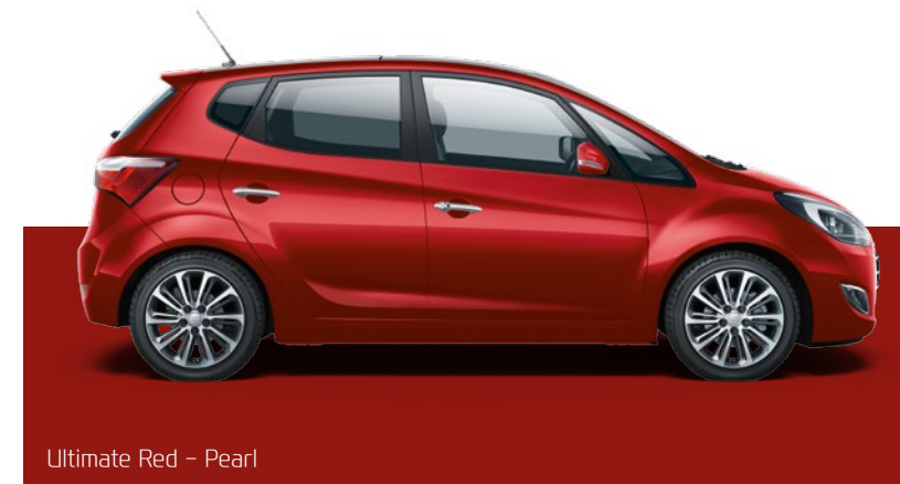
Ultimate Red - Pearl