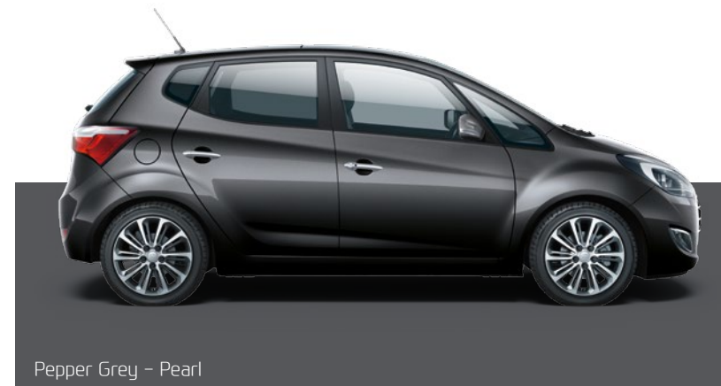
Pepper Grey - Pearl