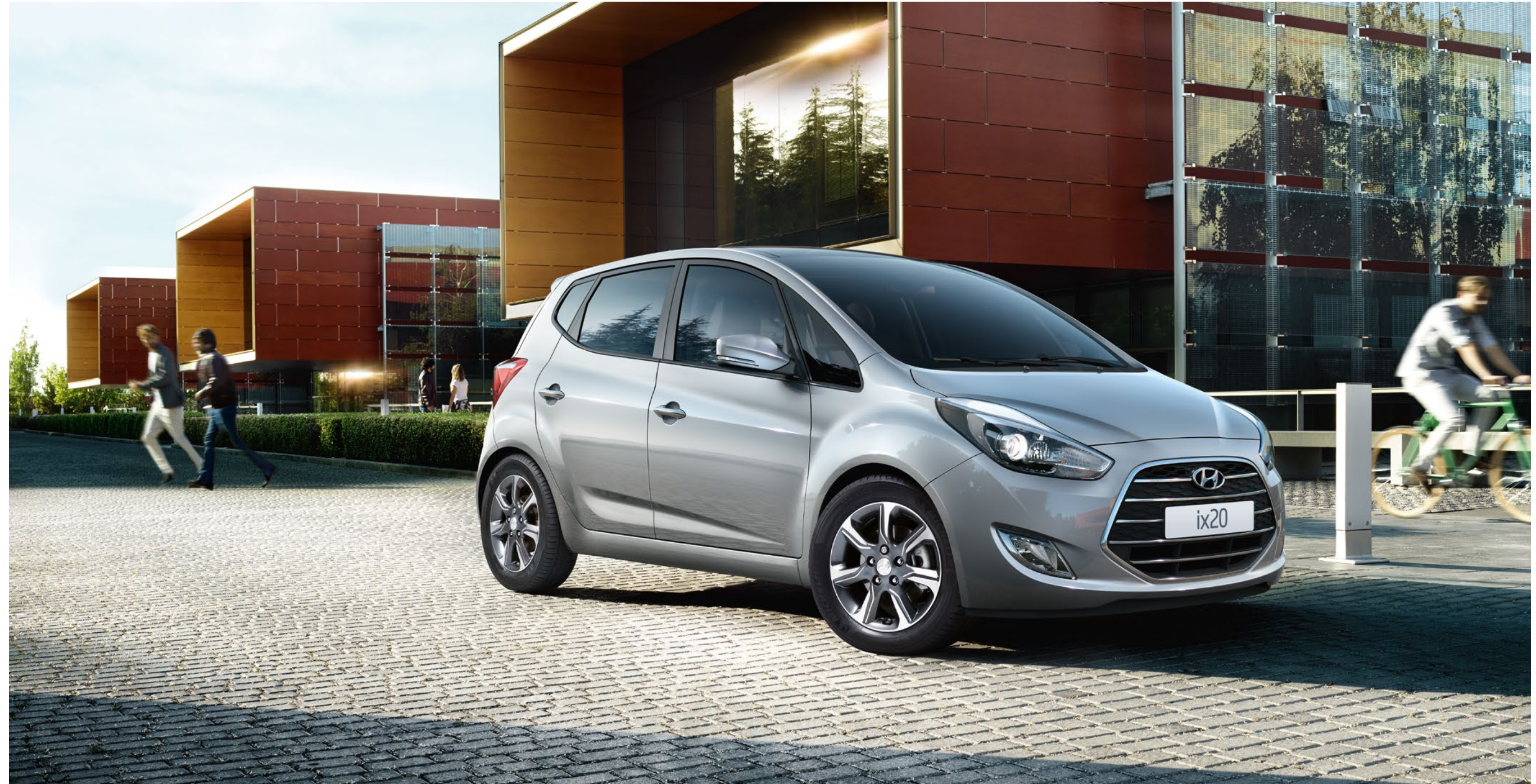
Car shown ix20 Premium in Platinum Silver metallic paint. Headlights shown not to UK specification.

The ix20 doesn't do boxy. Its dynamic design, spacious interior and efficient drive are enhanced by all the clever little extras inside. It's the stand-out car in its class.