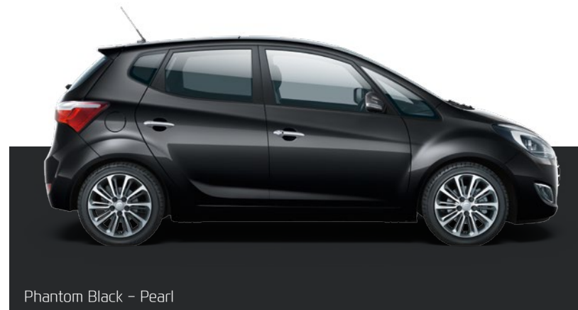
Phantom Black - Pearl