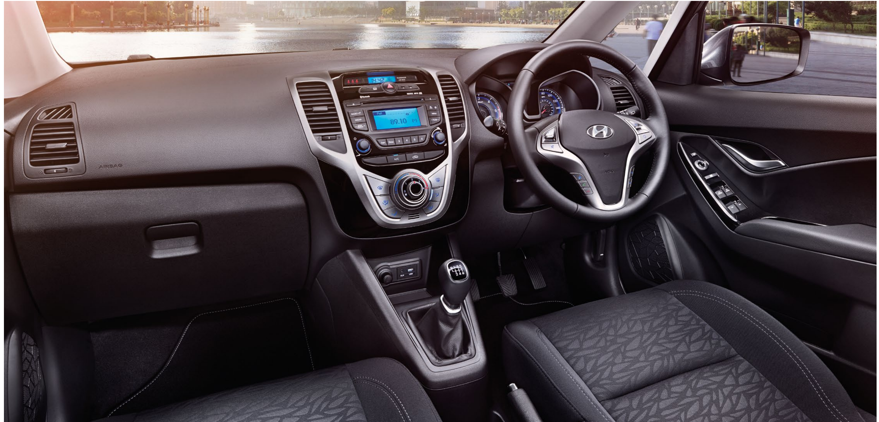
Car shown ix20 Premium.

You'll quickly notice the cool blue illumination of the instrument panel, while the soft touch feel of the dashboard adds to the smart ergonomics and quality design. Once you're sitting comfortably you'll be able to find the perfect temperature thanks to air conditioning. USB and aux connections allow you to plug in your compatible phone or MP3 player and listen to all your favourite songs. Enjoy a range of impressive features as standard, including Bluetooth® connectivity with voice recognition. Steering wheel audio controls also mean you can keep your ears trained on the music, and your eyes focused on the road ahead. And when you finish your journey, rear parking sensors help you to fit into the tightest of gaps.