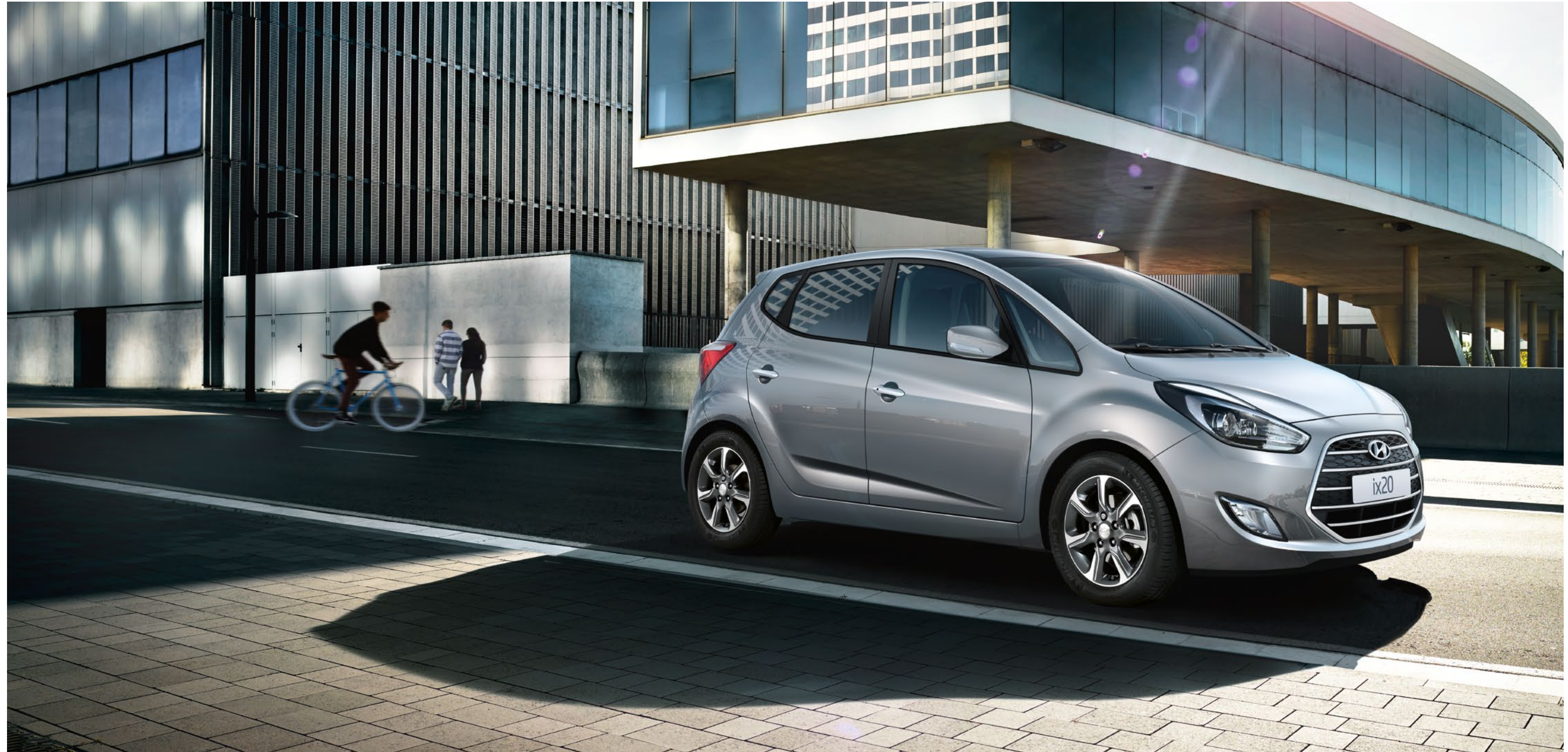
Car shown ix20 Premium in Platinum Silver metallic paint. Headlights shown not to UK specification.

The ix20 manual models include Intelligent Stop and Go (ISG), which automatically stops the engine when you come to a halt, and restarts it again when you de-press the clutch. It also has low rolling resistance tyres and electric power assisted steering, which is quieter, lighter and saves energy – ultimately reducing emissions. As well as the 1.6 diesel Blue Drive, you can opt for a 1.6 petrol automatic or a 1.4 petrol manual. If you select manual transmission you'll also benefit from an eco-drive indicator which suggests the optimum time to change gear for maximum efficiency. It's our way of giving you more influence over your fuel consumption. With a range of high-tech engines optimised for greater economy, the ix20 is a perfect example of our fuel-saving philosophy.