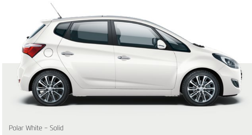
Polar White - Solid