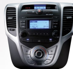
Alloy effect facia trim