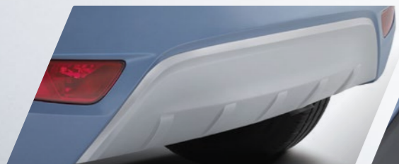
Rear skid plate