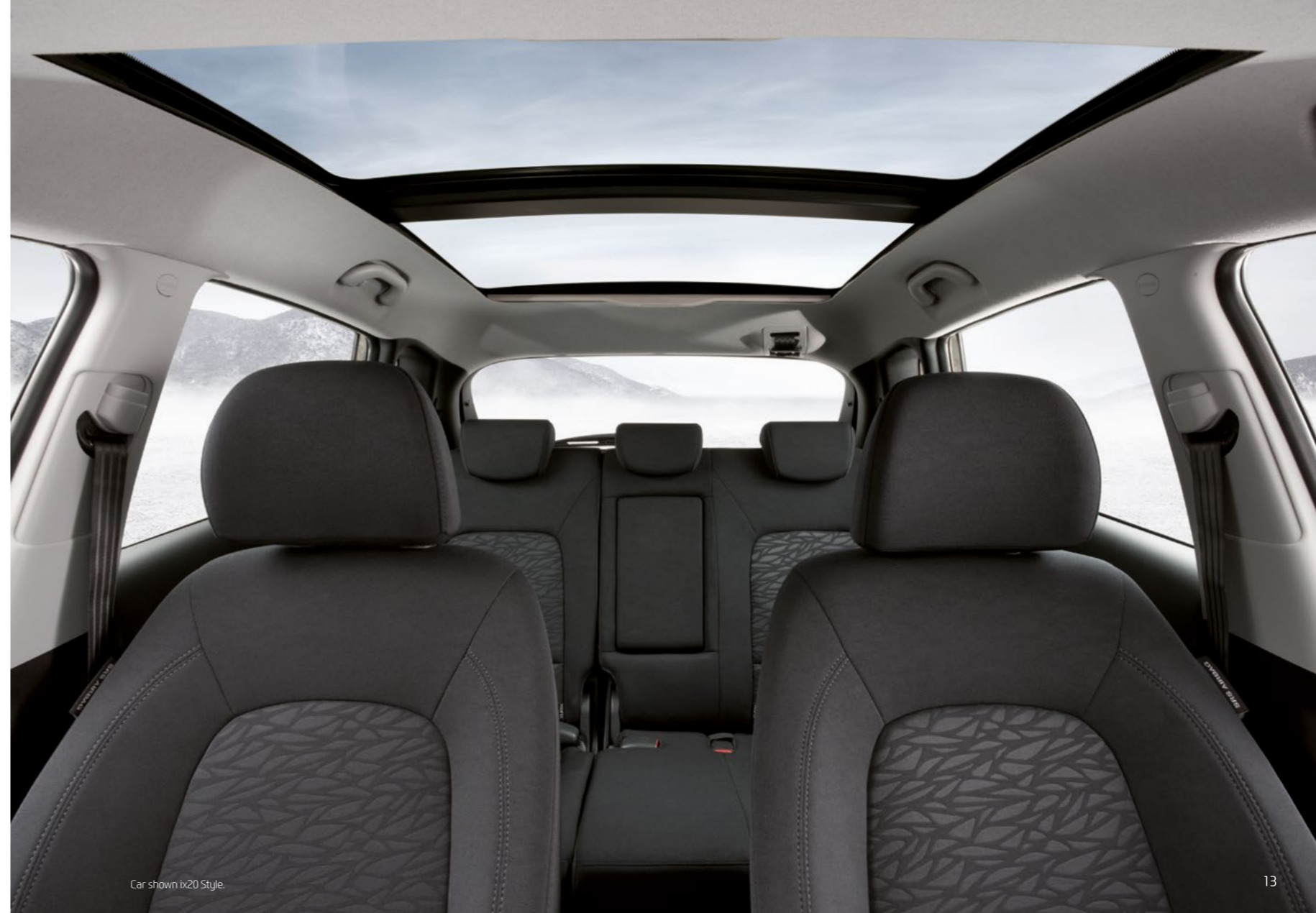
Car shown ix20 Style.

find the perfect temperature thanks to air conditioning. It means you can enjoy a hot blast of air to warm you up for winter, or a cool, refreshing breeze during the summer months. On the Style, you'll also benefit from a sophisticated panoramic sunroof that creates the feel of space and light, as well as stylish privacy glass to reduce the sun's rays and keep you cool on the inside. You can sit back, relax and simply enjoy the ride.