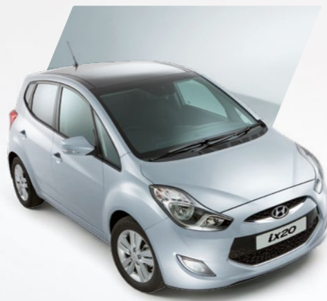
Sleek Silver - Metallic