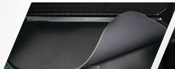
Boot mat – reversible