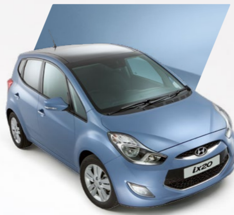
Ice Blue - Metallic