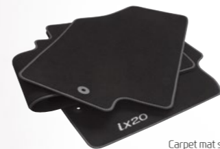
Carpet mat set