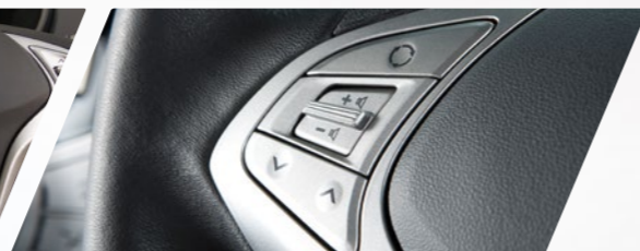
Steering wheel audio controls