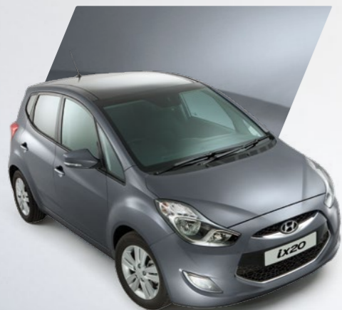
Steel Grey - Metallic