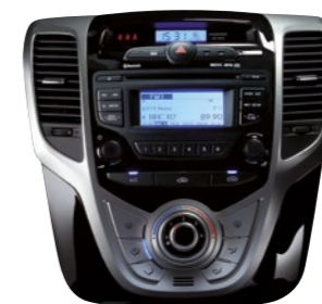
Gloss black and alloy effect facia trim