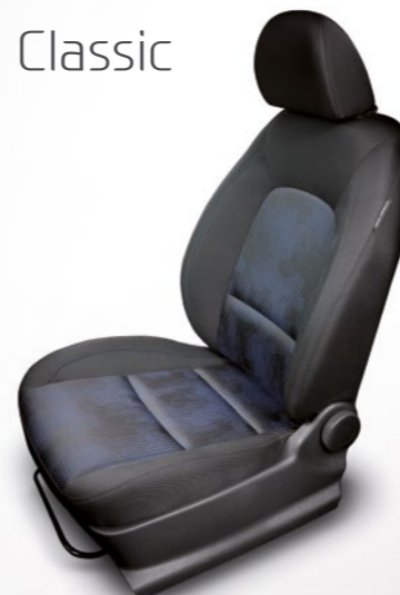
Black cloth with black and blue pattern detail