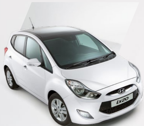
Creamy White - Solid