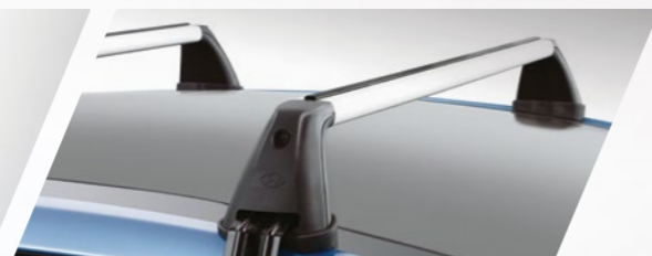
Roof bars – aluminum