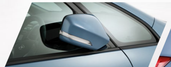
Electrically heated folding door mirrors