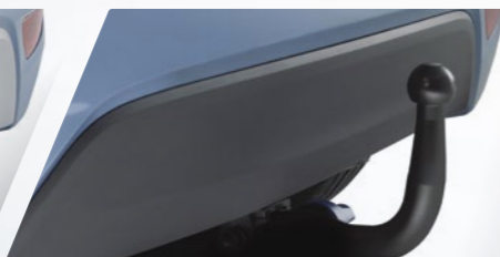
Tow bar – detachable