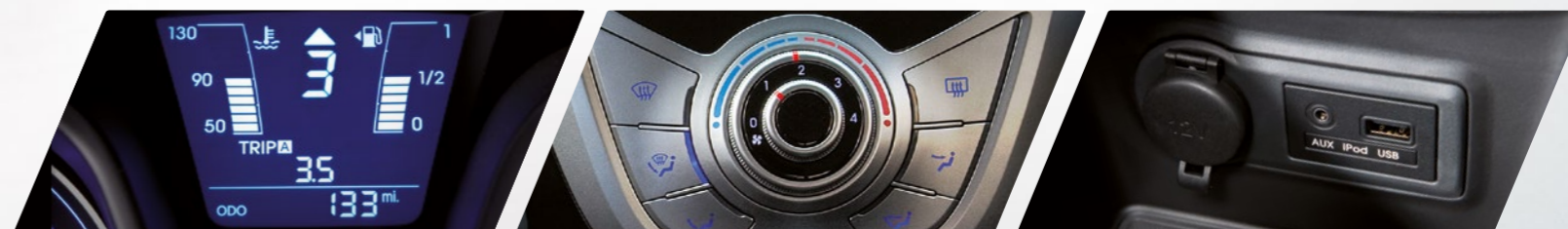
Eco drive indicator (*not available with automatic transmission)