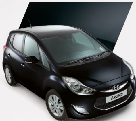
Phantom Black - Metallic