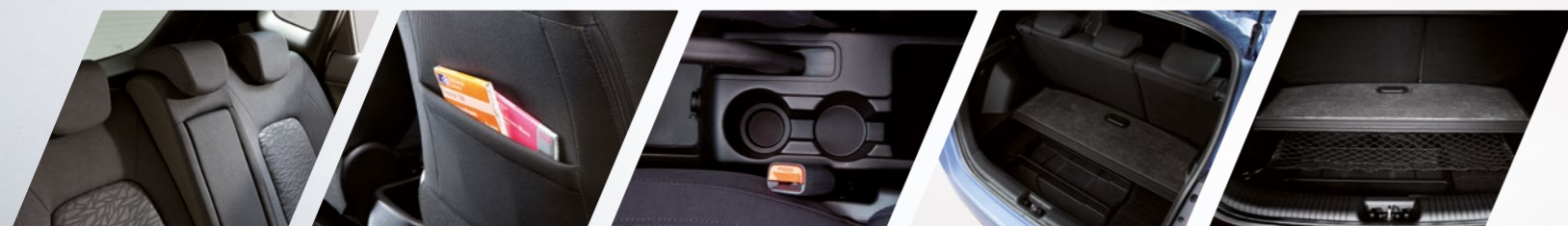
Sliding and reclining rear seat HYUNDAI ix20