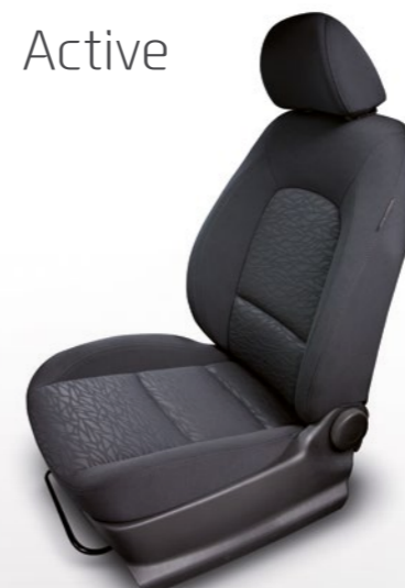
Black cloth incorporating eco pattern design