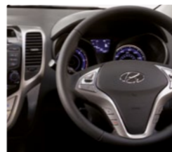
Leather steering wheel