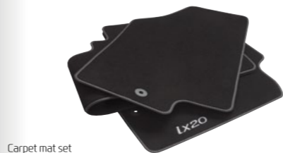
Carpet mat set