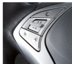
Steering wheel audio controls