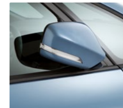
Electrically heated folding door mirrors