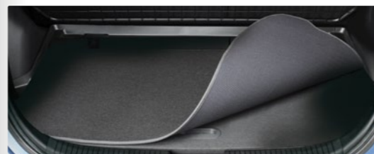
Boot mat – reversible