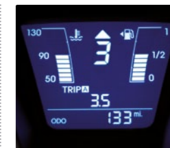
Eco drive indicator*

* Not available with automatic transmission.