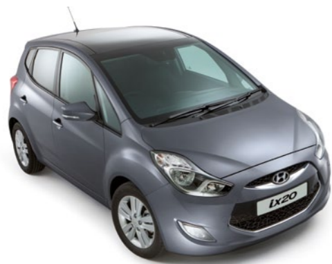
Steel Grey - Metallic