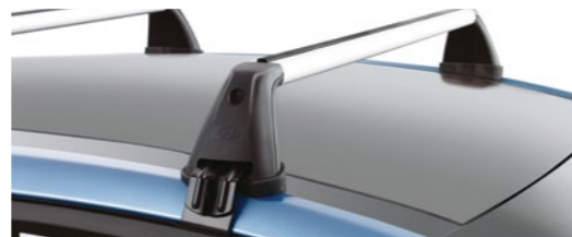
Roof bars – aluminum