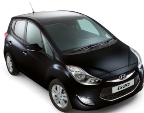
Phantom Black - Metallic