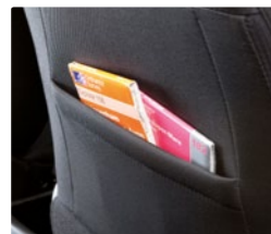
Front seat back pockets