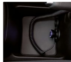
Change to 12v Power outlets (front and boot)