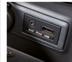
USB & aux connections