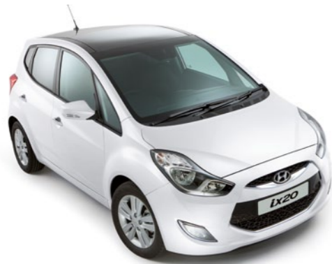
Creamy White - Solid