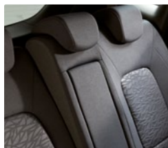
Sliding and reclining rear seat