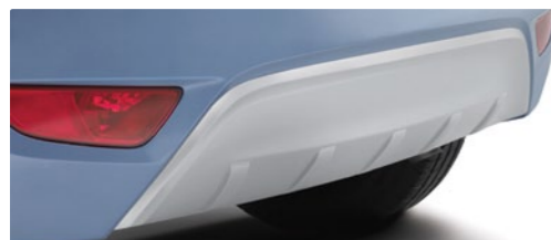
Rear skid plate