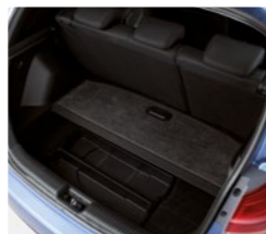
Adjustable boot floor