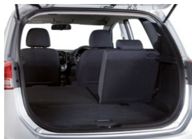
Seat Configuration 3