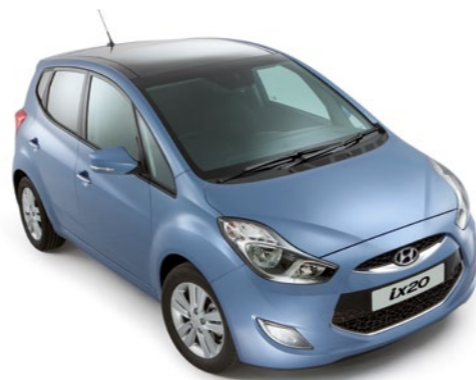
Ice Blue - Metallic