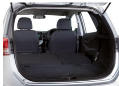
Seat Configuration 4