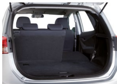
Seat Configuration 2