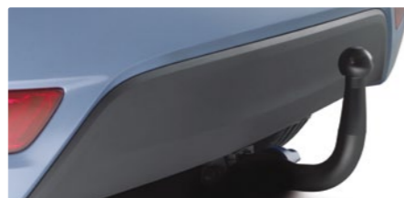
Tow bar – detachable