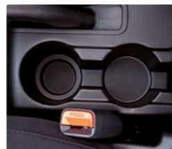
Front cup holders