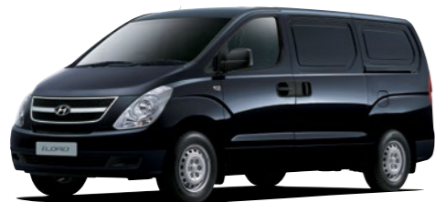
Timeless Black - Mica