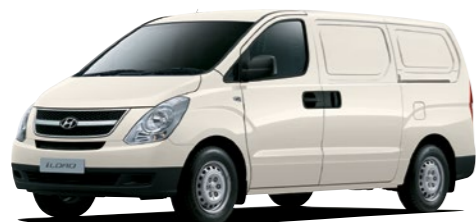
Creamy White - Solid