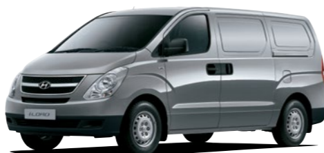
Hyper Silver - Metallic