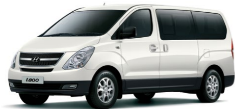
Creamy White - Solid