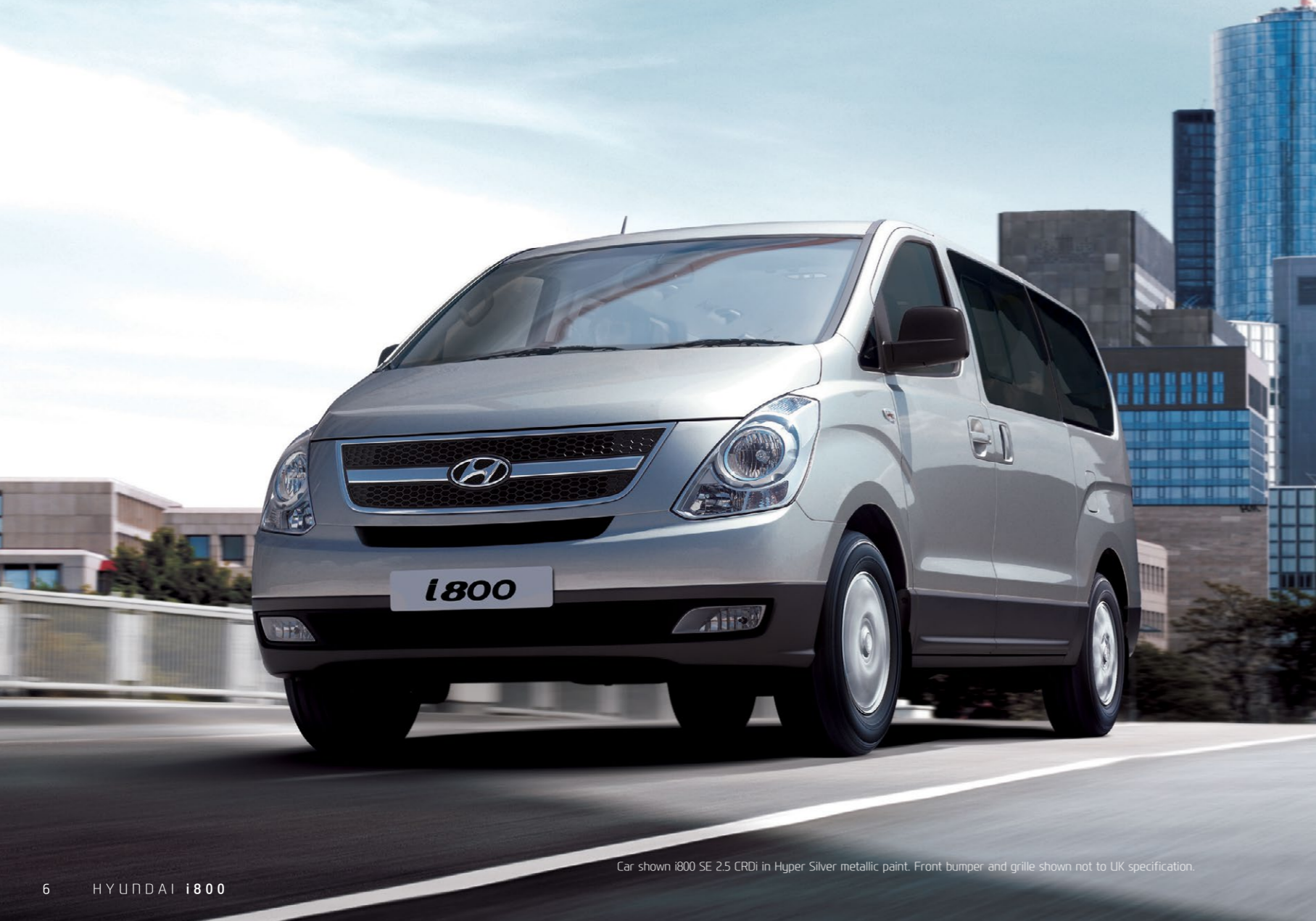
Car shown i800 SE 2.5 CRDi in Hyper Silver metallic paint. Front bumper and grille shown not to UK specification.