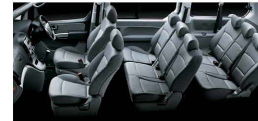
Eight seat configuration

The i800's interior is just as refined as the exterior. The eight seats provide useful practicality and maximum comfort at the same time. The second row slides and reclines, while the third row also reclines. It'll enable your passengers to find the perfect position with generous leg, head and shoulder room. For an even more relaxing journey, the second row of passengers will also be able to alter the air conditioning settings so they can find the ideal temperature. If there happens