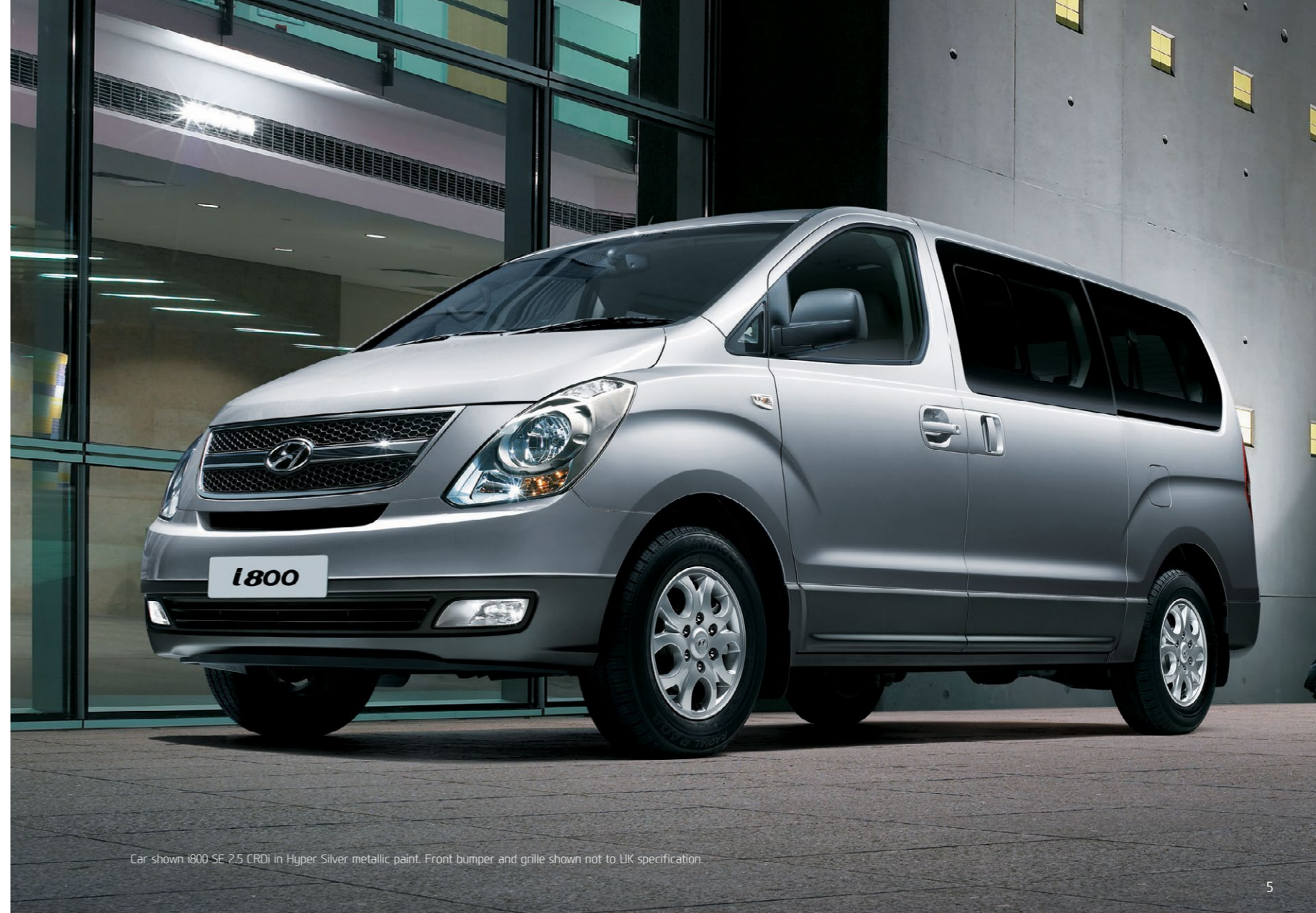
Car shown: i800 SE 2.5 CRDi in Hyper Silver metallic paint. Front bumper and grille shown not to UK specification.

outputs - either 136PS or 170PS - so you'll have all the performance you need. There are also manual and automatic transmission options too. We've incorporated an Electronic Stability Programme (ESP), Anti-lock Braking System (ABS), Electronic Brake force Distribution (EBD) and Traction Control System (TCS), so you'll enjoy a safe journey. And when you come to a stop, you'll take advantage of the body-coloured reversing sensors to guide you into the tightest gaps. It's a stylish, spacious vehicle that's perfect for every occasion.