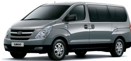
Hyper Silver - Metallic