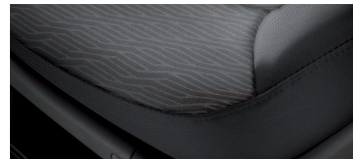
Cloth Seat Trim

Front bumper and grille shown not to UK specification.