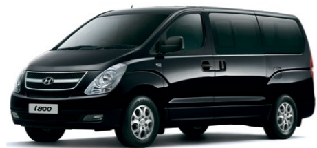
Timeless Black - Mica

Customise your i800 by selecting your favourite colour from the range.