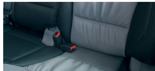
Leather Seat Trim (seat facings only). Available at extra cost.