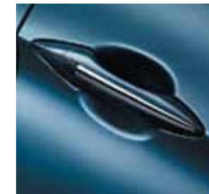
Door handles with chrome inserts