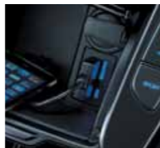
USB & aux connections