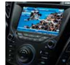
Touchscreen satellite navigation