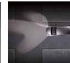
Adaptive front lighting system