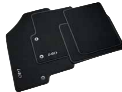
Carpet mat set