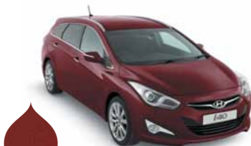
Red Awesome – Pearl