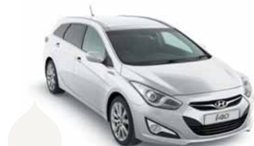
Creamy White – Solid