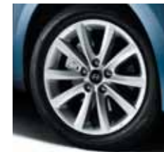
17-inch alloy wheels (not Blue Drive model)