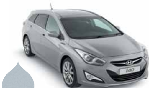
Sleek Silver – Metallic