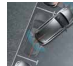
Smart parking assist

The Assist pack simply helps you out as much as possible. A tyre pressure monitoring system alerts you of low tyre pressure to ensure they're always at the optimal level – perfect for saving fuel and tyre tread, as well as giving you more grip for a safer drive. You'll also benefit from the lane departure warning system that signals if you accidentally drift out of your lane, whilst smart parking assist detects suitable spots using sensors and steers the car into the space automatically.