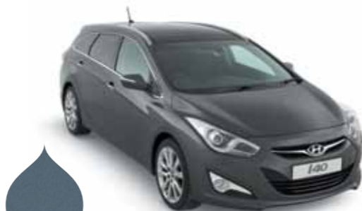
Titanium Silver – Metallic

It's all about choice in the Hyundai i40. Once you've decided on your preferred model, you'll either have black cloth upholstery on Active and Style, or black leather upholstery on Premium. Then, you'll have to pick a colour for the exterior. From a fresh Creamy White to a moody Total Black, you can make your car look exactly the way you want.