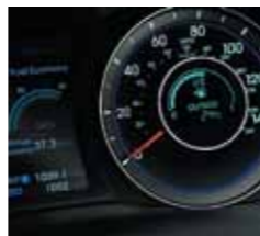
Supervision instrument cluster with LCD