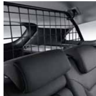
Dog guard – Tourer only