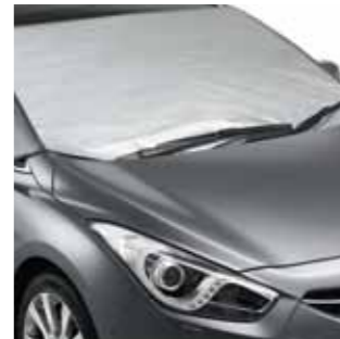
Ice and sun screen – Tourer only