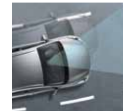
Lane departure warning system