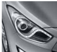
LED daytime running lights