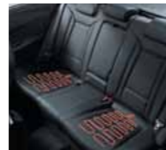
Heated rear seats (outer seat bases only)