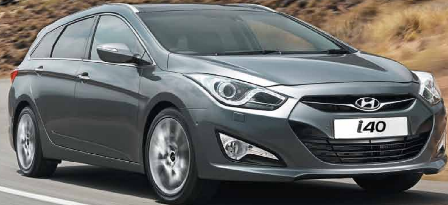
Car shown i40 Tourer Premium in Titanium Silver metallic paint.

Highlighting some of the key features that can be found on the i40.