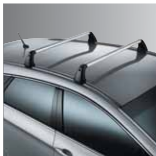
Roof rack – Tourer only