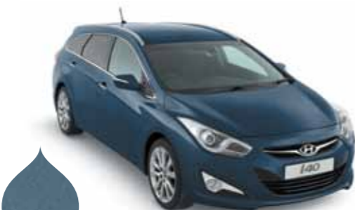
Blue Spirit – Pearl