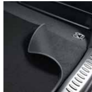
Reversible boot mat – Tourer only