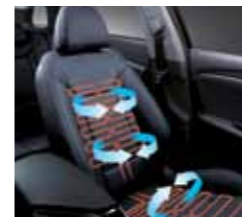
Ventilated front seats

As the name suggests, this package is all about making sure you and your passengers experience as much luxury and comfort as possible. As well as heated rear seats, there's also ventilated front seats for you to enjoy, which either heat up or cool you down, depending on the environment. Not to mention a heated leather steering wheel that'll make all the difference on cold, icy mornings.