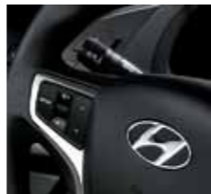
Audio controls on steering wheel