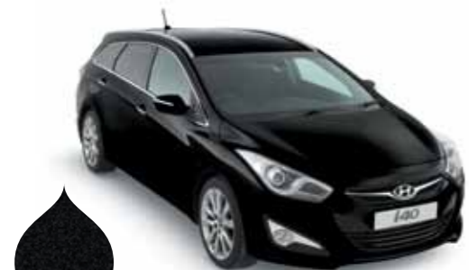
Total Black – Pearl