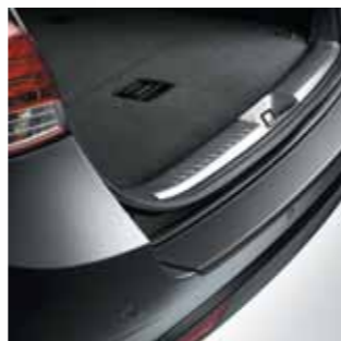
Bumper protector – Tourer only