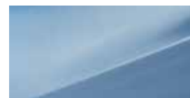
Ice Blue (XAF)