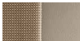
Beige Cloth / Leather