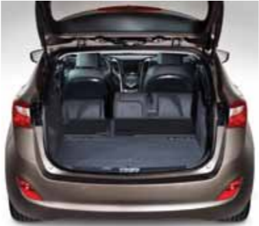
Full flat luggage compartment

Full-flat floor as standard. To maximise the amount of available cargo space, the i30 Wagon offers the option of an innovative full-flat cargo floor. When folded down, the 60/40 split rear seats create a completely level floor which increases the total cargo area to a massive 1.642 litres. The flat floor also makes loading and unloading easier.