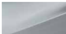
Sleek Silver (RAH)