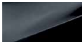
Phantom Black (PAE)