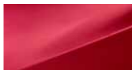
Cool Red (TWR)