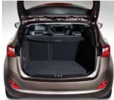
Rear seats up