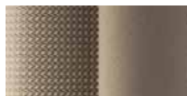
Beige Cloth (GLS)