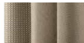
Beige Cloth (GL)