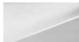
Creamy White (TCW)