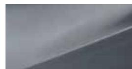
Steel Gray (ZAR)