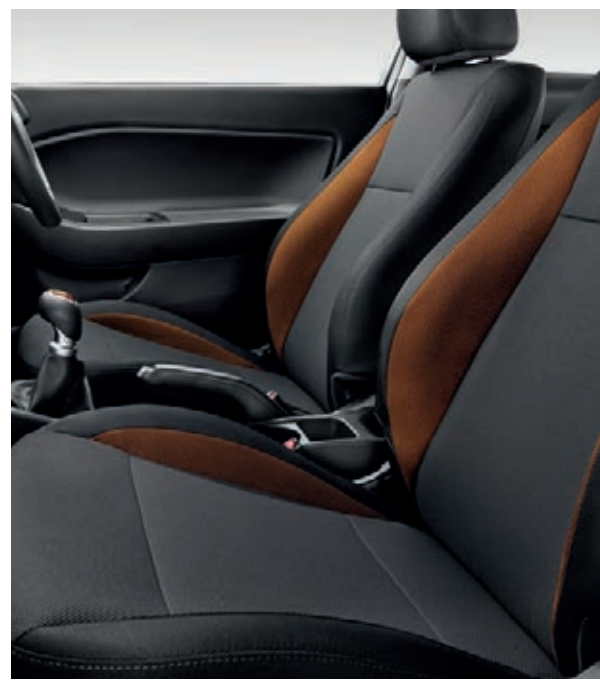
Tangerine Orange – Pearl