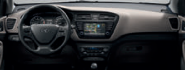
Elegant Beige Interior colour package