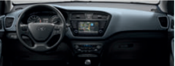
Grayish Blue Interior colour package