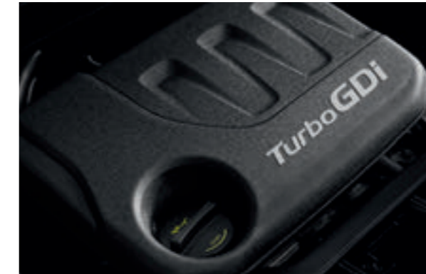
Concentrated turbo power. The 1.0 T-GDi 100 PS engine is tuned for optimal fuel economy, while the 120 PS unit is engineered to deliver even more spirited performance for the enthusiastic driver.

With its strikingly confident crossover styling the i20 Active immediately attracts attention. Yet its appeal goes way beyond its design, because it delivers all the performance that its bold looks promise, thanks to the availability of an all-new turbocharged 1.0-litre T-GDi petrol engine. This extremely light and compact power plant is capable of extracting more lively performance from every drop of fuel.