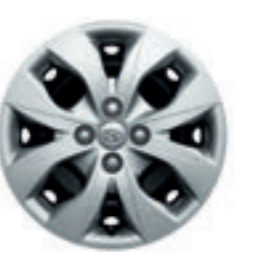
15" Steel Wheels