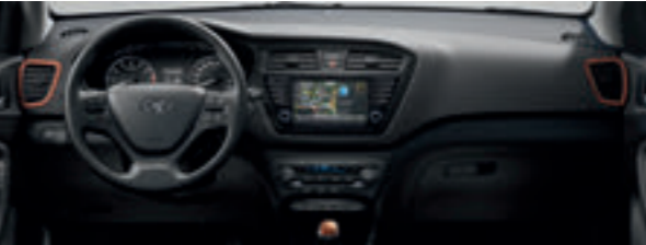
Colour Pack Adds orange accents to the interior