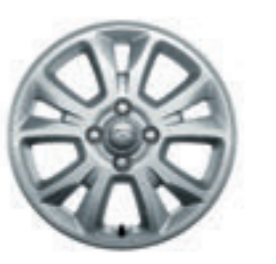
15" Alloy Wheels