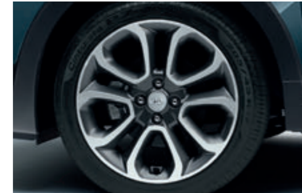
Bespoke alloy wheels. The specially designed 17" alloy wheels add an extra touch of rugged dynamism. Only available on the i20 Active.