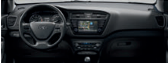
Comfort Grey Interior colour package