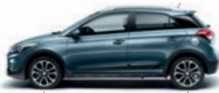
2570 mm 4065 mm