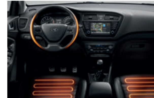
Heated steering wheel and front seats. Nothing is more welcoming on a cold winter morning than the welcoming warmth of a steering wheel and seats that are heated.