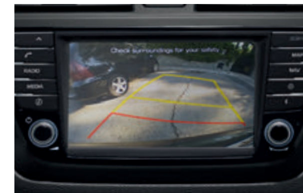
Rear view camera. For easier reversing into confined spaces. Image displayed on navigation screen or interior rear-view mirror.