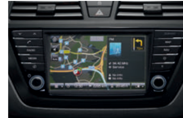
TomTom® LIVE Services. A free 7-year subscription to TomTom® LIVE Services provides precise information about traffic, speed cameras*, weather and local facilities, all displayed on the 7" colour TFT LCD touch-screen. Connectivity is assured by Bluetooth®, USB and AUX ports.

The fun you'll have driving is boosted by the navigation system that offers a world of information via TomTom® LIVE Services. And the advanced audio system includes phone connectivity and integrated 1 GB music storage. So you'll always be entertained, informed and in touch. Other high-end features such as heated front seats will keep you warm during colder months while the rear-view camera helps to take the stress out of reverse parking.