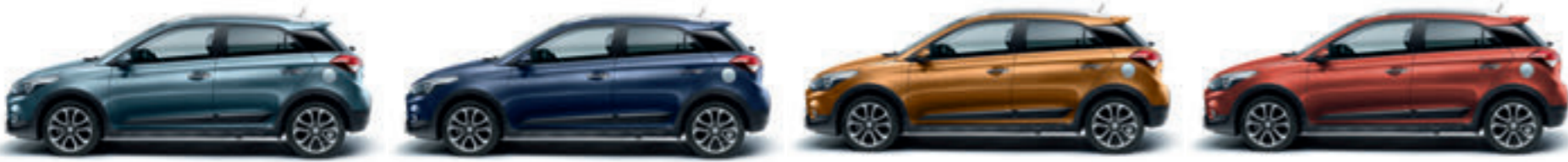
Aqua Sparkling Metallic Morning Blue Metallic Mandarin Orange Pearl Tangerine Orange Metallic