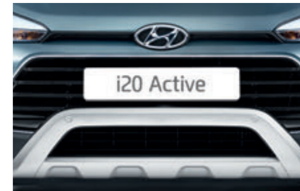
Front and rear skid-plates. The robust character of the i20 Active is confirmed by the prominent skid-plates integrated into the front and rear bumpers.