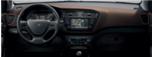
Cappuccino Interior colour package