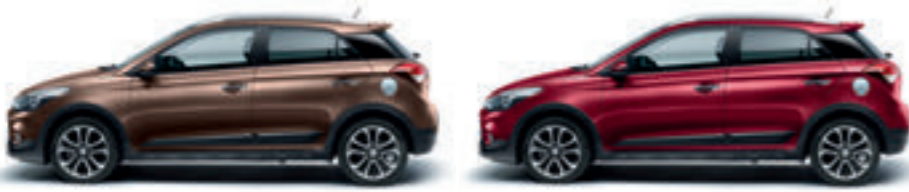
Iced Coffee Metallic Red Passion Pearl