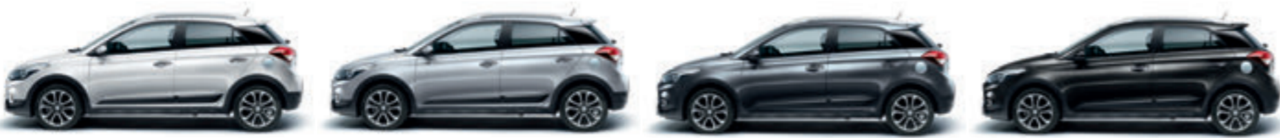
Polar White Solid Sleek Silver Metallic Star Dust Metallic Phantom Black Pearl

We're all different, and we all have our own preferences and priorities. The i20 Active is available in a range of exterior colours that enhance its adventurous spirit. There are four interior colour packages and a unique option that includes Tangerine Orange highlights. You can also add further personal touches with your choice of optional equipment and accessories. Your local Hyundai dealer will help and advise you with your selection.