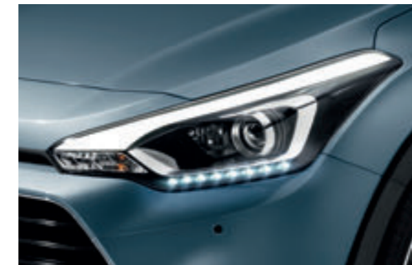
Dynamic headlamps. The efficient bi-function projector headlamps incorporate stylish LED positioning lamps and LED daytime running lights.