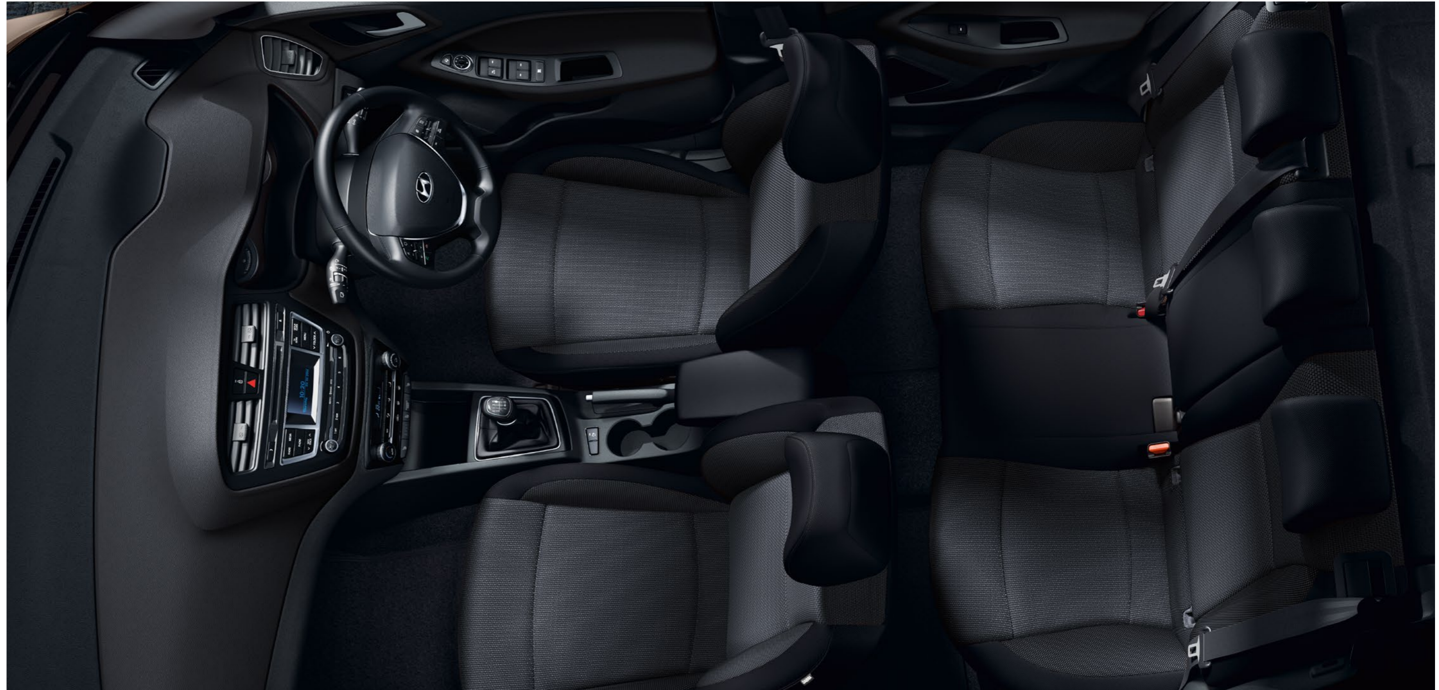
Car shown i20 Premium SE with Black Grey interior. Image excludes smartphone docking station. Not to UK specification.

The stylish panoramic sunroof on Premium SE and Premium SE Nav creates the illusion of space. It floods the cabin with light and gives you a great view of the world outside. You'll also enjoy the comfort of air conditioning on S Air, SE and Active, and you can optimise your environment perfectly thanks to climate control on all Premium models. With a large, spacious boot, and seats that fold flat for that extra bit of room, you'll appreciate excellent flexibility at all times.