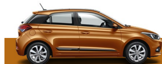
Mandarin Orange – Pearl (Available on SE and all Premium models)