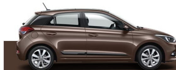
Iced Coffee – Metallic (Available on SE and all Premium models)