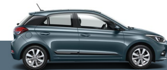
Aqua Sparkling – Metallic