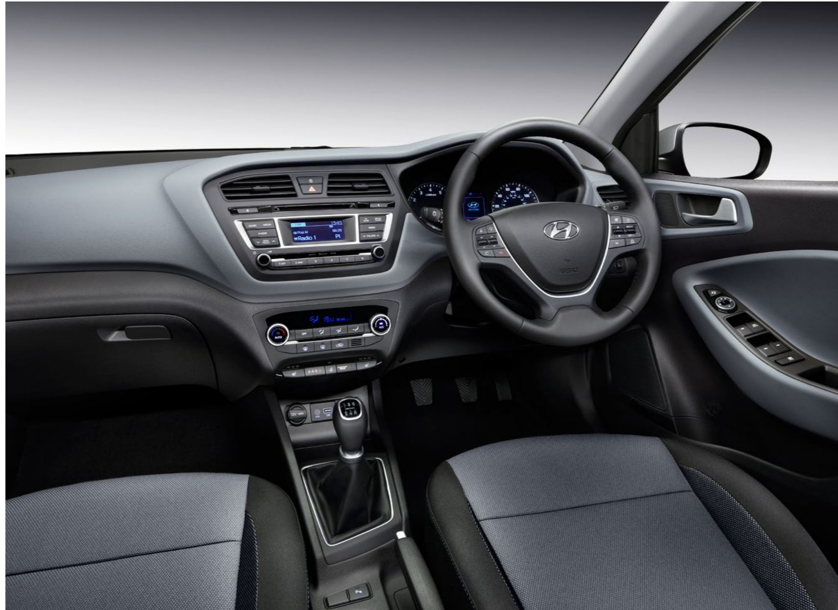
Grey Blue Available on S, S Air, SE, Premium*, Premium Nav*, Premium SE*, Premium SE Nav* 5 door with these exterior colours: