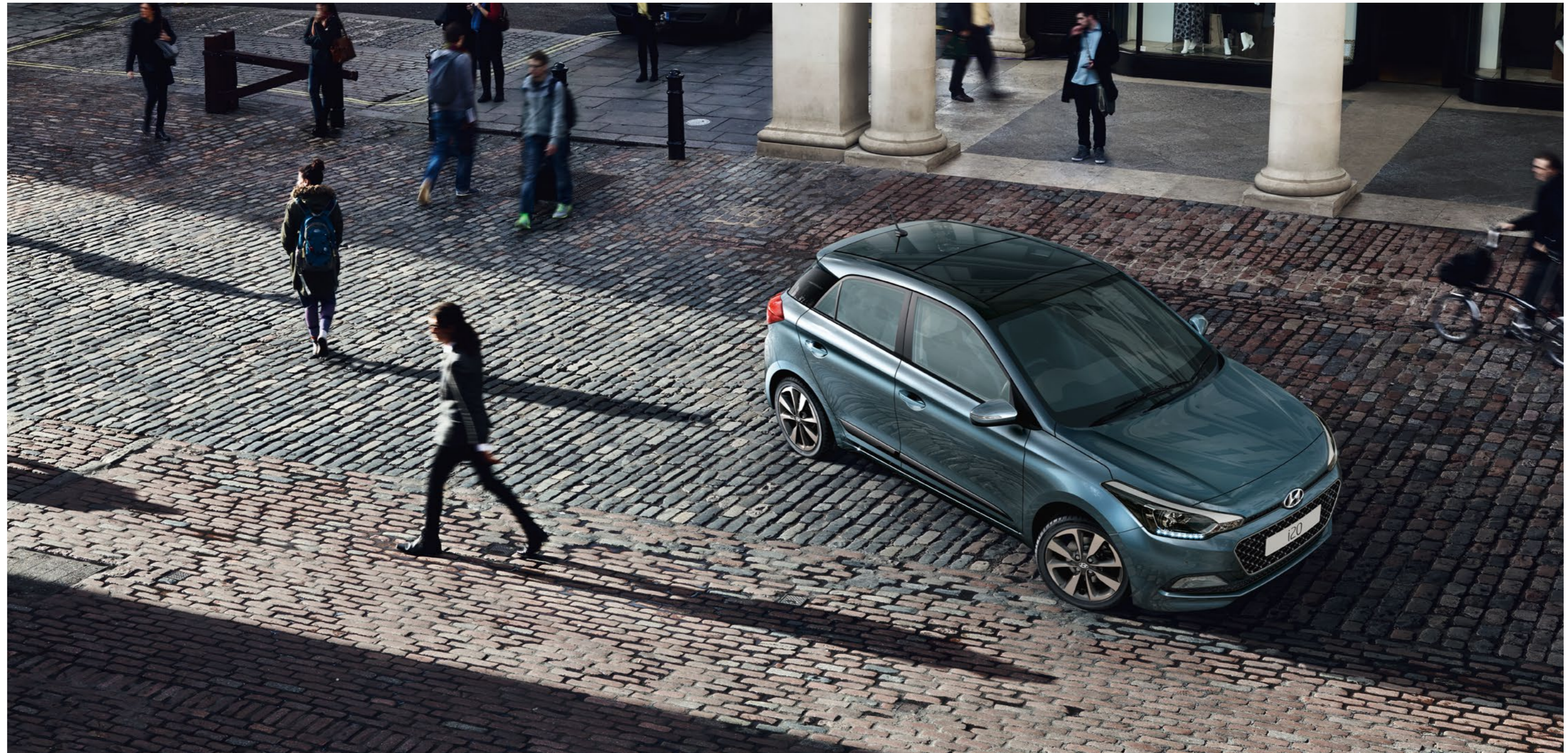
Car shown i20 Premium SE 1.2 in Aqua Sparkling metallic paint.

Every aspect of the i20 exudes finesse, with intuitive new features to discover on each trip. It'll start as something with poise and refinement, and grow over time to become a part of the family.