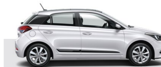
Polar White – Solid

Bar type front grille is standard in conjunction with 1.0 Turbo GDi engine.