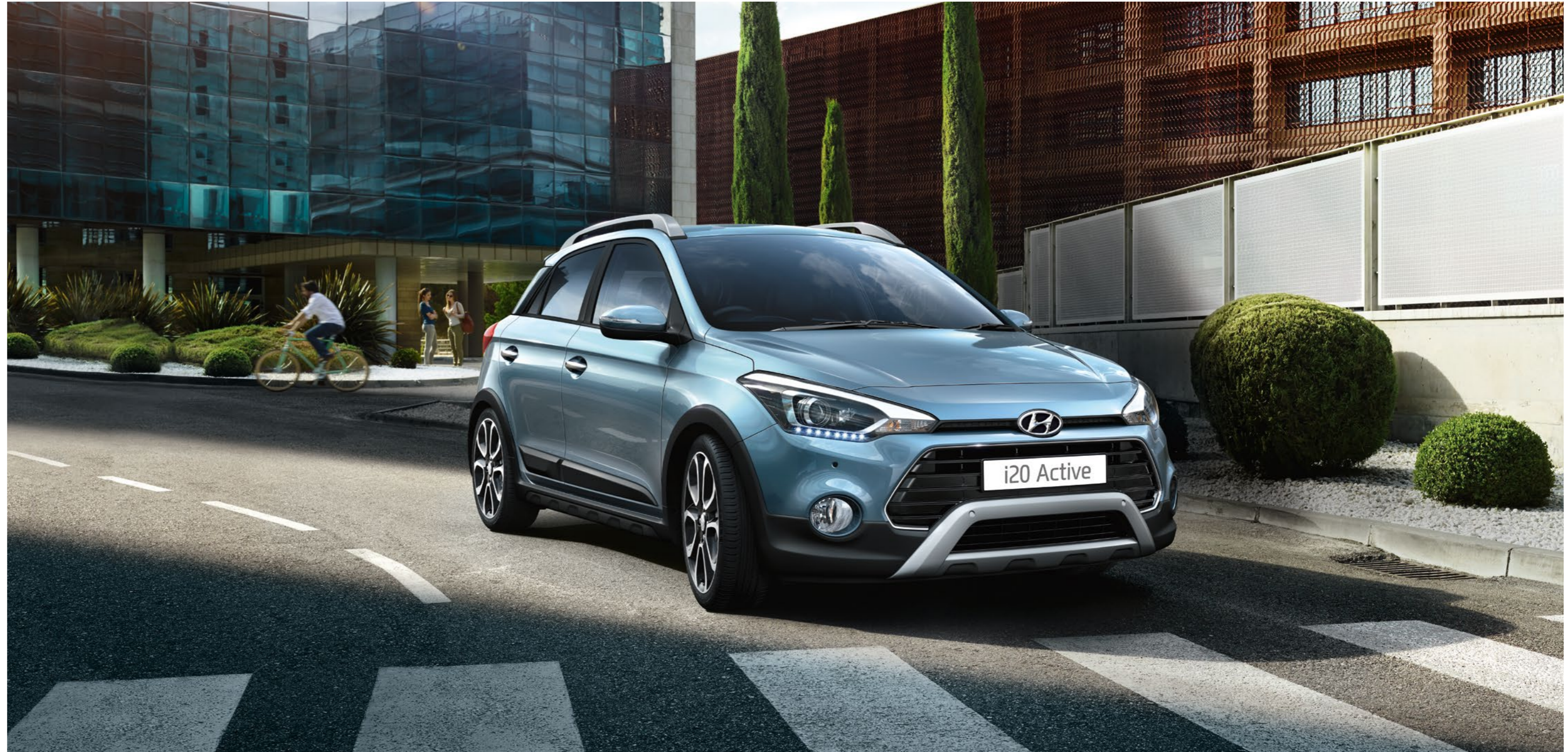
Car shown i20 Active in Aqua Sparkling metallic paint.

The i20 Active commands respect from the moment you lay eyes on its unique front and rear bumpers, skid plates, stylish wheel arches and sill moulding — plus its highly practical roof rails. If the exterior suggests an active lifestyle, then its interior only enhances this feeling, thanks to a higher driving position for extra authority and a 20mm raised suspension that provides an even better view of the road ahead. Ideal for driving around town, you'll also respect its versatile capabilities when you fancy taking it further afield. Fit in your friends and luggage and make the most of this impressively compact crossover.