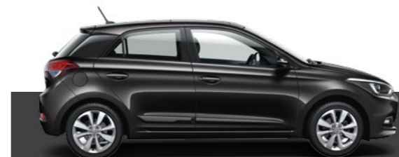
Phantom Black – Pearl