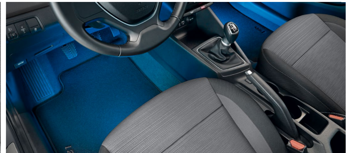
Interior LED lighting