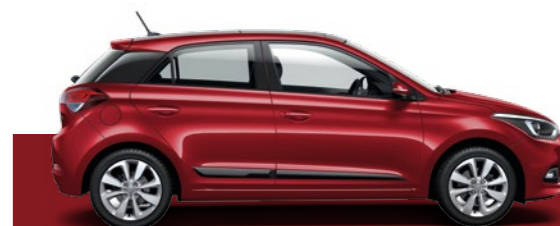
Red Passion – Pearl (Available on SE, Active and all Premium models)