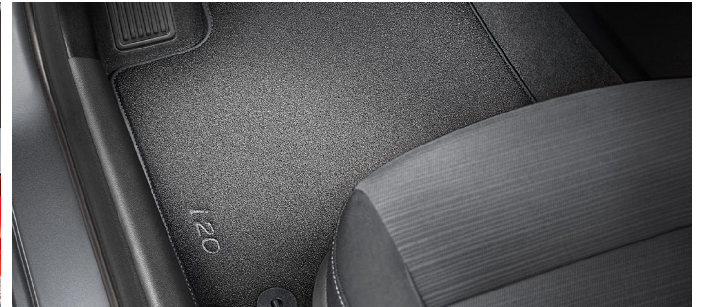
Carpet mat set