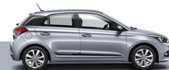
Sleek Silver – Metallic