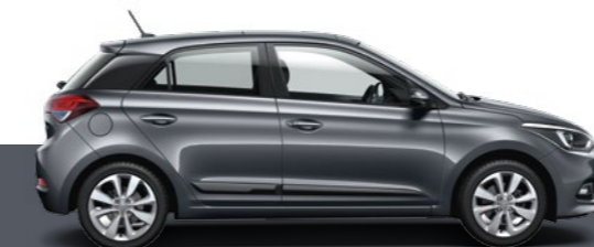
Stardust Grey – Metallic (Available on SE, Active and all Premium models)