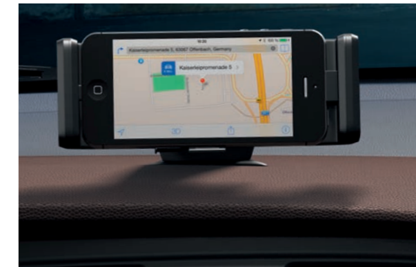
Dash-top docking station. Keeps your smartphone safe, secure and fully charged. iPhone is a trademark of Apple Inc. / Google Maps is a trademark of Google Inc.