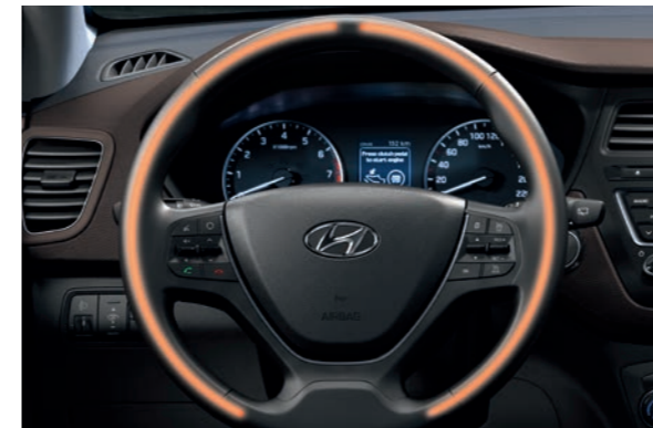
Heated steering wheel. A boon when starting your drive on a cold winter morning.