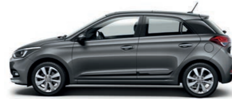
Baby Elephant Solid