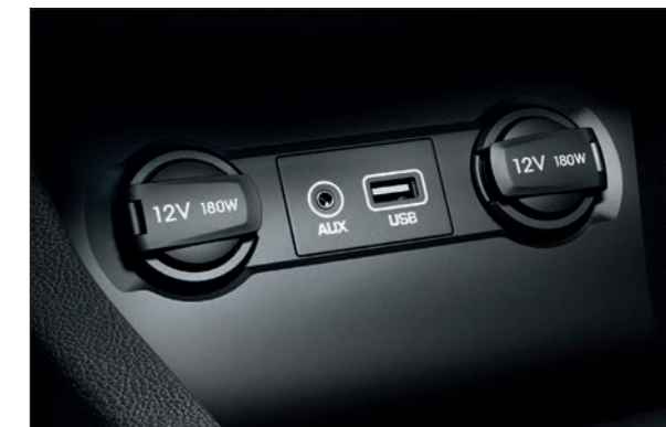
Aux and USB ports. Easy connectivity for your smartphone or MP3 device. Just plug-in and play.