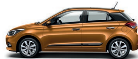
Mandarin Orange Pearl