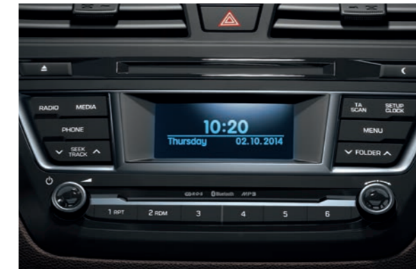
Audio system. RDS radio with CD/MP3 player and Bluetooth connectivity. The system can also be operated by controls on the steering wheel.