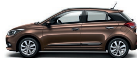
Iced Coffee Metallic