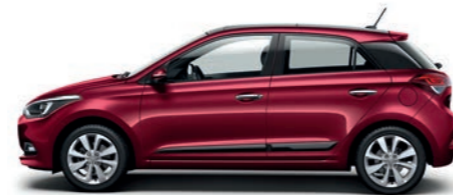
Red Passion Pearl