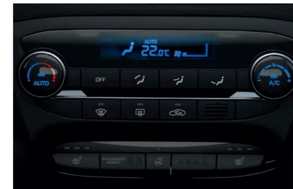
Automatic air-conditioning. Just select your preferred temperature and the system does the rest. There's even an auto-defog function to keep windows clear.