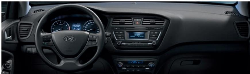
Comfort Grey Interior colour package