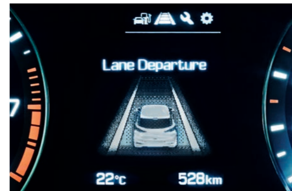
Lane departure warning system. Instant visual and audible warning of unintentional departure from the lane you're driving in.