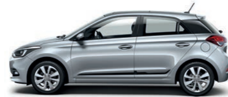
Sleek Silver Metallic