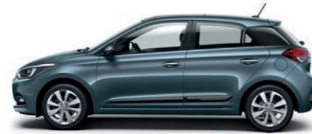
Aqua Sparkling Metallic