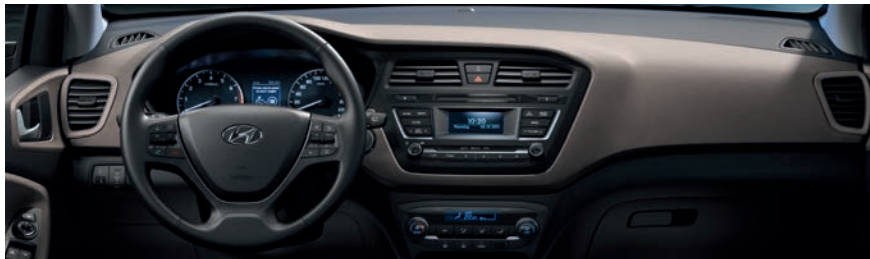
Elegant Beige Interior colour package