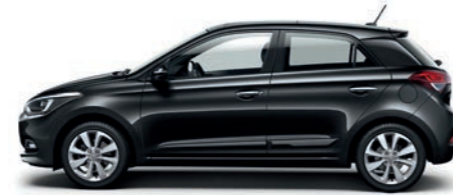
Phantom Black Pearl