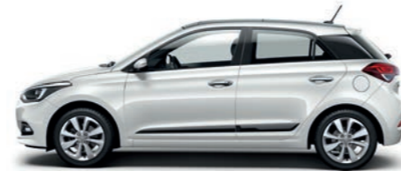
Polar White Solid