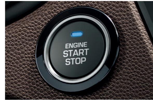
Engine start/stop button. Keyless starting when the smart key is on board in your pocket or bag.

The cabin is finished in carefully chosen materials creating a high-quality ambience that is unique in this class. And the available equipment includes features and functions that exceed expectations in this segment. One highlight is the dash-top smartphone docking station. Perfectly positioned for satellite navigation, playing radio or your favourite playlists via the audio system. It also keeps the smartphone charged.