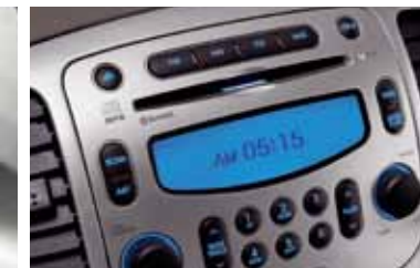
2 DIN Radio+CD+MP3 Audio