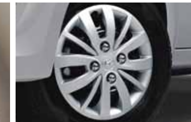
Full Wheel Cover

The Next Gen i10 is simply irresistible and speaks volumes about class and innovation from every angle. From the 2 DIN Audio, the Aux & USB ports to the tilt steering and full wheel cover, everything is designed to make the drive more convenient and comfortable.