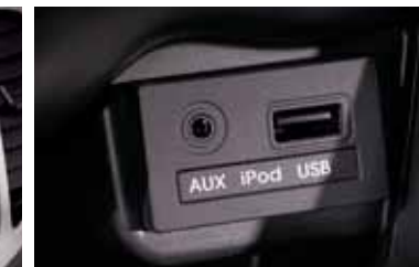
Aux and USB Ports