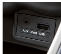
USB and aux connections