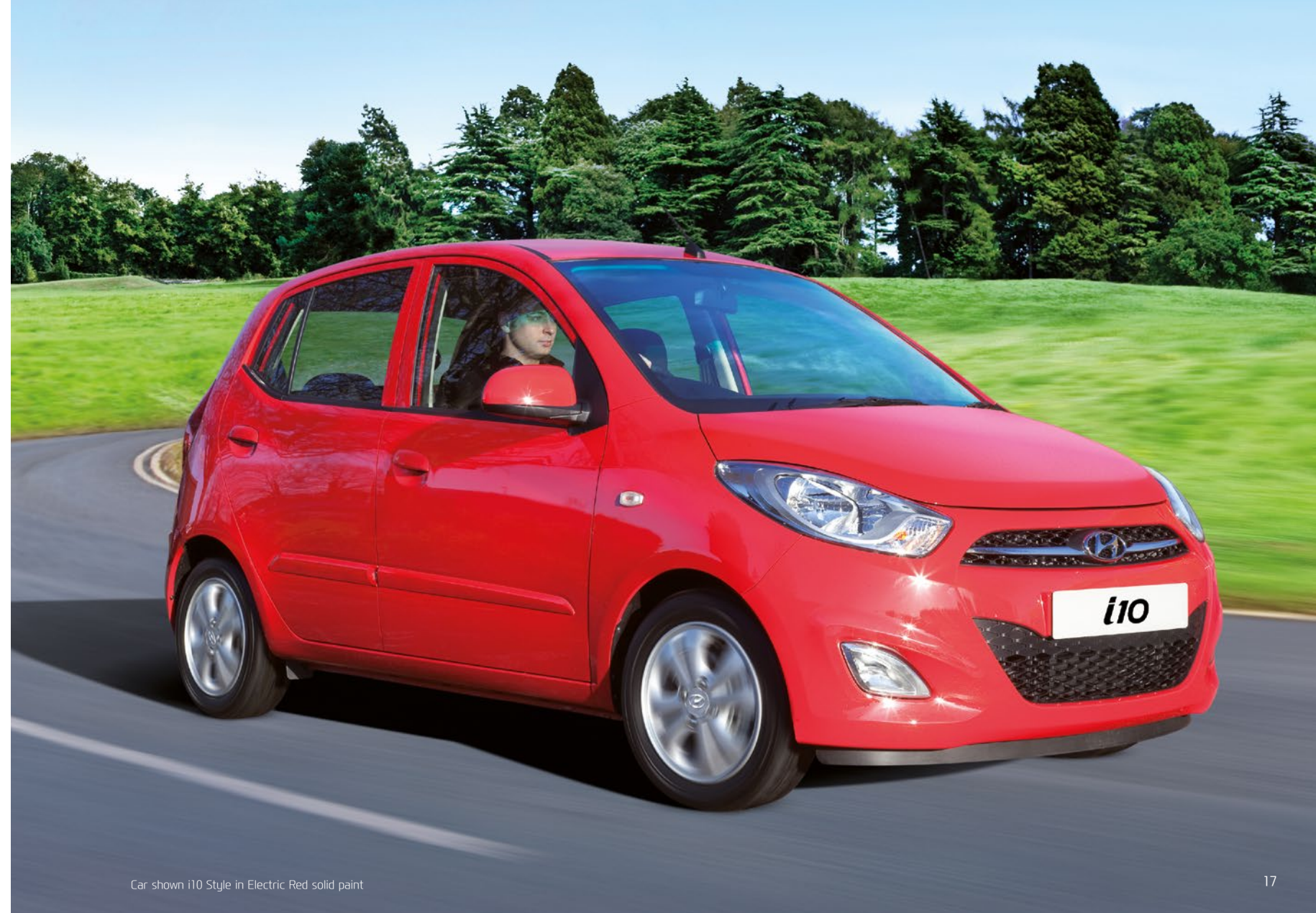
Car shown i10 Style in Electric Red solid paint

your child will be as safe as possible, with fixing points placed on the outer rear seats, and there's even a seatbelt reminder so you don't drive off until you're safe and secure. Front seat belt pre-tensioners are there to detect an impact and adjust the tightness accordingly, while central locking offers safety and convenience every time you leave your car. It means you can enjoy all the great things about the Hyundai i10, knowing that the car is always looking after you.