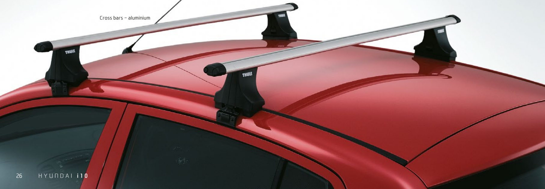
Cross bars - aluminium

We offer a range of accessories that'll really enhance your Hyundai i10. You might opt for a dog guard to keep your pets safe and sound, or perhaps you'll choose a mud flap set to keep your car as clean as possible. Just read through the options, speak to your local Hyundai Dealer, or visit www.hyundai.co.uk .