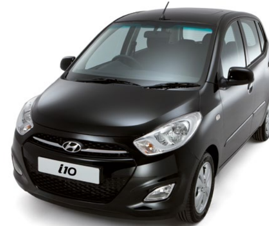
Phantom Black - Metallic