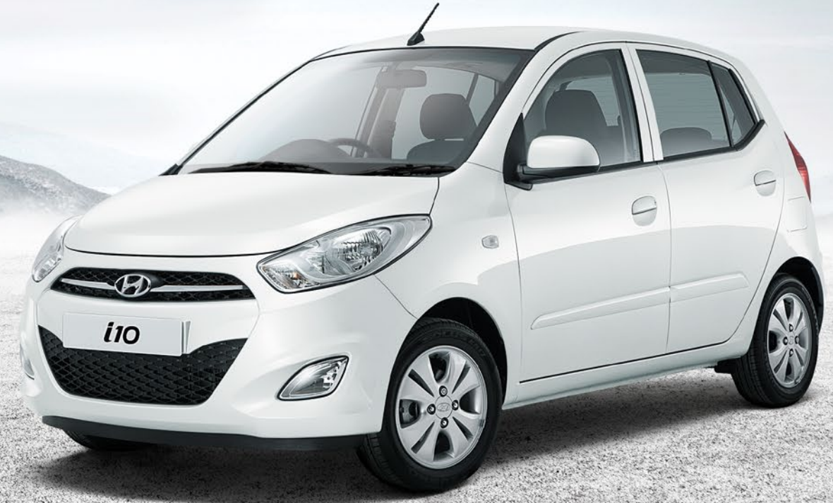
Cars shown i10 Style™ in Sleek Silver metallic paint and i10 Active in Pure White solid paint.