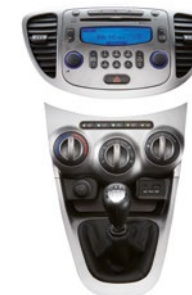
Alloy effect fascia trim