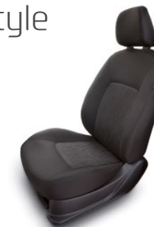
Full black cloth seats with black pattern detail