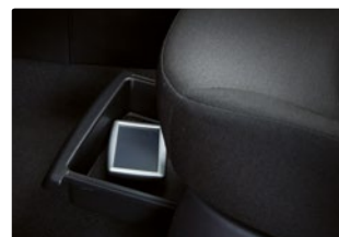
Front passenger under seat storage tray Active & Style