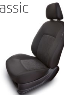
Full black cloth seats with black pattern detail