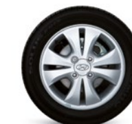
14" Alloy wheels