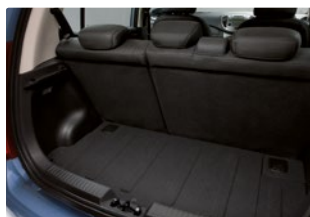
Regular seating position

can help you create more storage space too. When they're neatly folded you'll find wide open spaces for your weekly shopping - or even luggage for a break away. It means that wherever you go you can find a layout that'll suit your latest requirement. Put simply, the i10 handles it all.