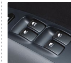
Electric rear windows