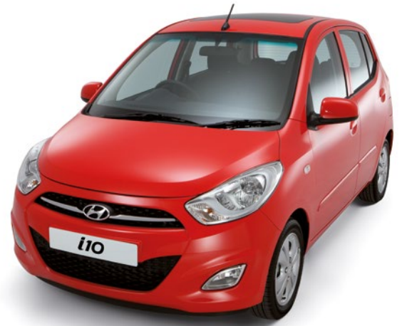
Electric Red - Solid