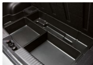
Under floor storage in boot - Active & Style