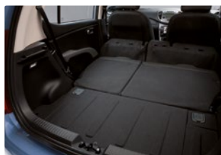
Rear seats folded