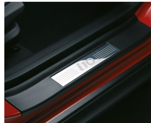
Sill guards set