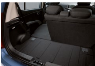
One seat folded