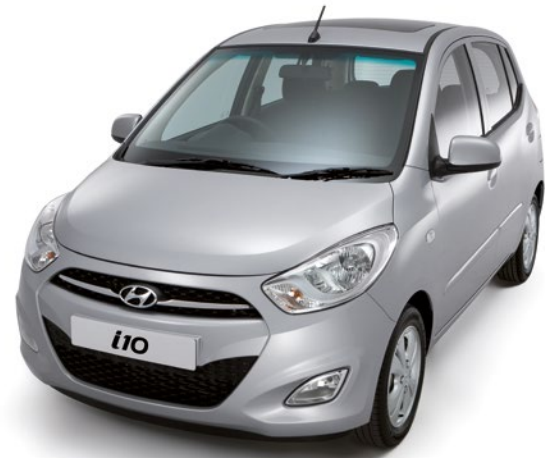
Sleek Silver - Metallic