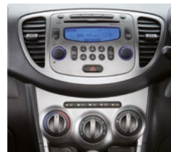
Alloy effect fascia trim