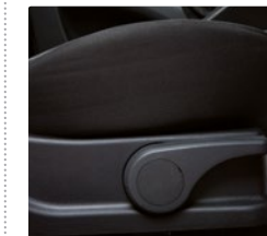
Driver's seat height adjustment