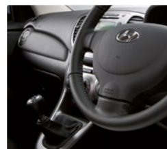
Leather steering wheel and gear knob