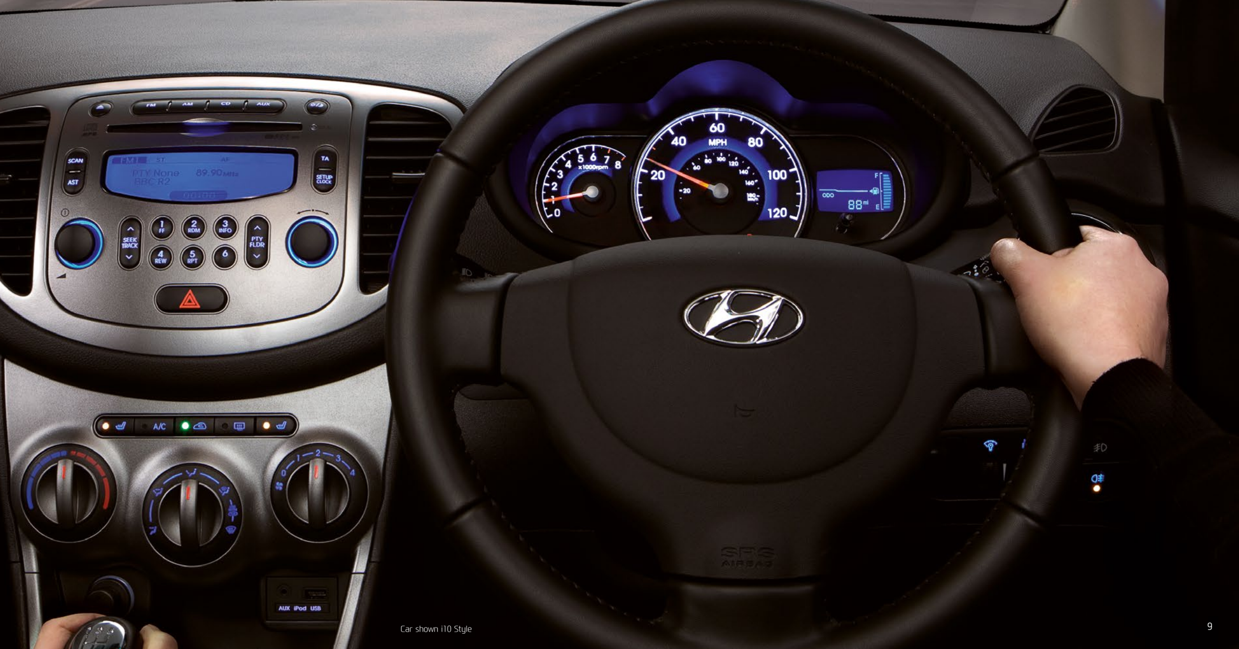
Car shown i10 Style

totally refined experience, enhanced on the Style model by the leather steering wheel, gear knob and handbrake, which complement the alloy effect fascia trim and chrome effect interior door handles. It's a place to feel good and make the journey ahead feel like a treat. The i10: a small and practical package with an exceptionally expansive style.