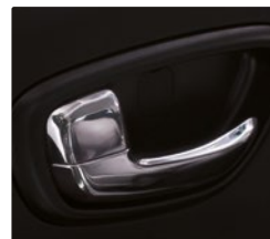
Chrome effect interior door handles