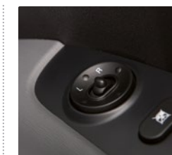
Electric door mirrors