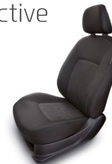
Full black cloth seats with black pattern detail