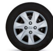
14" Steel wheels