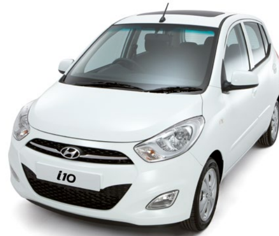
Pure White - Solid