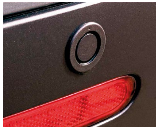
Rear parking sensors