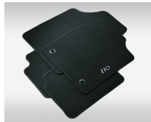
Carpet mat set