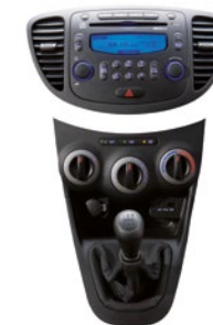
Black fascia trim