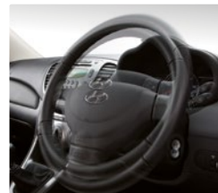
Height adjustable steering column