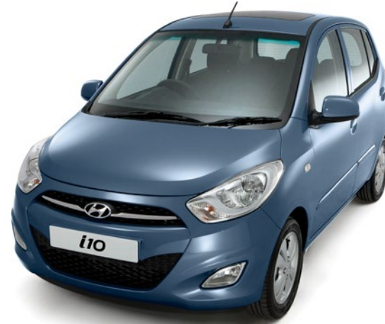
Twilight Blue - Metallic