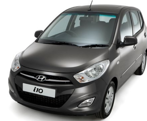
Star Dust - Metallic