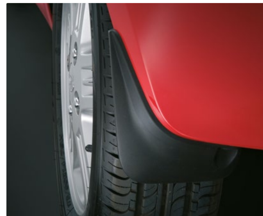
Mud flap set