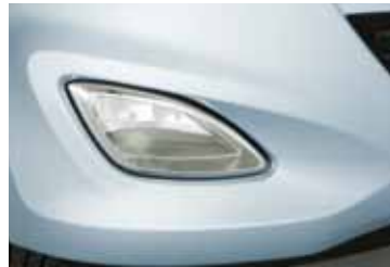
Front fog lights (Active & Style) An integral part of the fluidic design, giving you improved visibility in fog and bad weather.