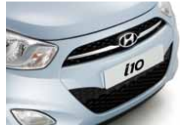
Front grille The redesigned hexagonal grille, that is now the signature feature of the Hyundai range, is very much part of the i10's contemporary look.