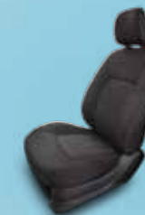
Full black cloth seats with black pattern detail