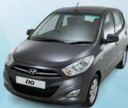
Carbon Grey (Metallic)