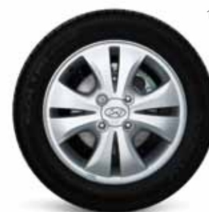
14" Alloy Wheels