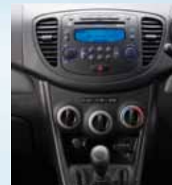
Black fascia trim