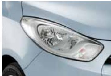
Headlights The wrap-around headlights continue the fluid body lines, through the front grille, accentuating the streetwise character of the i10.

Attention to detail is everything in the Hyundai i10. Like any great work, the closer you look the more impressive it becomes.