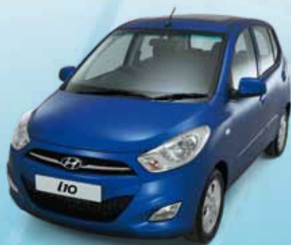
Sapphire Blue (Metallic)