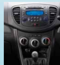
Black fascia trim