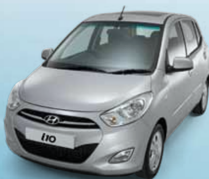
Sleek Silver (Metallic)