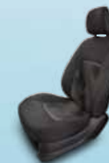
Black cloth seat facings with grey pattern detail