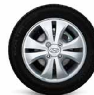
14" Alloy Wheels