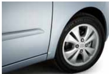
Alloy wheels (Active & Style) Contemporary design blends practicality with the lightweight alloy wheels.