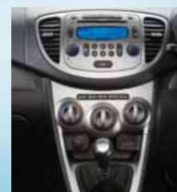
Alloy effect fascia trim