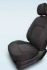
Full black cloth seats with black pattern detail