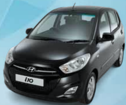
Phantom Black (Metallic)