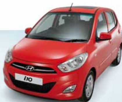
Electric Red (Solid)