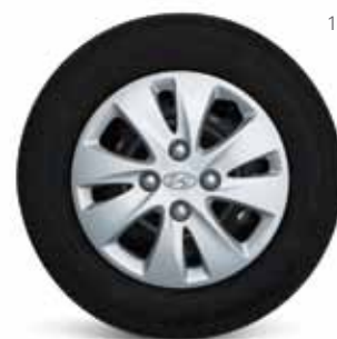
13" Steel Wheels