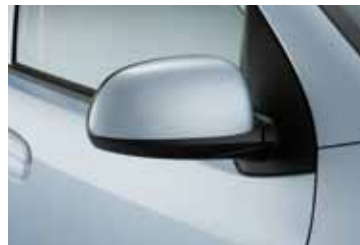
Body coloured mirrors (Active & Style) Carefully considered as part of the overall design. Engineered to reduce drag and improve fuel efficiency.