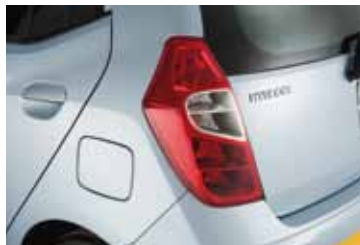
Tail lights Back to front no detail is overlooked. Seamlessly integrated into the i10's rear pillars the tail light cluster complements the rear design.