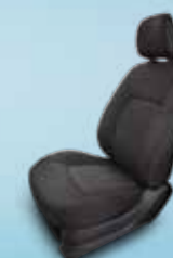
Full black cloth seats with black pattern detail