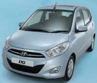
Ice Silver (Metallic)