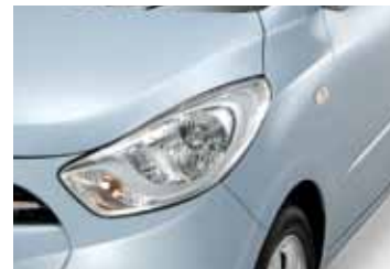
Fluidic sculptured body-lines The body lines flow from the rear light cluster, through the door handles, meeting at the front headlights and grille creating the unique i10 look that's like no other car in its class.