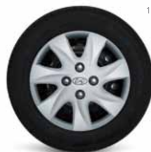
14" Steel Wheels