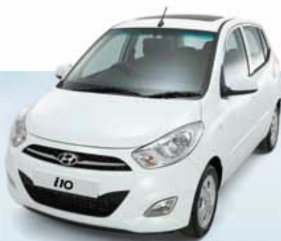
Crystal White (Solid)