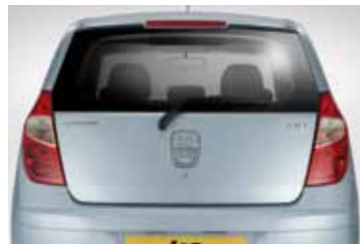
Rear design Designed with purpose in mind, the flush boot handle is discretely concealed by the Hyundai logo.