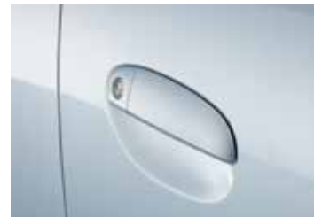
Body coloured door handles (Active & Style) Colour coordinated to complement and enhance the smooth lines of the car.