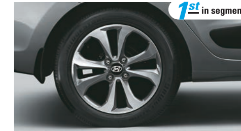
R15 DIAMOND CUT ALLOY WHEELS With 2-tone black and chrome finish for a sporty and dynamic appeal