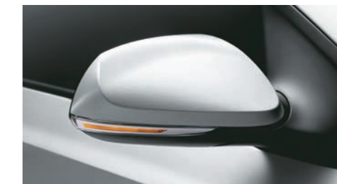
OUTSIDE MIRROR WITH TURN INDICATOR Aerodynamically designed to enhance looks and safety