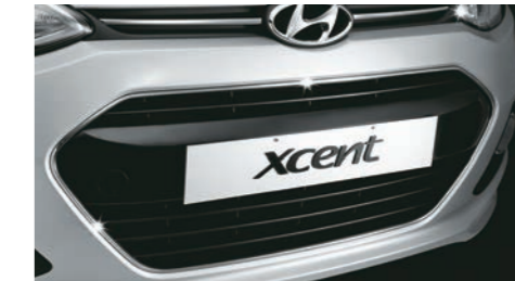
CHROME RADIATOR GRILLE & AIR DAM Projecting a strong road presence