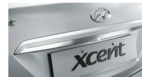
REAR CHROME GARNISH Highlights the rear profile of the car