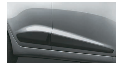
WAISTLINE MOULDING Imparts a sporty look and prevents scratches to the body