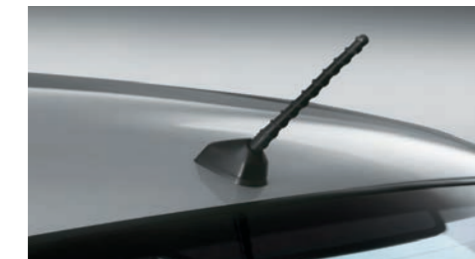
MICRO ROOF ANTENNA For efficient radio connectivity and aesthetic appeal