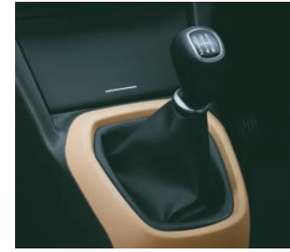
5-SPEED MANUAL TRANSMISSION Available in both petrol and diesel variants for smooth and accurate gear shift

The Hyundai Xcent offers an exciting blend of performance and efficiency with the 1.1 U2 diesel engine and the highly acclaimed 1.2 Kappa Dual VTVT petrol engine. Both the engines are mated with 5-speed manual gear boxes while the 1.2 Kappa petrol engine also offers the option of a 4-speed automatic transmission.