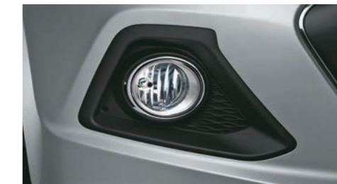
FOG LAMPS Designed for optimum amplification and to ensure safety during foggy weather conditions