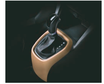
4-SPEED AUTOMATIC TRANSMISSION Available in petrol variant for driving in traffic with ease