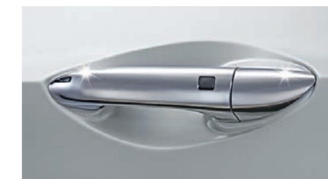
CHROME DOOR HANDLE Adds a premium look to the overall profile of the car