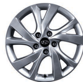
17" Alloy Wheel Base