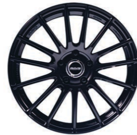
18" RAYS® Alloy Wheel Rally Edition