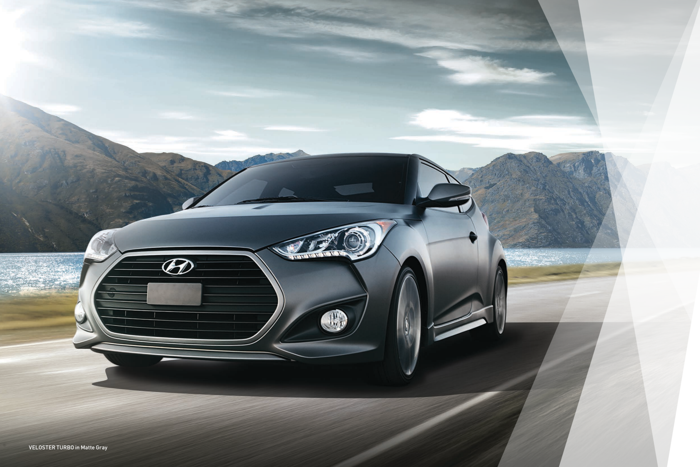
VELOSTER TURBO in Matte Gray