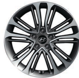
18" Alloy Wheel Turbo