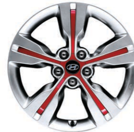
18" Alloy Wheel Non-Turbo Style and Tech Package