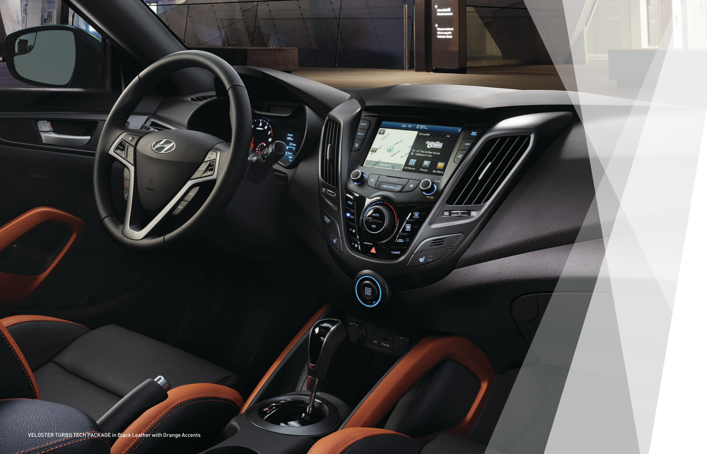
VELOSTER TURBO TECH PACKAGE in Black Leather with Orange Accents