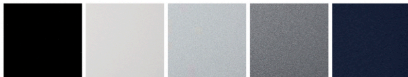
Phantom black TB7 Ice white WW7 Platinum silver Y7S Polished metal V7S Night sky NU7