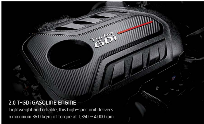
2.0 T-GDI GASOLINE ENGINE Lightweight and reliable, this high-spec unit delivers a maximum 36.0 kg·m of torque at 1,350 ~ 4,000 rpm.

MAX. POWER MAX. TORQUE 245 PS / 36.0 kg·m