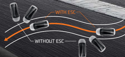
ELECTRONIC STABILITY CONTROL (ESC) Sensing steering wheel movements in relation to wheel rotation, Electronic stability control (ESC) takes care of the engine, braking system and steering during sudden braking and turning to keep you from skidding.