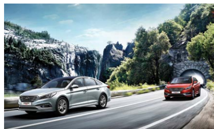
BLIND SPOT DETECTION (BSD) BSD senses vehicles in the blind spot not caught by your rear-view and outside mirrors. It also alerts you if a vehicle approaches quickly from behind.

Sonata Turbo's engine provides dynamic driving performance, with its 2.0 T-GDi gasoline engine taking you from 0 to 100 kph in 7.5 seconds. Meanwhile, sport-tuned suspension, optimized braking and a comprehensive airbag system ensure both driving enjoyment and safety.