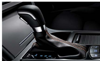
6-SPEED AUTOMATIC TRANSMISSION The 6-speed automatic transmission provides high-precision response, silky-smooth shifts, and outstanding durability.