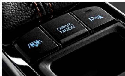
DRIVE MODE CONTROL SYSTEM Drive mode control system lets you choose from three different driving modes-normal, sports, and eco-depending on the steering feel you desire and to suit different driving conditions.