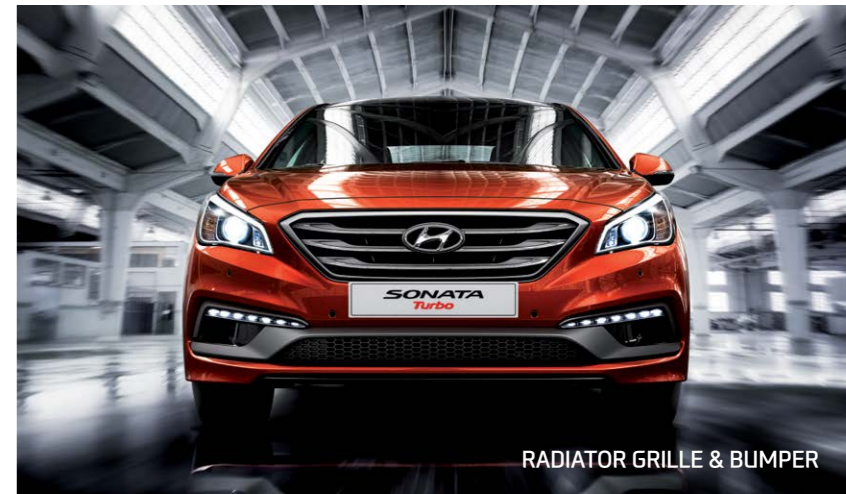
RADIATOR GRILLE & BUMPER

Sonata Turbo adds powerful muscularity to fluid and dynamic lines of Sonata. Sculpted side sill moldings and 18" alloy wheels convey an aggressive purposeful, fully complementing the feeling of movement and speed.