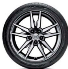
18" alloy wheels with 235 / 45 R18 tires.