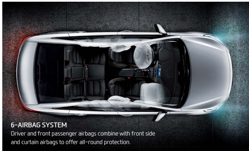
6-AIRBAG SYSTEM Driver and front passenger airbags combine with front side and curtain airbags to offer all-round protection.