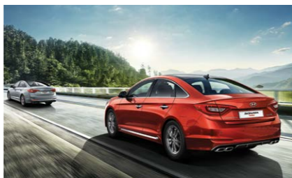
AUTO CRUISE CONTROL Auto cruise control lets you set and maintain your desired speed. It's perfect for long road trips, because it prevents you from accidentally passing the speed limit. At the same time, you can let your feet relax while saving fuel too.