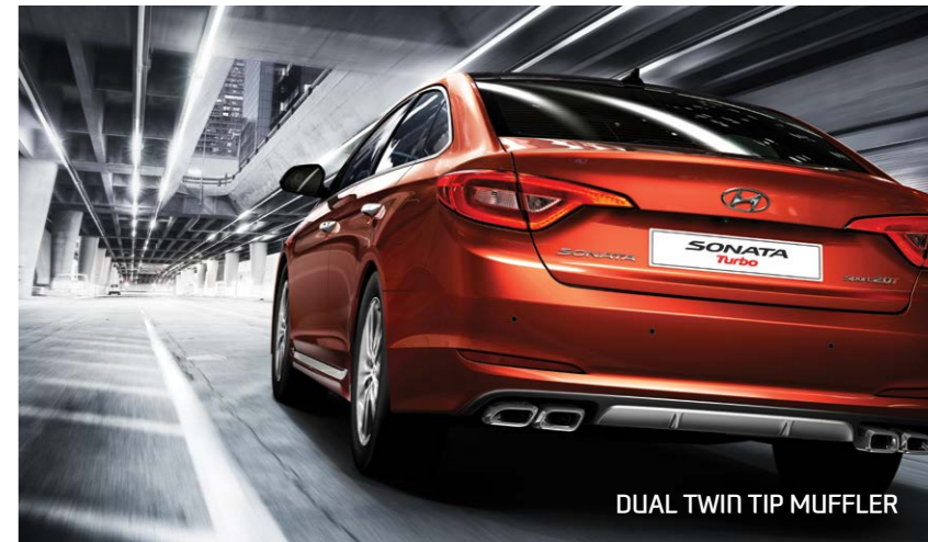
DUAL TWIN TIP MUFFLER

The enlarged front bumper combines well with the bold and stylish black color of the radiator grille. The same color is applied to the air intake and fog lamp housings while dual twin tip mufflers enhance sportiness at the rear.