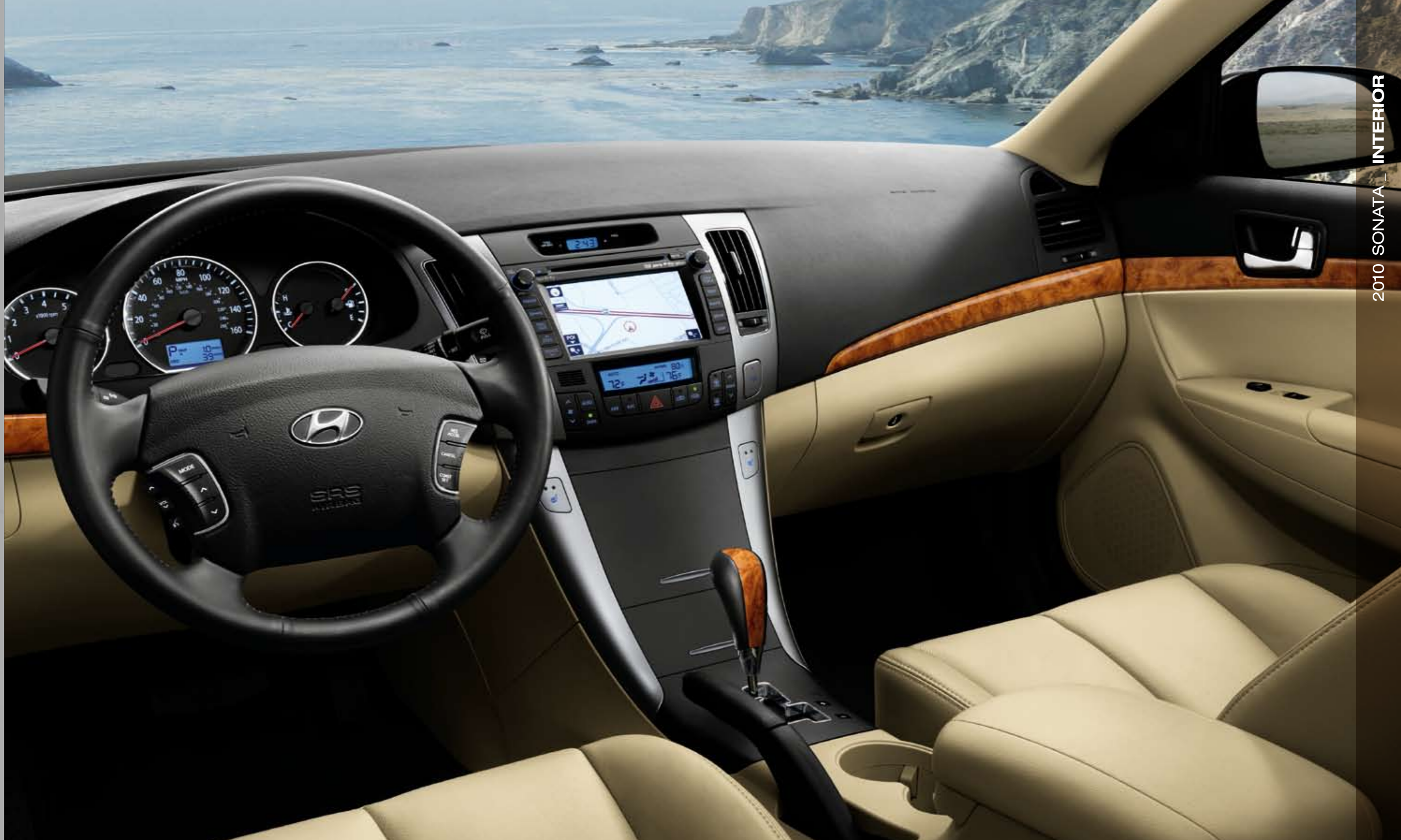
2010 SONATA INTERIOR