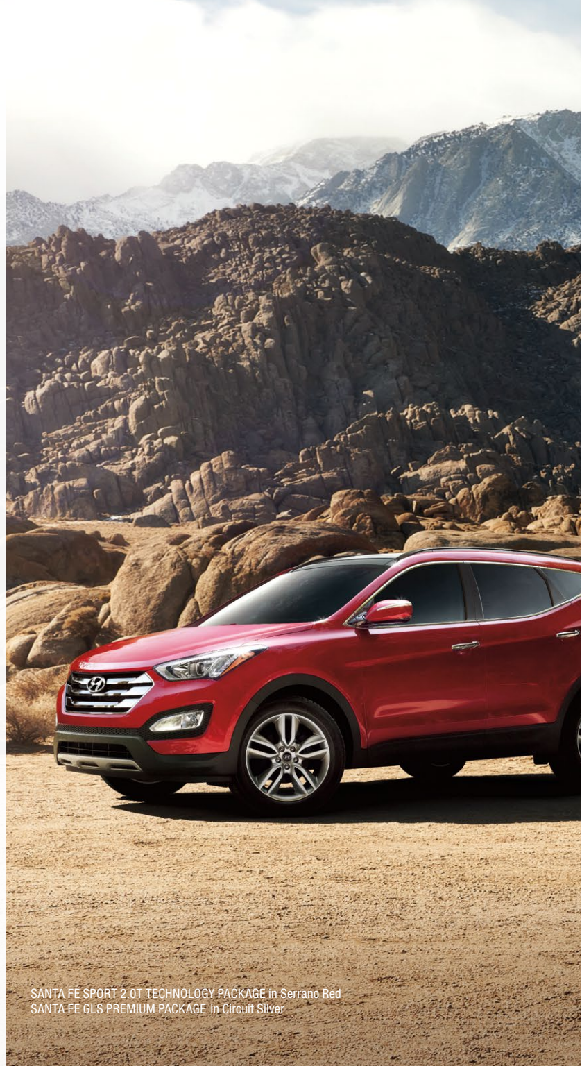
SANTA FE SPORT 2.0T TECHNOLOGY PACKAGE in Serrano Red SANTA FE GLS PREMIUM PACKAGE in Circuit Silver

Recipient of the prestigious 2012 GOOD DESIGN™ Award from The Chicago Athenaeum: Museum of Architecture and Design. 4