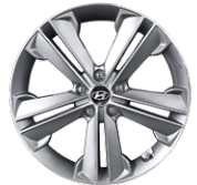
19" ALUMINUM ALLOY WHEEL