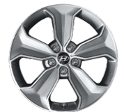
18" ALUMINUM ALLOY WHEEL