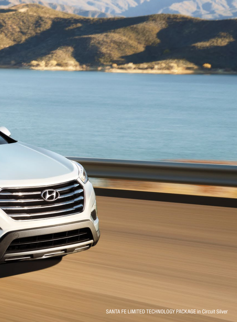
SANTA FE LIMITED TECHNOLOGY PACKAGE in Circuit Silver