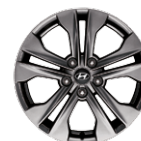
17" ALUMINUM ALLOY WHEEL