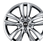
19" ALUMINUM ALLOY WHEEL