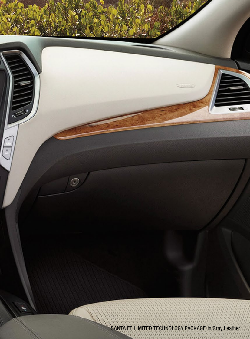
SANTA FE LIMITED TECHNOLOGY PACKAGE in Gray Leather