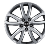
18" ALUMINUM ALLOY WHEEL