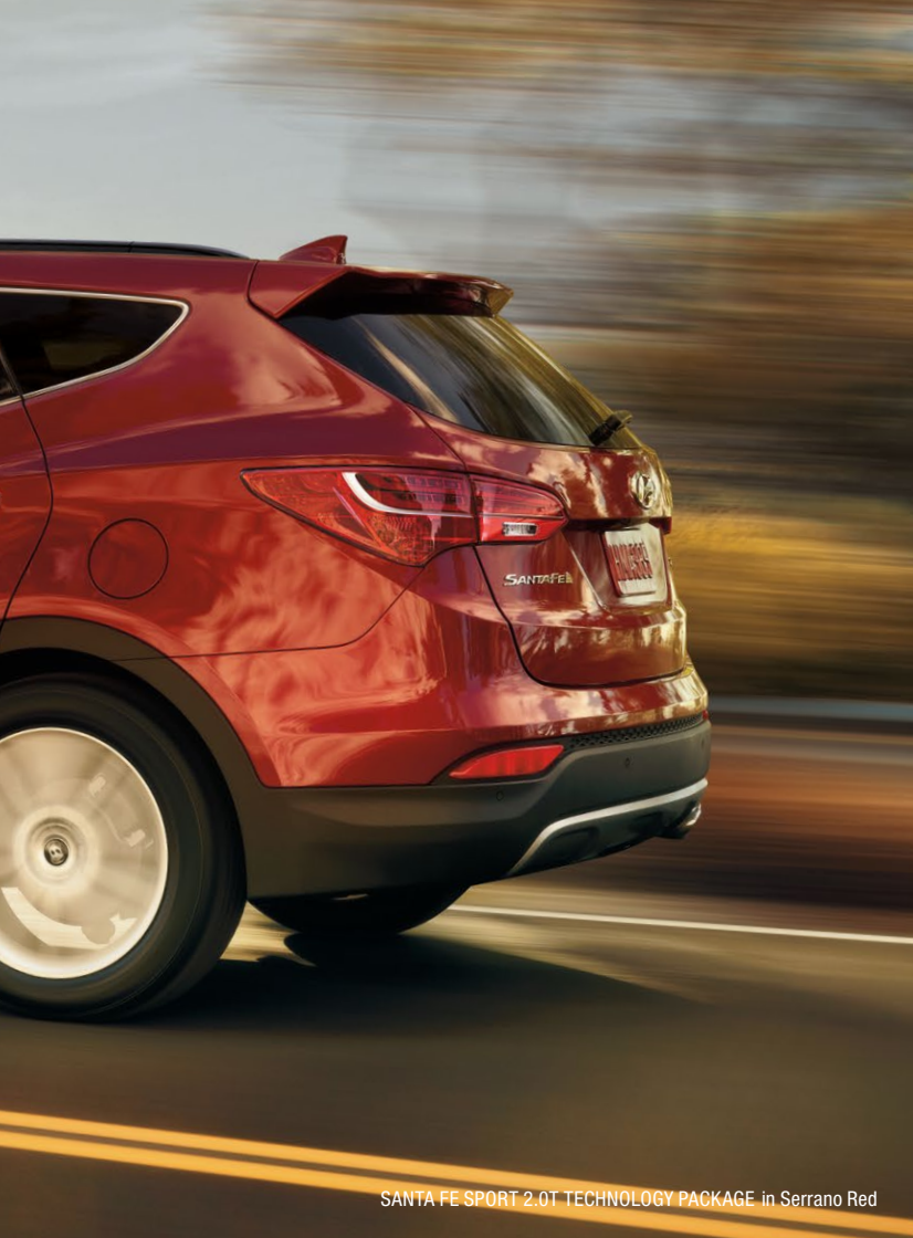
SANTA FE SPORT 2.0T TECHNOLOGY PACKAGE in Serrano Red