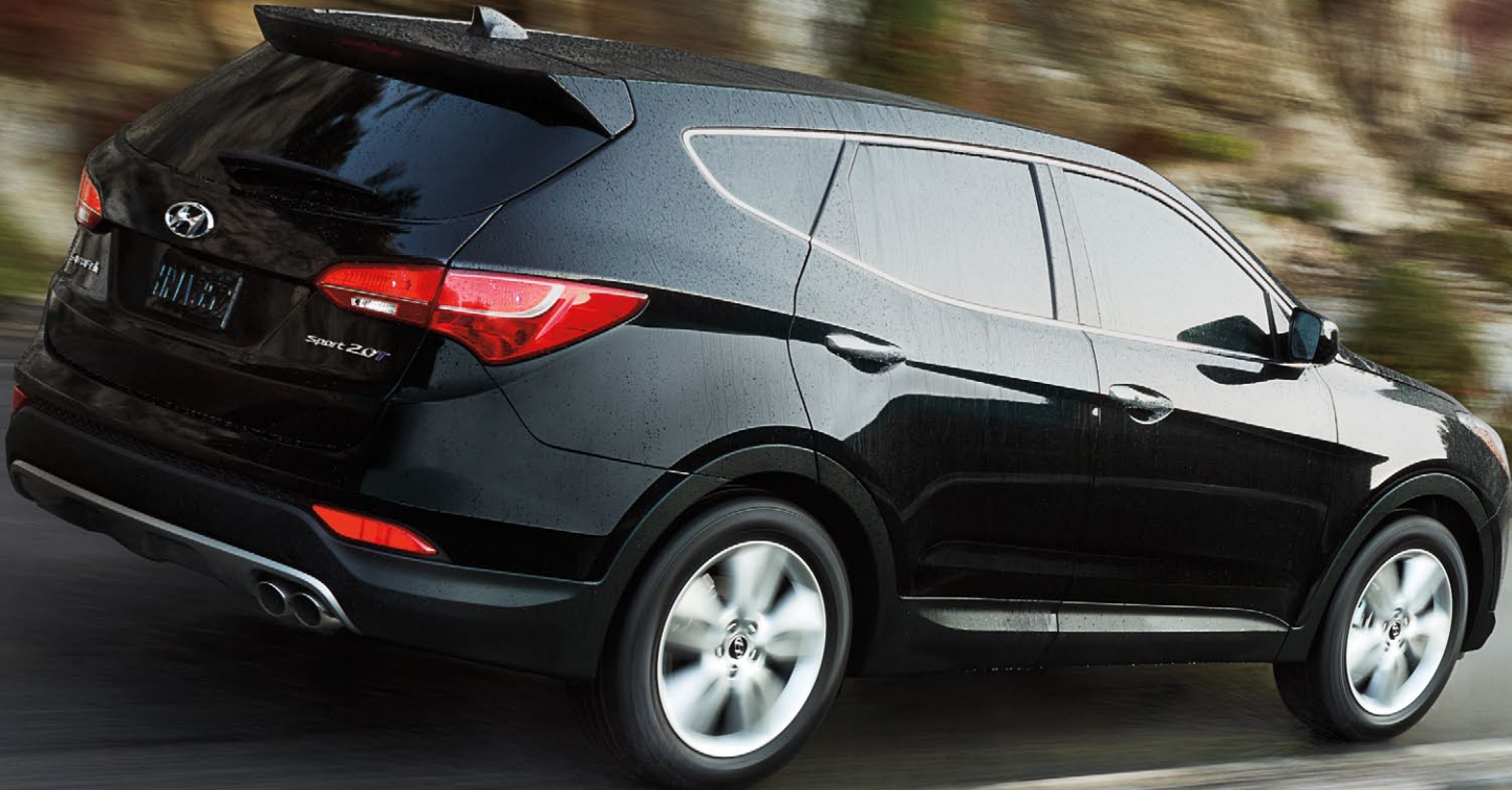
SANTA FE SPORT 2.0T in Twilight Black

THE ALTERNATE ROUTE IS THERE FOR THE TAKING.