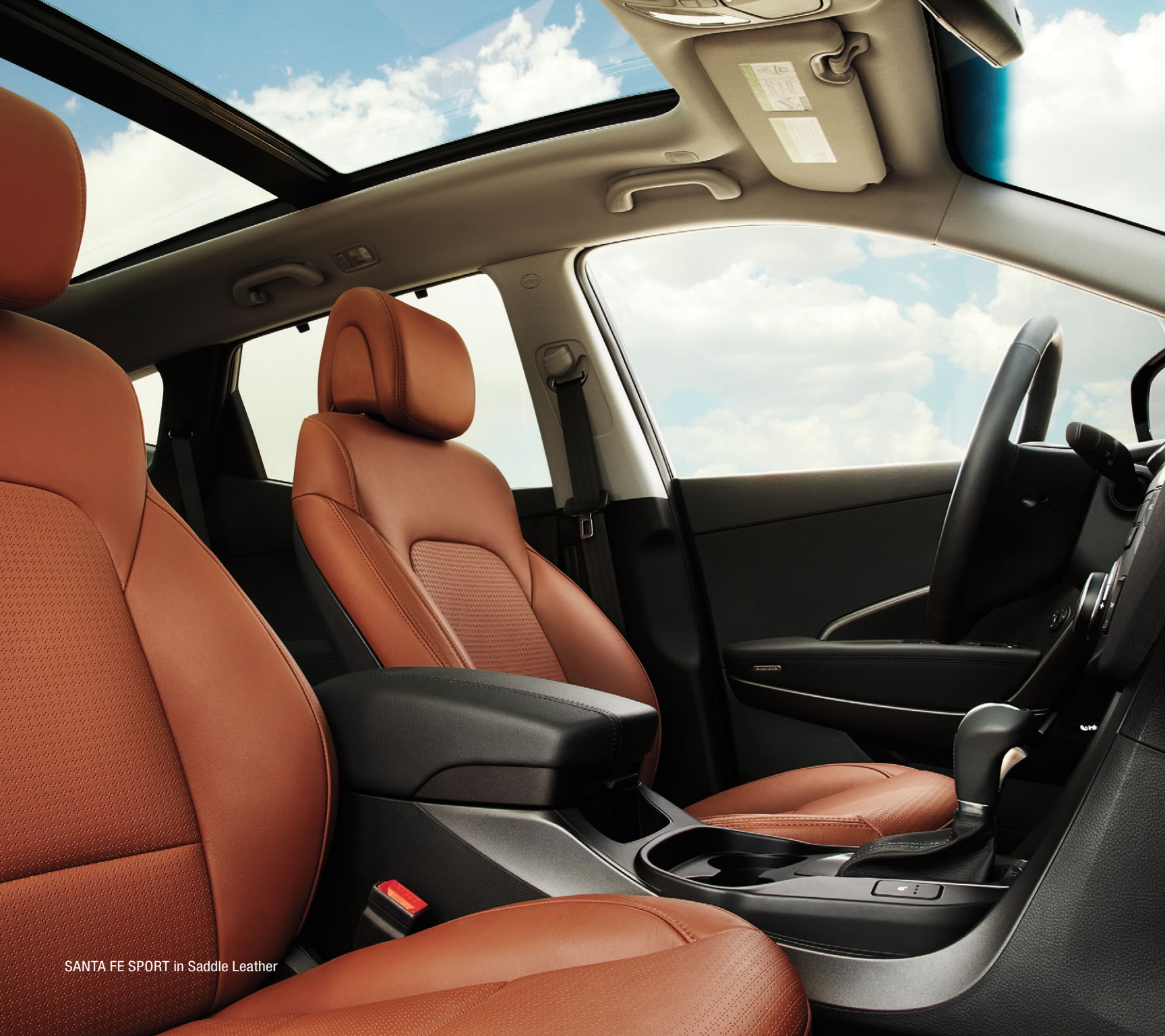
SANTA FE SPORT in Saddle Leather