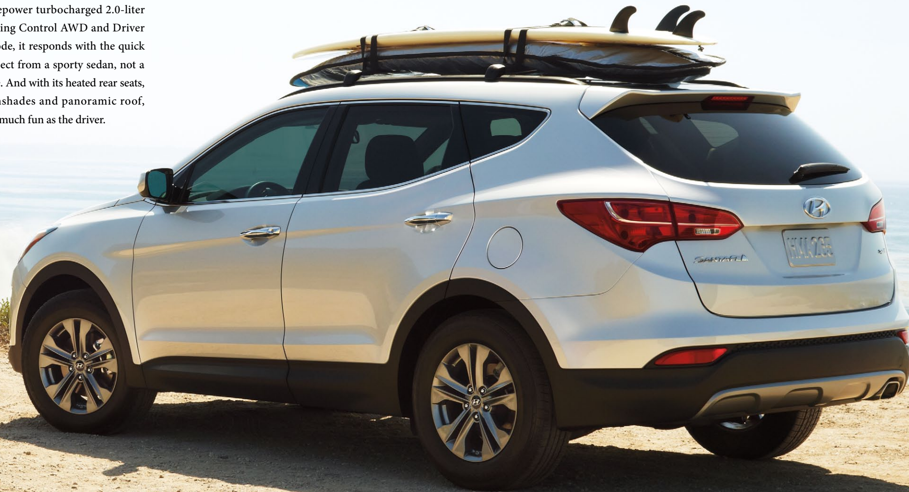
SANTA FE SPORT in Moonstone Silver

One drive will make it clear that we've named it Santa Fe Sport for a reason. Thanks to technologies like an available 264-horsepower turbocharged 2.0-liter engine, Active Cornering Control AWD and Driver Selectable Steering Mode, it responds with the quick reflexes you might expect from a sporty sedan, not a crossover utility vehicle. And with its heated rear seats, rear side window sunshades and panoramic roof, passengers can have as much fun as the driver.