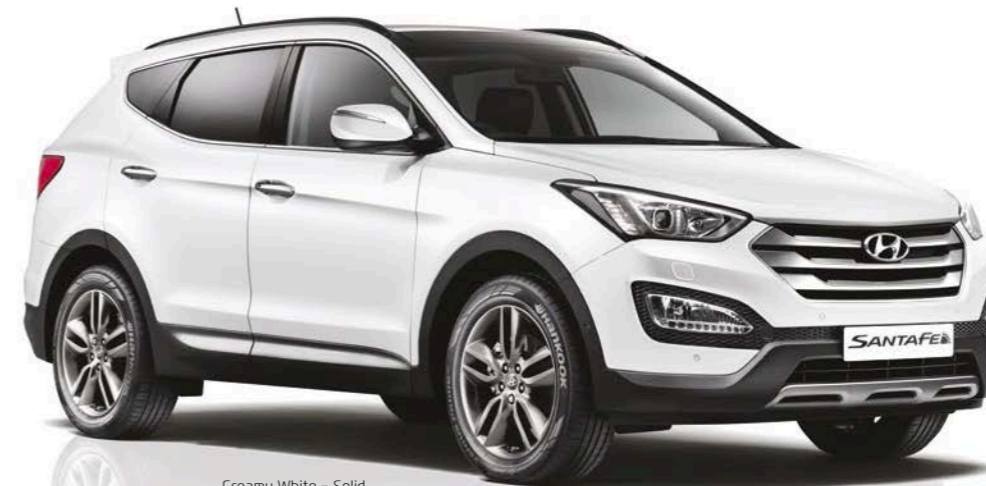
Creamy White - Solid