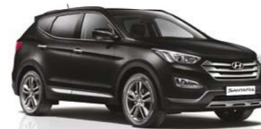
Phantom Black - Metallic