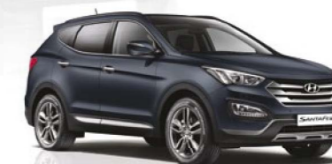
Ocean View - Metallic