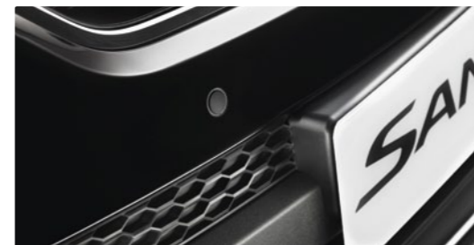
Front parking sensors