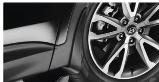
Mud flap set