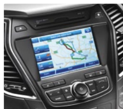
Touchscreen Satellite Navigation