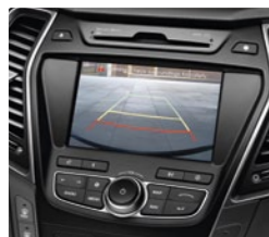
Rear view parking camera