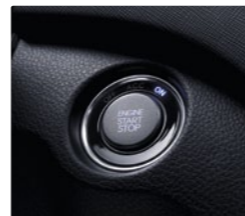
Engine start/stop button