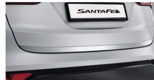
Tailgate trim - chrome