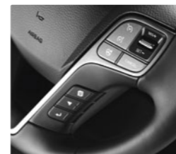
Flex Steer, cruise control with speed limiter