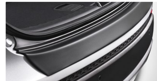
Rear bumper protector - moulded