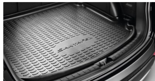
Boot liner - 5 and 7 seat models