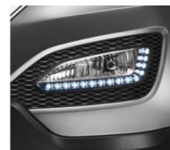
LED Daytime running lights