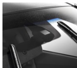
Rain sensing windshield wipers