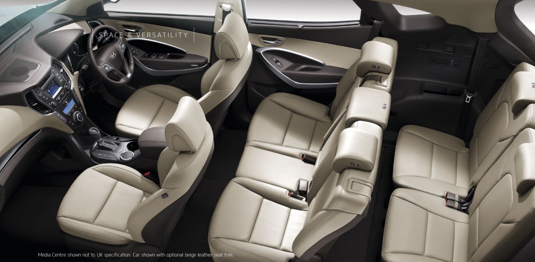
Media Centre shown not to UK specification. Car shown with optional beige leather seat trim.