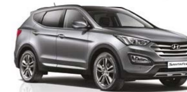
Titanium Silver - Metallic