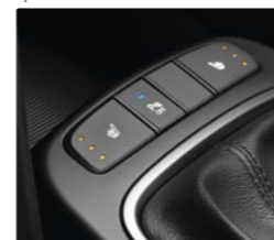
3 stage heated front seats