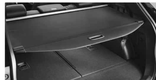
Luggage cover - 7 seat models only