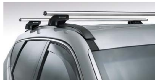
Cross bars - aluminium

Car shown Santa Fe Premium in Phantom Black metallic paint. Accessories are based on the latest information available at the time of print. Please consult your Dealer for full details.