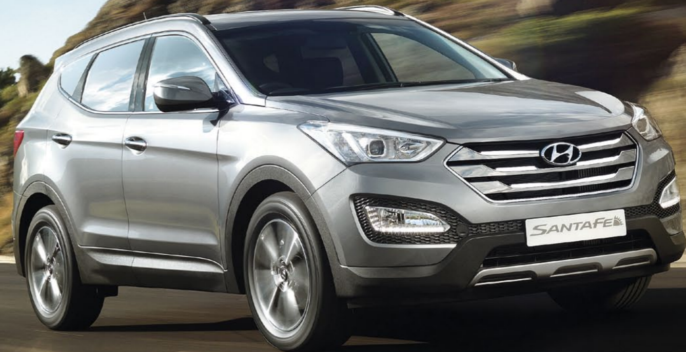
Car shown Santa Fe Premium in Titanium Silver metallic paint

Confident, imposing and extremely well-appointed. The New Generation Santa Fe delivers an adventurous driving experience. First class comfort is combined with a powerful engine and cutting-edge technologies to ensure it excels on every surface. Take the exciting route home and enjoy premium luxury all the way.