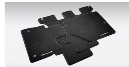
Carpet mat set - 5 and 7 seat models