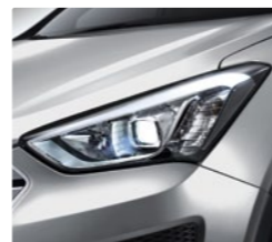
Xenon headlights with static levelling device