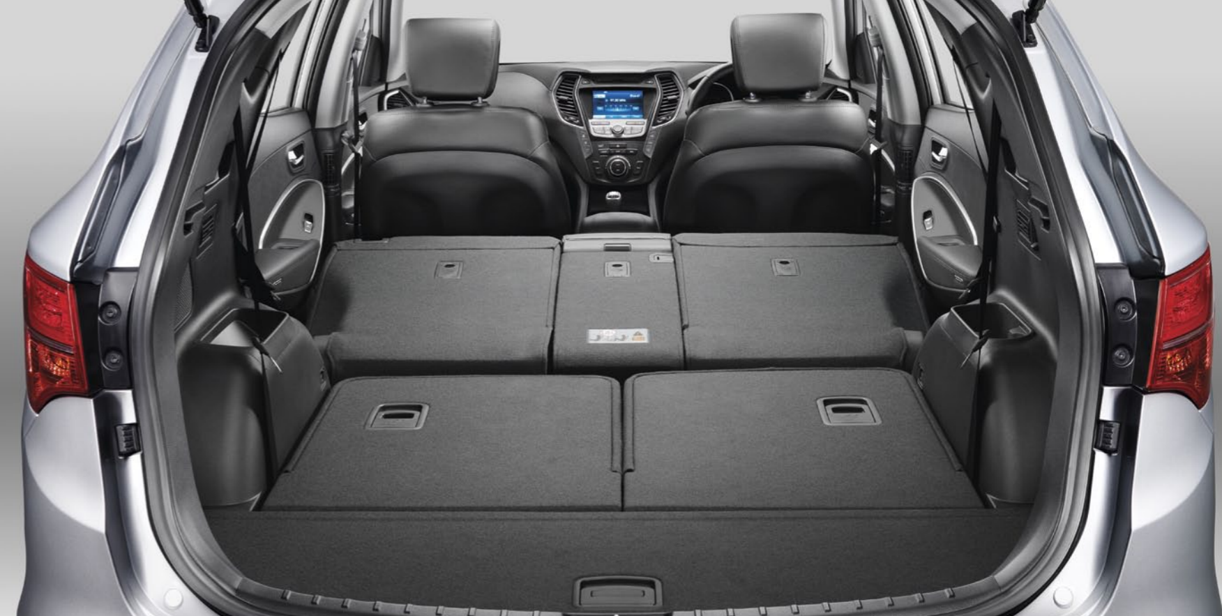
Car shown Santa Fe Premium SE 7 Seat in Sleek Silver metallic paint with black leather seat trim