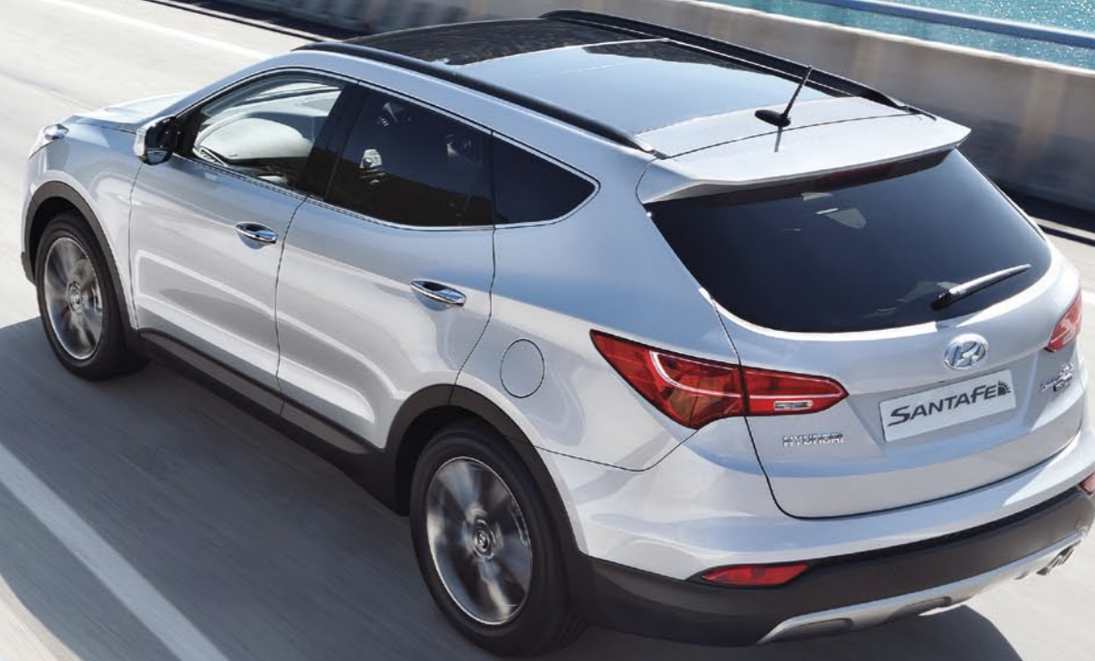
Car shown Santa Fe Premium SE in Sleek Silver metallic paint

compromise efficiency at all. That's due to clever engineering like the Torque on Demand 4WD system. This ensures that, unlike some 4WD systems, it only applies the drive to all four wheels when needed, helping it deliver 46.3 MPG with CO 2 emissions starting at 159g/km. The 2WD model is even more economical since we've designed it with optimum efficiency in mind - up to 47.9 MPG with emissions of 155g/km. In short, the Santa Fe is no ordinary SUV. Travel further between fuel stops enjoying total sophistication all the way. The perfect combination of performance and efficiency.