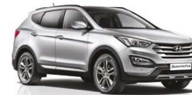
Sleek Silver - Metallic