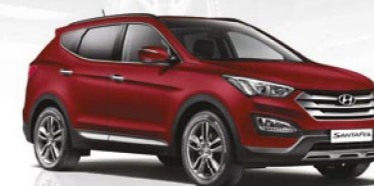
Red Merlot - Pearl