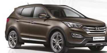
Arabian Mocha - Pearl