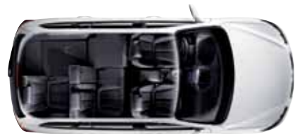
60/40 split rear seats and 50/50 split third row seats allow alternate 5 seat configuration