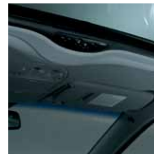
Sunroof. Tilt and slide