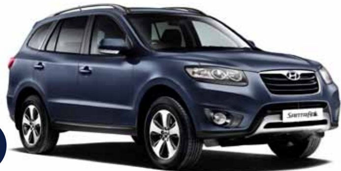
Blue Velvet – Mica