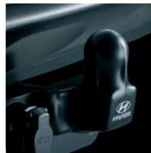
Towbar – choice of fixed or detachable