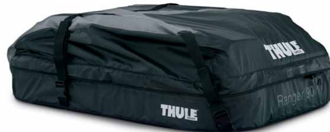
Foldable roof box. 340 litres – 50kg load capacity – 110cm x 80cm 40cm

Accessories shown are based on the latest information available at the time of print. Please consult your dealer for full details.