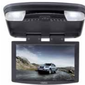
Overhead DVD system