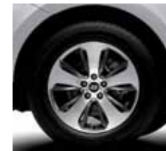
18-inch alloy wheels