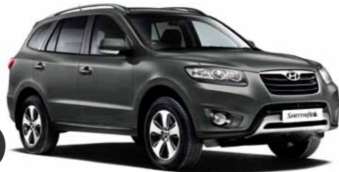
Stone Grey – Metallic