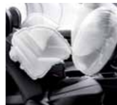
Standard front, front side and full length curtain airbags with rollover sensor