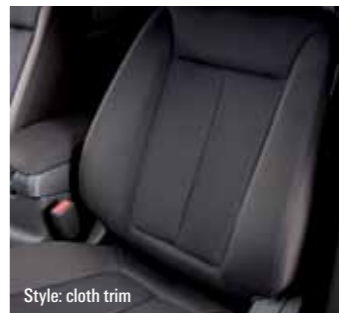
Style: cloth trim