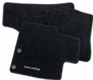
Carpet mat set