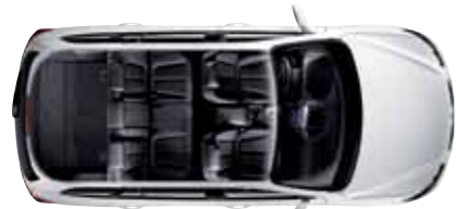
5 seat and load space configuration