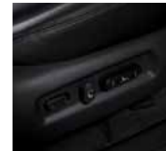
Electric driver's seat adjustment