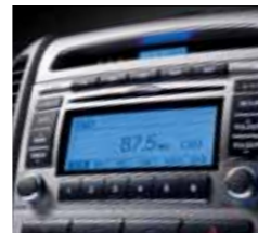
MP3/WMA stereo radio/CD player

* Please contact your dealer for the latest list of compatible mobile phones