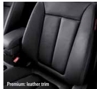
Premium: leather trim

Customise your Hyundai by selecting one of the stylish colours shown. From Vanilla White to Phantom Black, you can make sure it looks exactly the way you want.