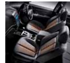
Heated front seats