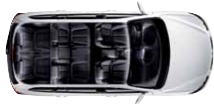
Full 7 seat configuration