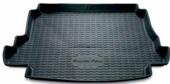
Boot tray. Available for 5 and 7 seater. Heavy duty boot tray also available for 5 seater. (does not fit in conjunction with dog guard)

We've developed a variety of accessories to make sure your car perfectly fits your lifestyle. From mounted bike carriers to a foldable roof box, there are a range of extras to catch your eye.