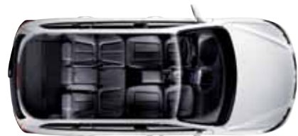
Fully reclined front seats