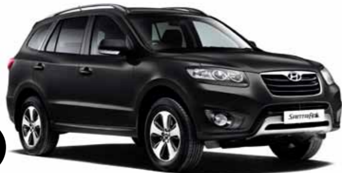
Phantom Black – Mica