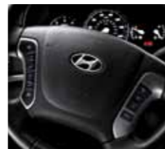
Steering wheel audio controls