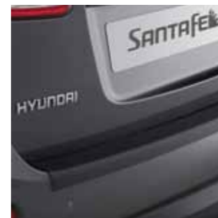
Rear bumper protector