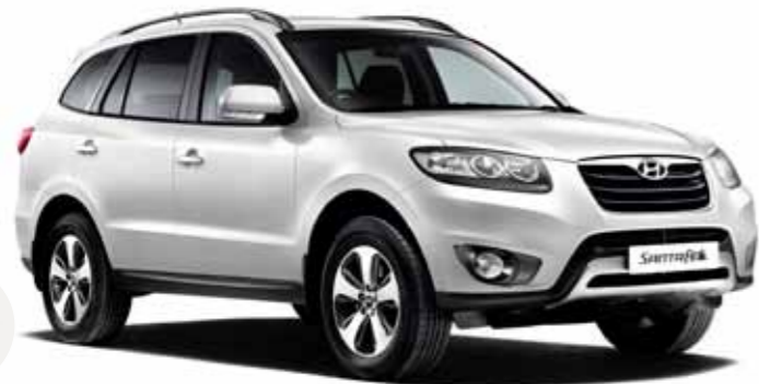
Vanilla White – Solid