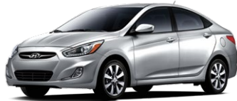
2014 model shown