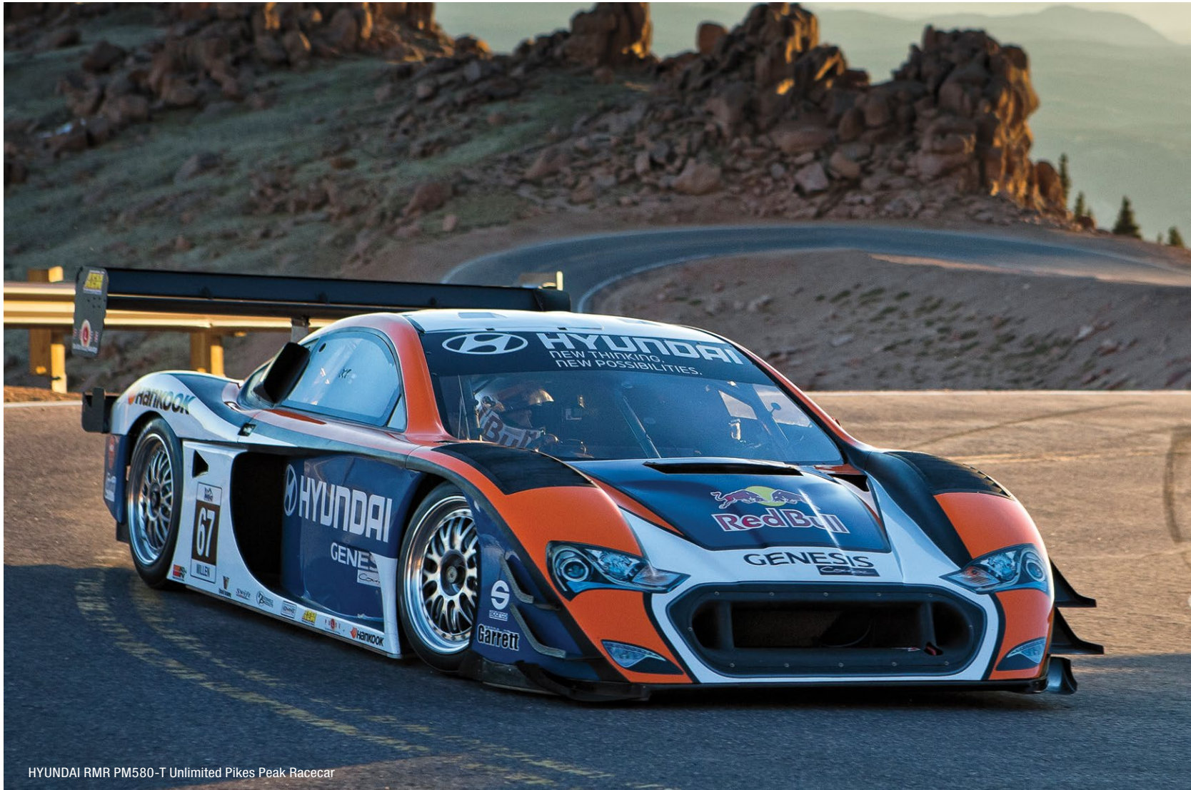
HYUNDAI RMR PM580-T Unlimited Pikes Peak Racecar