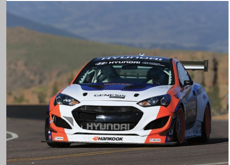
Paul Dallenbach wins the 2013 Time Attack class at Pikes Peak in a competition-modified Hyundai Genesis Coupe