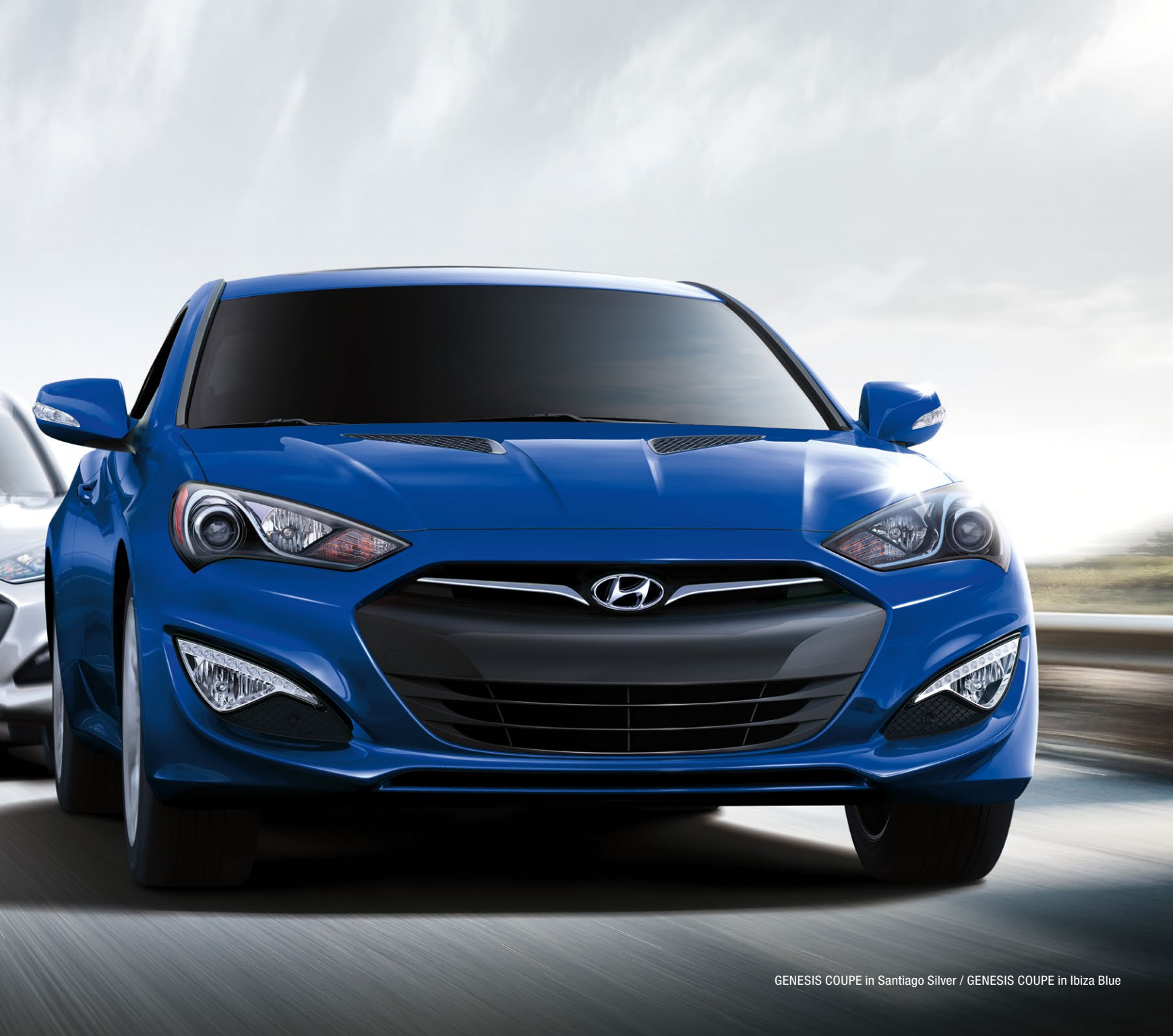
GENESIS COUPE in Santiago Silver / GENESIS COUPE in Ibiza Blue