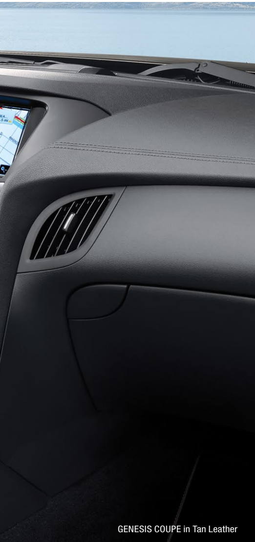
GENESIS COUPE in Tan Leather