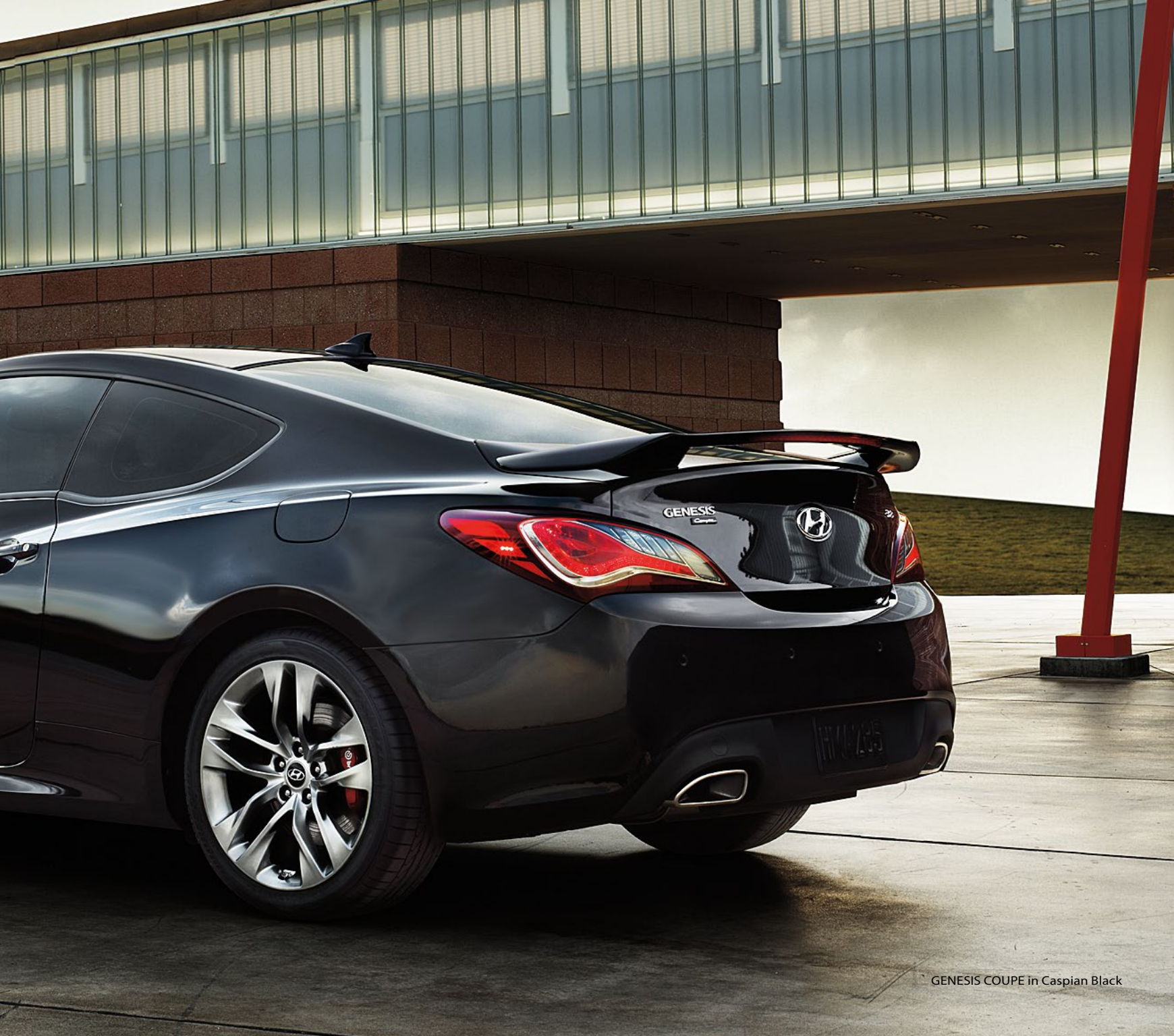
GENESIS COUPE in Caspian Black