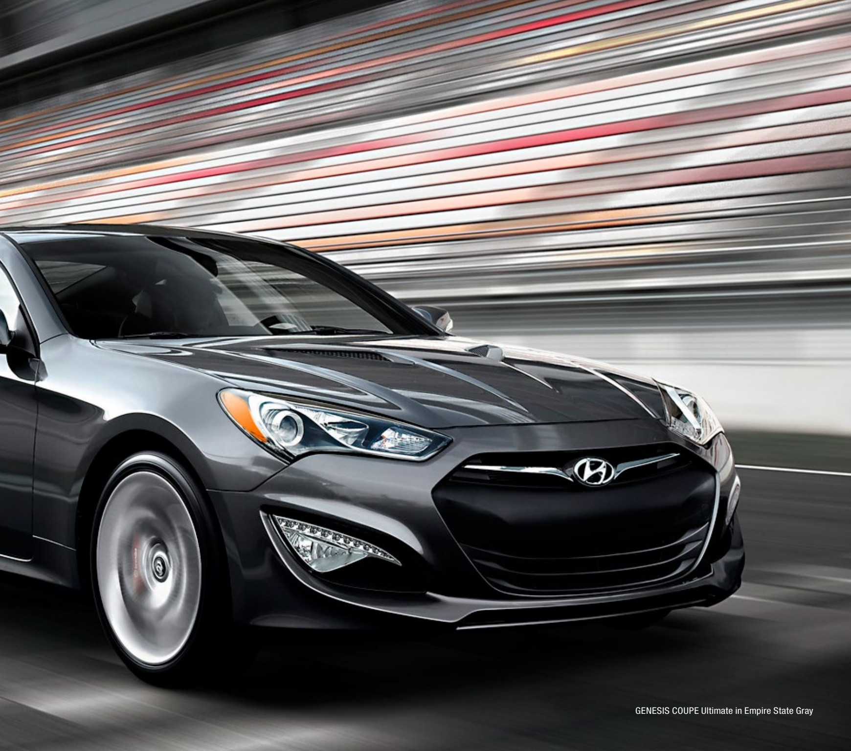
GENESIS COUPE Ultimate in Empire State Gray