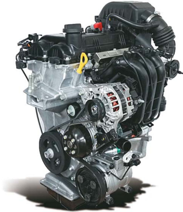
Dual VTVT 1.0L Kappa Engine

Hyundai has always been committed to making safe cars that are fuel efficient and easy to maintain. The EON is no exception. Powered by a mileage-friendly engine and features that help promote eco-friendly driving, this car is easy both on your pocket and the environment.