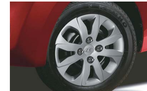
Full Wheel Cover