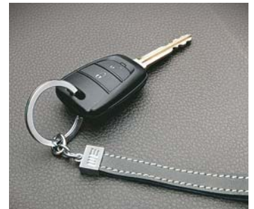
Keyless Entry & Central Locking