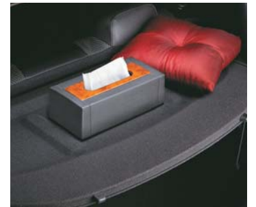
Rear Parcel Tray