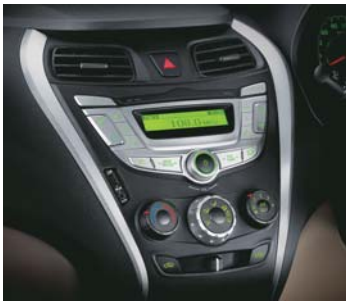
AC & 2 DIN Audio with AUX-in & USB Ports

When it comes to comfort or convenience, the Hyundai EON boasts of both in equal measure. It contains all the features you'll ever need; well designed and placed within easy reach.