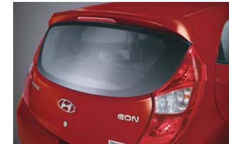
Integrated Spoiler with HMSL