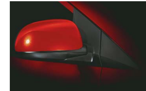
Body Colour Mirrors