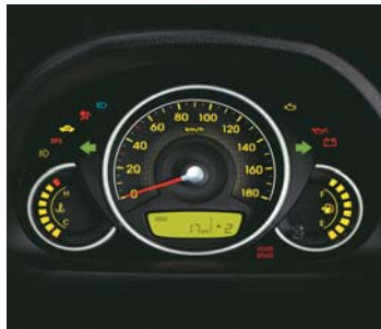
Instrument Panel with Gear Shift Indicator