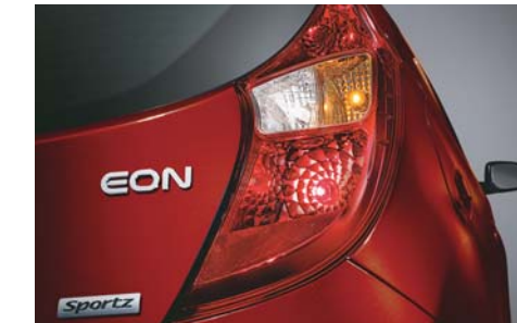
Moon Shaped Tail Lamps