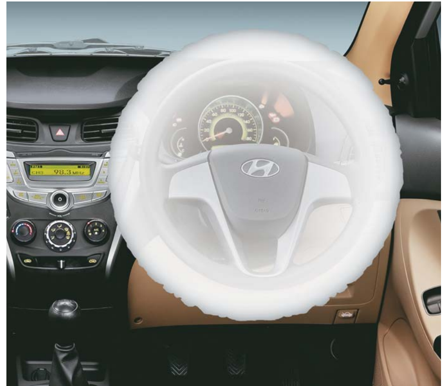
Driver Side Airbag