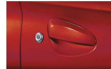
Body Colour Door Handles