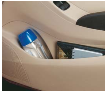
Map Pocket with Bottle Holder