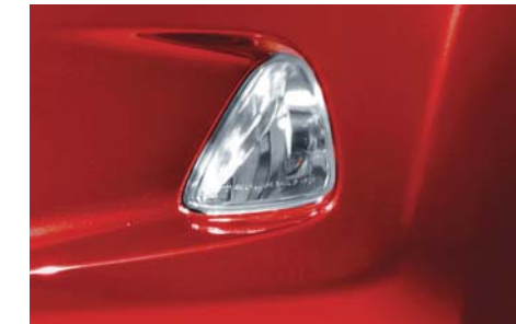
Front Fog Lamps