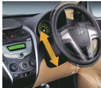
MDPS with Tilt Steering