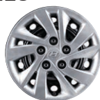
15" Steel Wheel (Standard on SE)