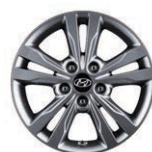
16" Alloy Wheel (Pop Pkg and Tech Pkg)