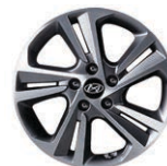
17" Alloy Wheel (Standard on Limited)