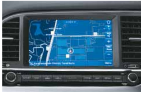
8.0 Smart Audio Video Navigation with Voice Recognition