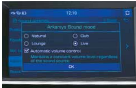
Arkamys Sound Mood