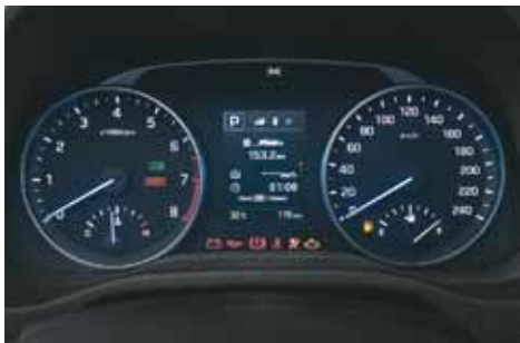
Advanced Supervision Cluster with Large 3.5 mono TFT Screen