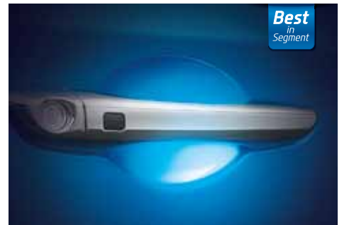
Chrome Door Handle with Pocket Light