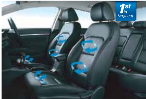
Front Seat Ventilation System