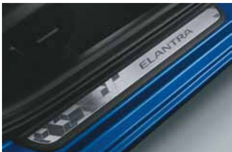
Premium Aluminium Scuff Plates