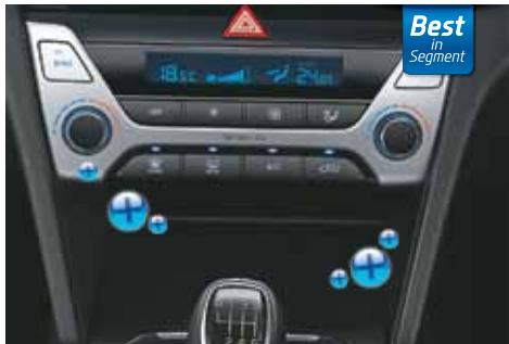
Dual Zone FATC with Cluster Ionizer