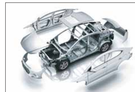
Strong Structure with 53% Advanced High Strength Steel