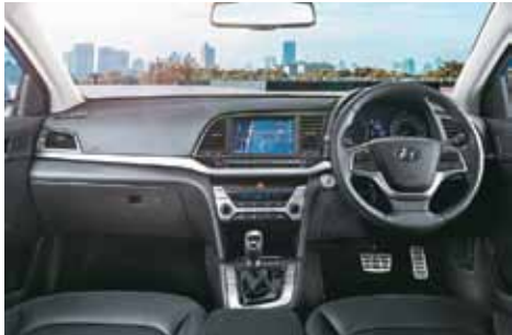
Driver Centric Ergonomic Design