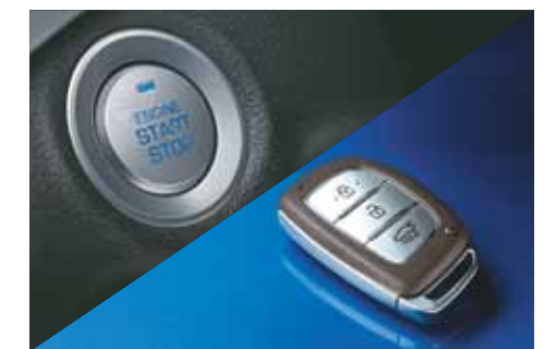
Smart Key and Push Button Start/Stop