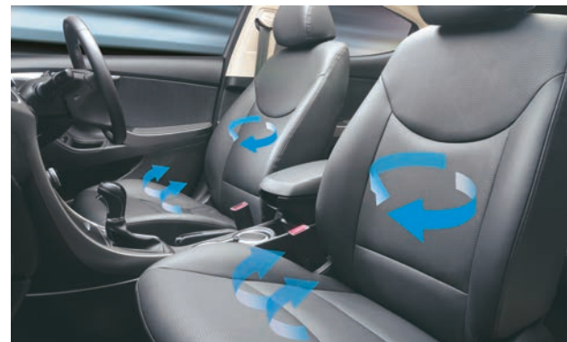
Front Seat Ventilation