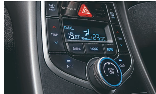
Dual Zone FATC with Auto Defogger & Cluster Ionizer