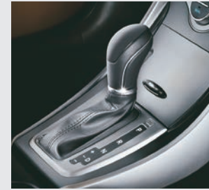
H-Matic Automatic Transmission