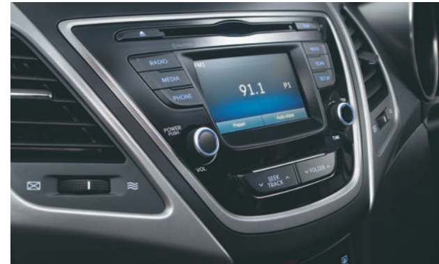
New 4.3" Touch Screen Audio with Rear View Display