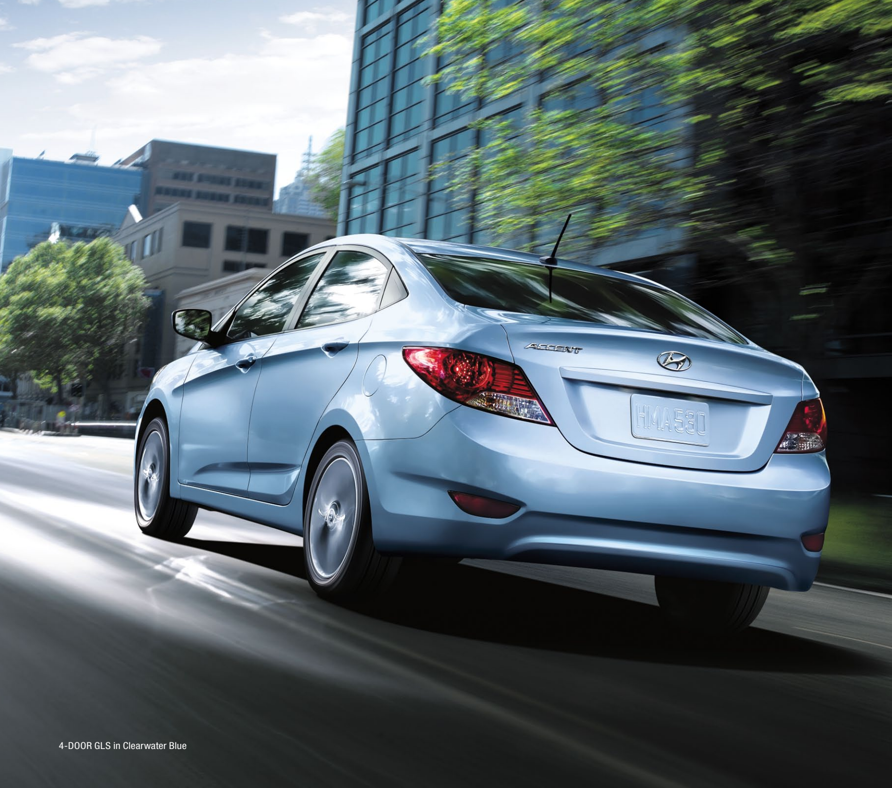
4-DOOR GLS in Clearwater Blue