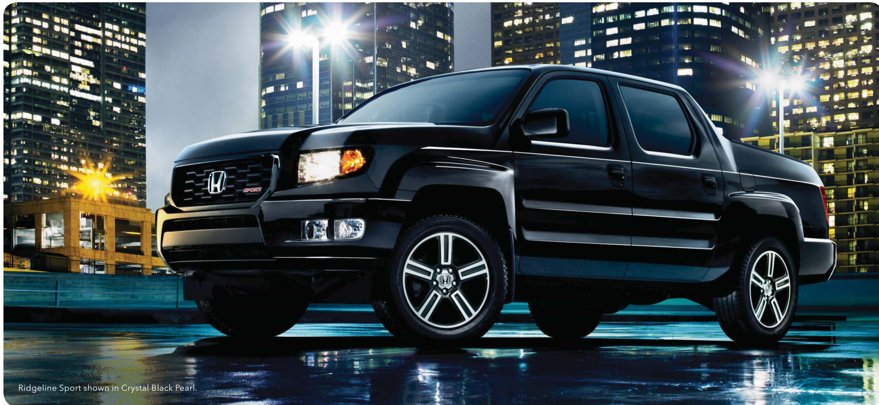
Ridgeline Sport shown in Crystal Black Pearl.