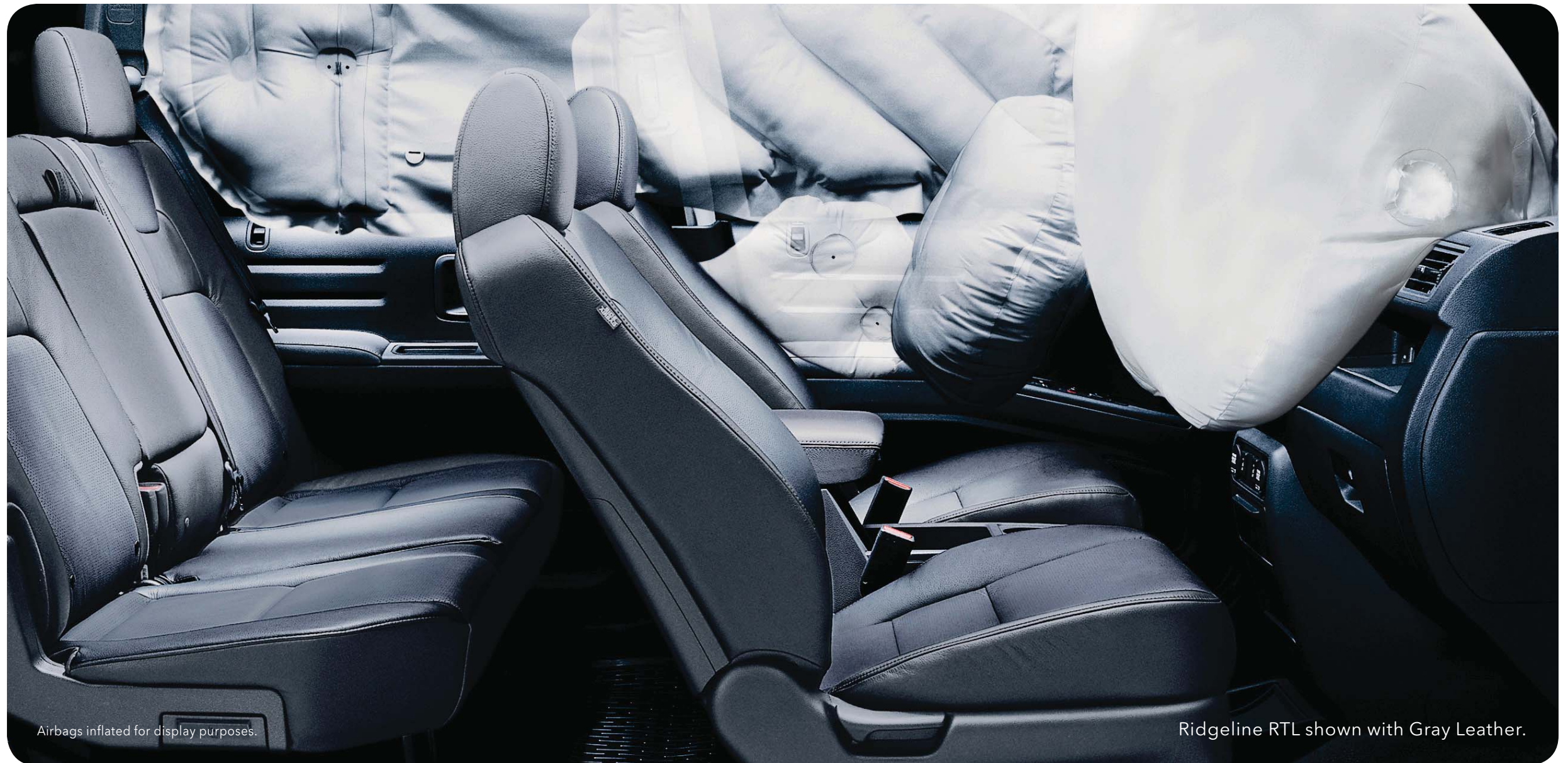
Airbags inflated for display purposes.

*Honda reminds you and your passengers to always buckle up. Children 12 and under are safest when properly restrained in the rear seat.