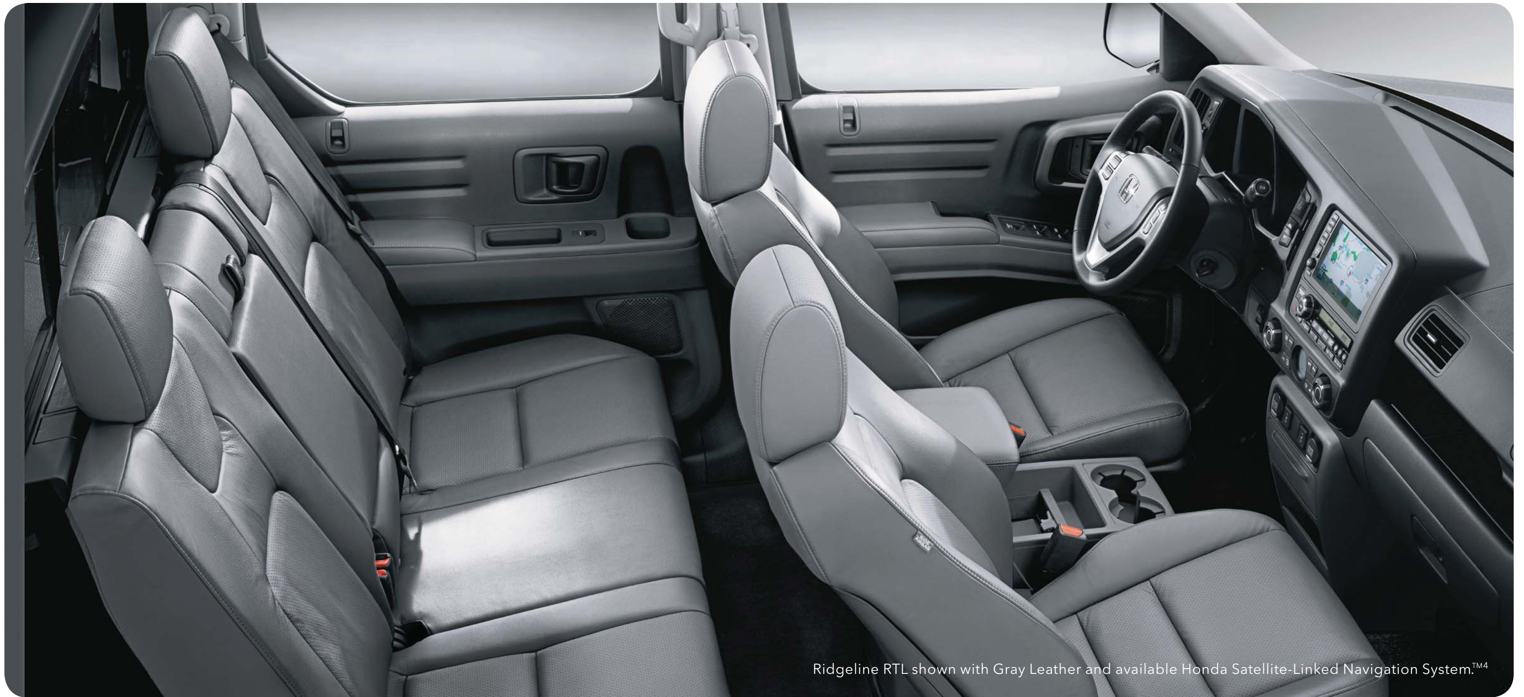
Ridgeline RTL shown with Gray Leather and available Honda Satellite-Linked Navigation System. TM4