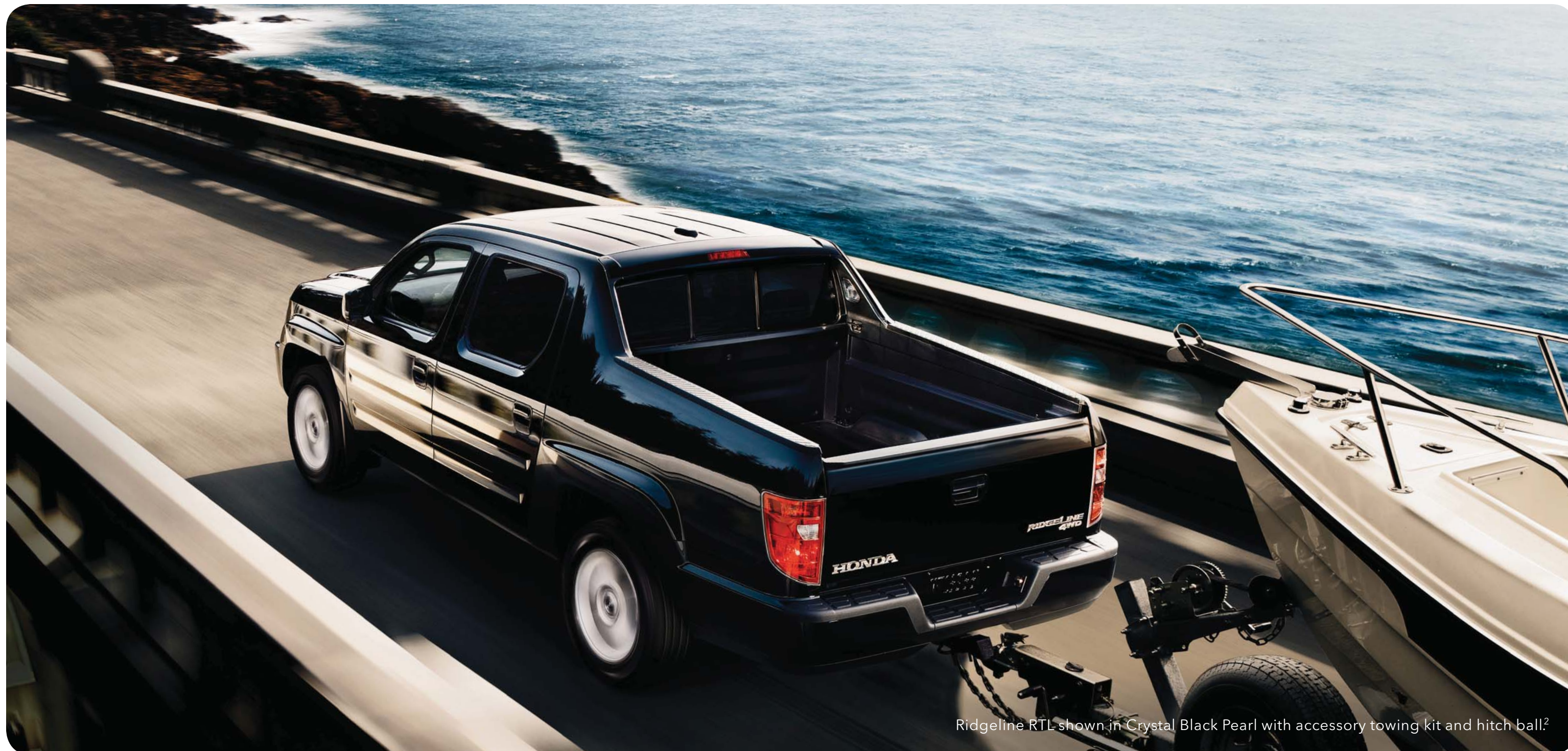
Ridgeline RTL shown in Crystal Black Pearl with accessory towing kit and hitch ball. 2