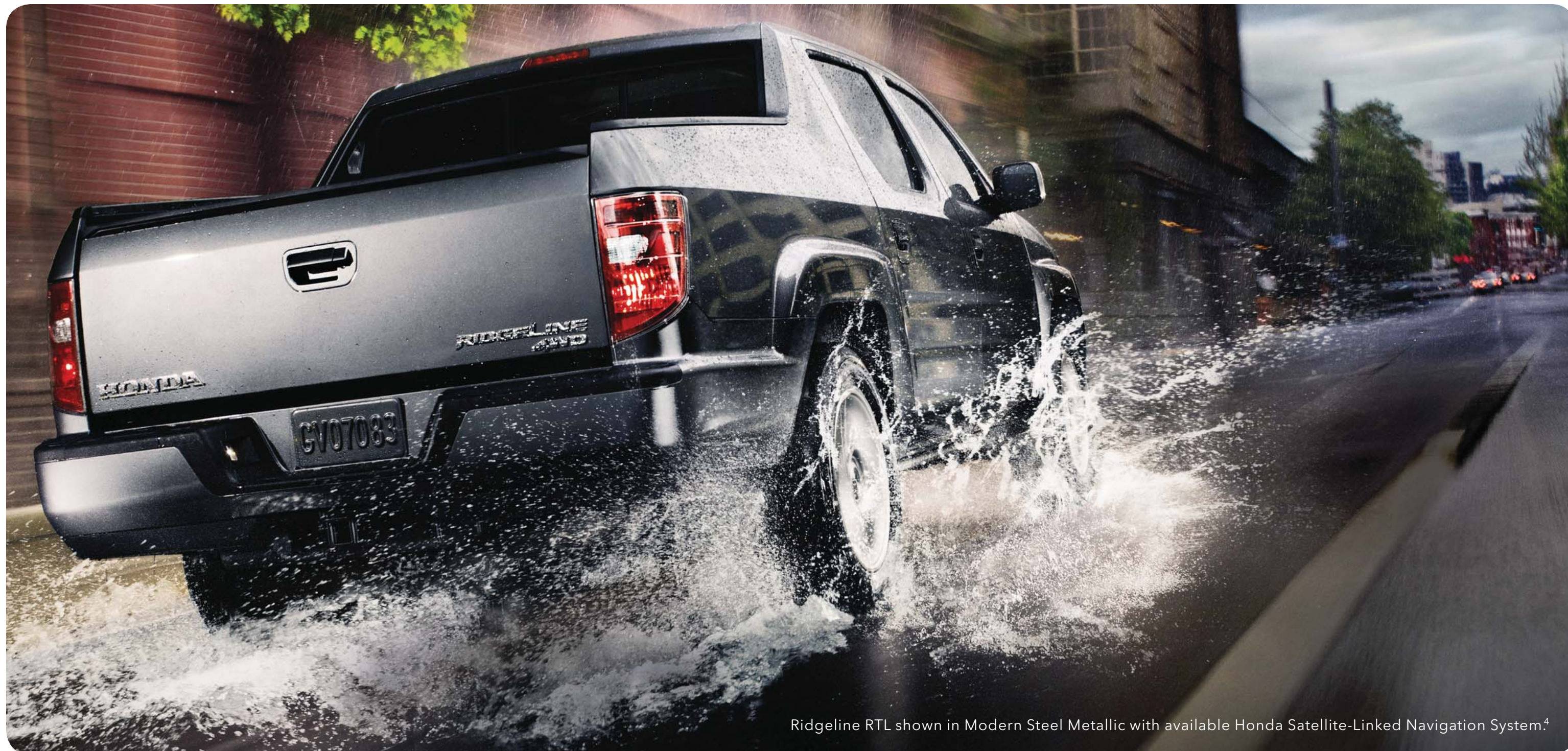
Ridgeline RTL shown in Modern Steel Metallic with available Honda Satellite-Linked Navigation System. 4