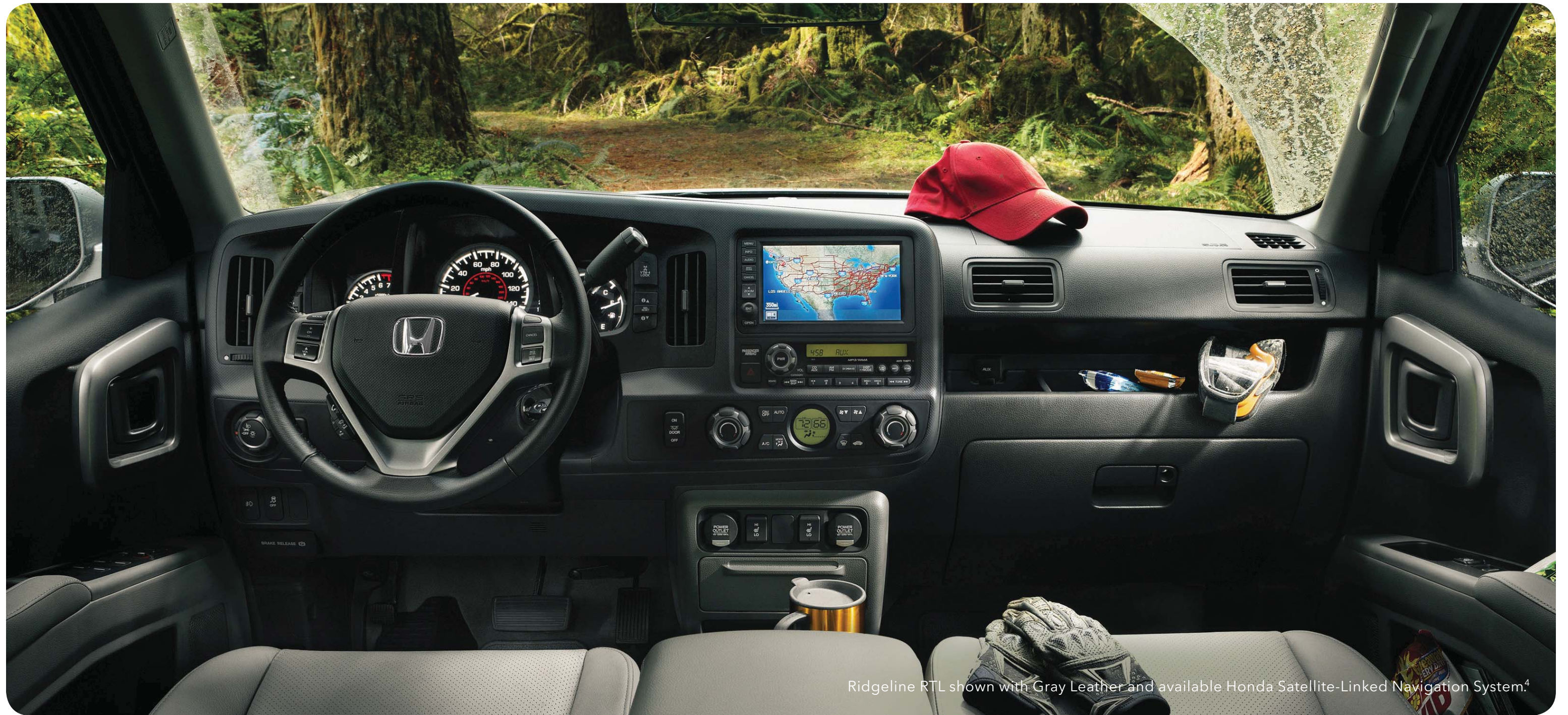
Ridgeline RTL shown with Gray Leather and available Honda Satellite-Linked Navigation System. 4