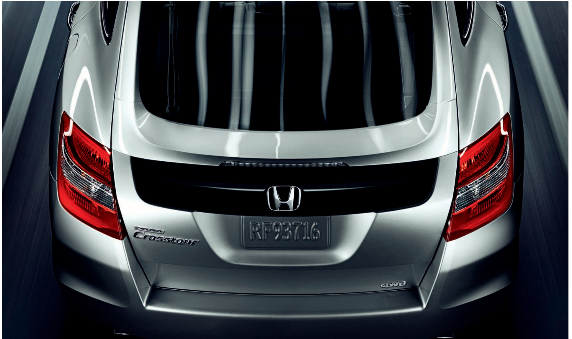
2010 Honda Cars and Trucks