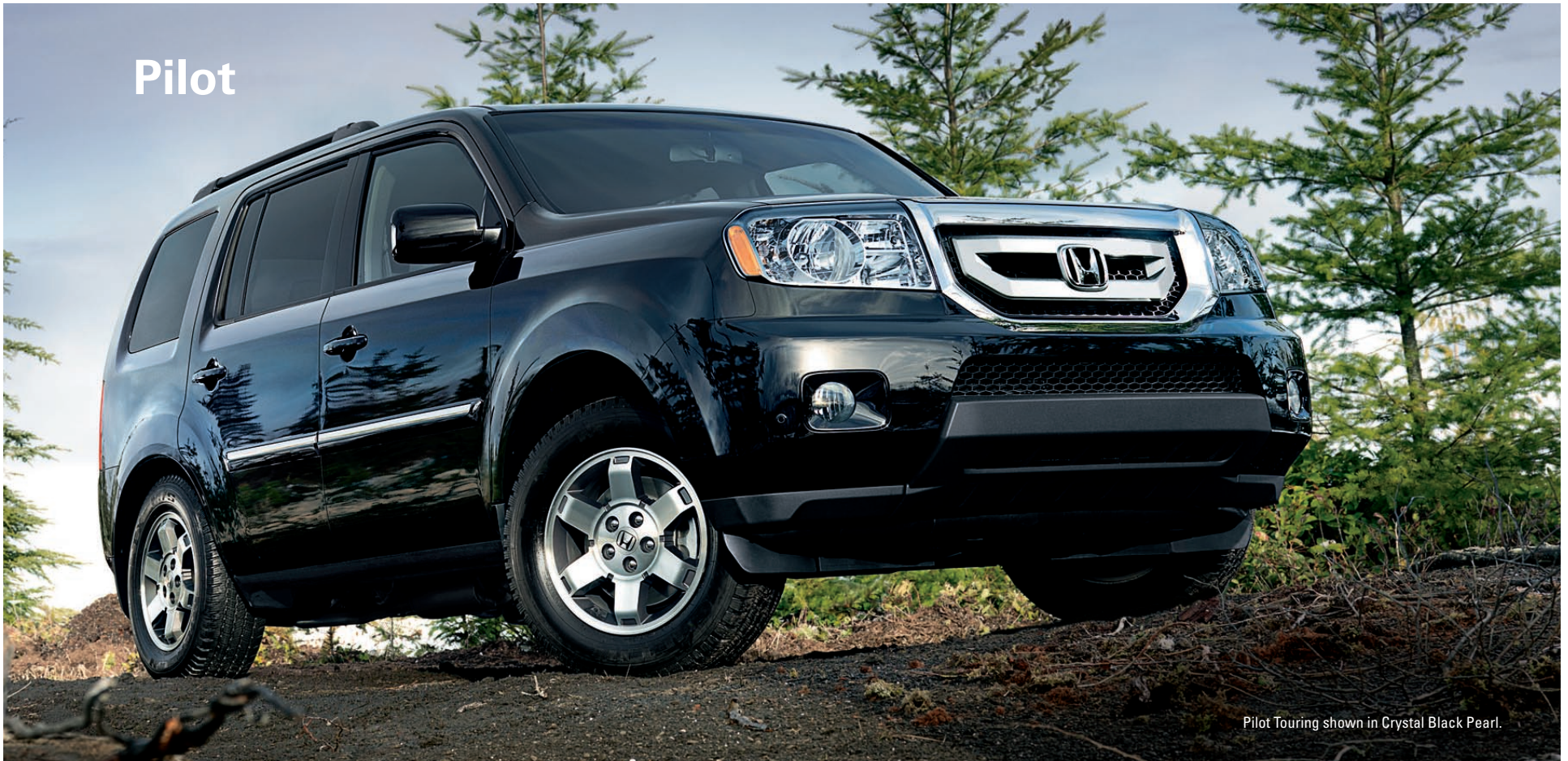
Pilot Touring shown in Crystal Black Pearl.

Ride Ready. It's all about discovering the moment. The instant where everything comes together perfectly. Achieving it is easier when you're ready for anything. With a powerful 3.5-liter V-6 engine, three comfortable rows of seats and up to 87 cu ft of cargo space, 11 the Pilot is definitely your tool of choice. And if your style leans more toward luxury, the Touring model adds features like a power tailgate and navigation system. 8 pilot.honda.com