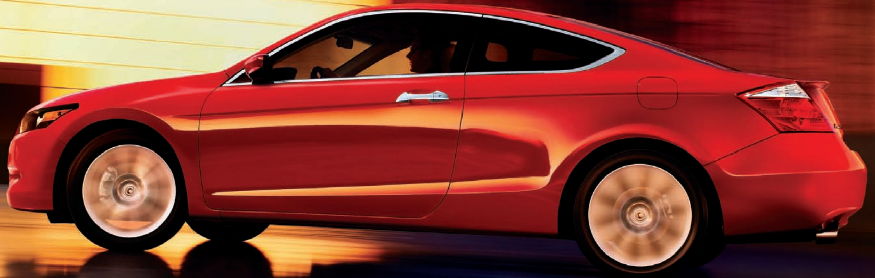
Accord EX-L V-6 Coupe shown in San Marino Red.

An icon of simplicity and style. More than just steel, aluminum, rubber and glass, the Honda Accord is a collection of ideas. Like the belief that being responsible and having fun are not mutually exclusive. Or that the proper hierarchy in automotive design is man first and machine second. Or that innovative engine technology can result in both power and efficiency. Ingeniously simple. Emphatically human. Fantastically fun. The Accord is not just a car, it's a mission statement. accord.honda.com