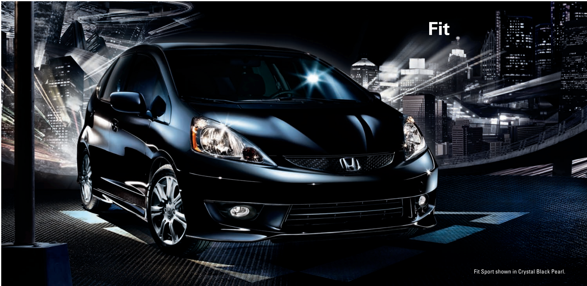
Fit Sport shown in Crystal Black Pearl.

Let's expand our expectations. Let's make choices that will benefit all of us. Like a vehicle big enough to comfortably carry five and their gear, yet gets up to 35 mpg. 1 A super-spunky engine. Trigger-happy paddle shifters on Fit Sport.* An interior with the flexibility of a contortionist. And a host of standard safety features, including Honda's exclusive Advanced Compatibility Engineering™ (ACE™) body structure. Honda Fit. A city's greatest champion. fit.honda.com