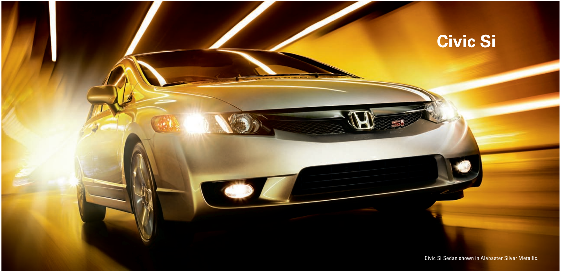
Civic Si Sedan shown in Alabaster Silver Metallic.

Let loose. Whether you choose the Si Coupe or Sedan, one thing's for sure – fun will always follow. The 2.0-liter K20 i-VTEC® engine revs up to 8000 rpm, while the performance-enhancing helical limited-slip differential and meticulously tuned suspension hold the road and your attention. With style to spare, remarkable handling and a driver-focused cockpit, the Si unleashes total performance. civic.honda.com