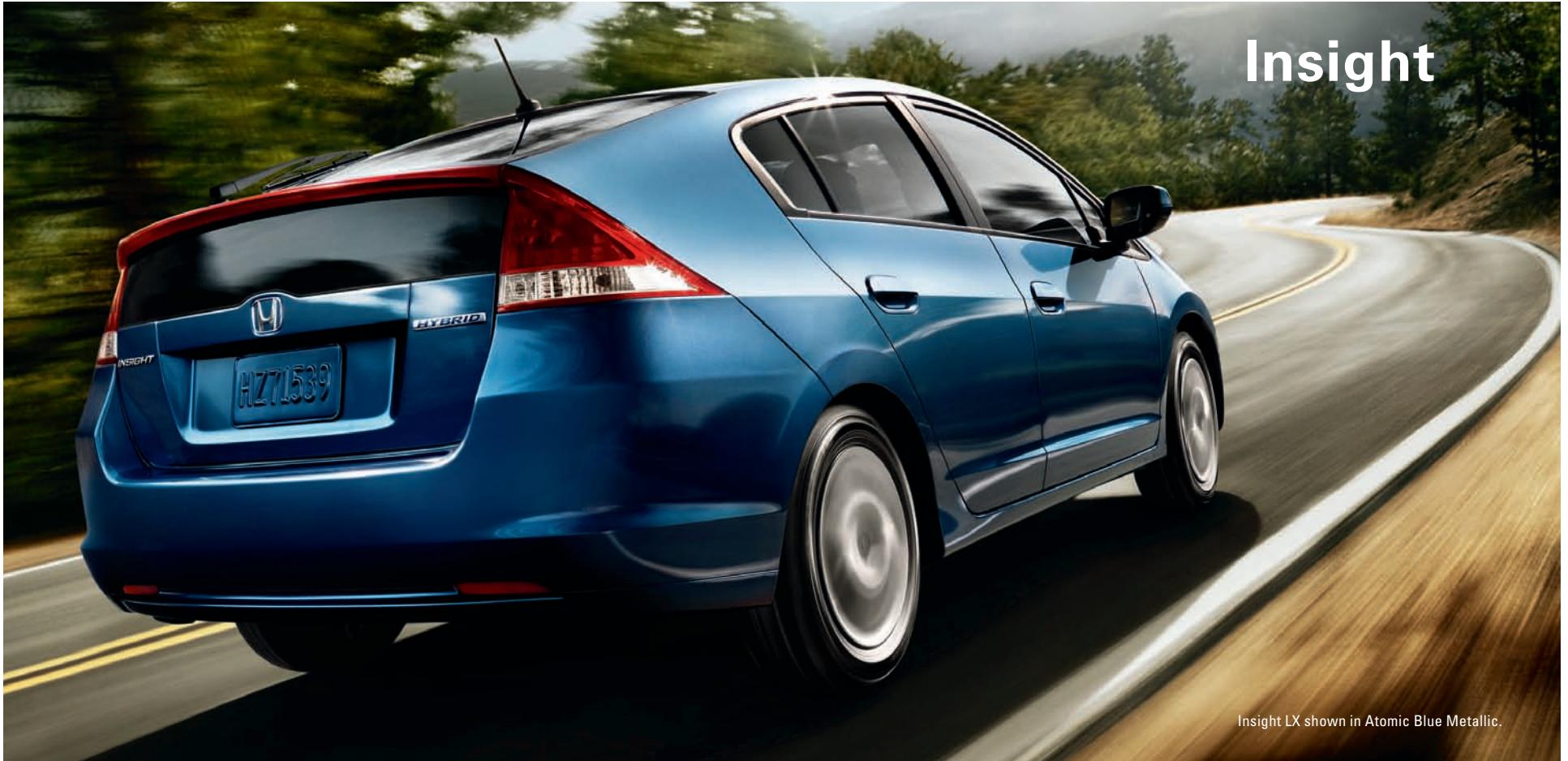
Insight LX shown in Atomic Blue Metallic.

The hybrid for everyone is here. Go on, take a closer look. Get personal with the car made with blue skies in mind. Inspect its affordable price tag, technological features like Eco Assist™ and impressive 43 mpg on the highway. 1 Just a moment with this feature-rich hybrid is all you need to understand how the greater good doesn't need to come at a greater sacrifice. Meet the Insight and see how affordability, fun and style come to life in the car designed and priced for us all. insight.honda.com