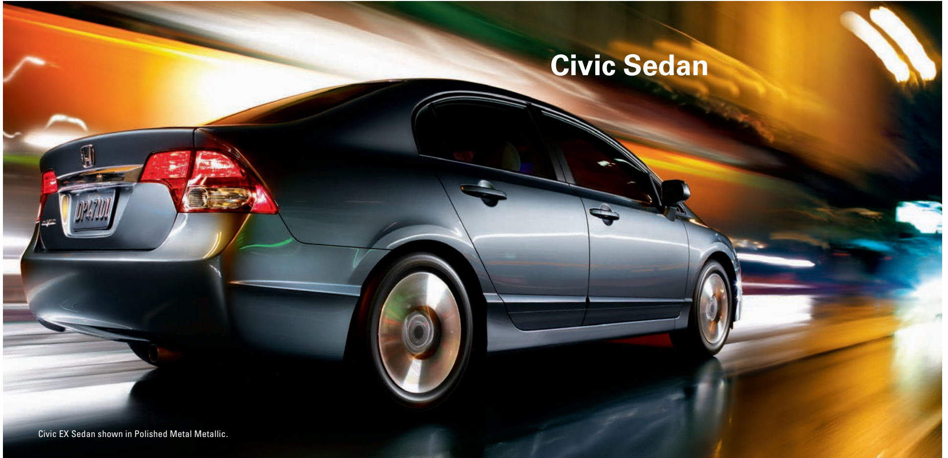
Civic EX Sedan shown in Polished Metal Metallic.

Raise your happiness quotient. Turn every day into an adventure, every commute into an escape with Civic Sedan. It adds just the right amount of rousing performance, sleek styling plus a generous dose of high-tech. The interior is specifically formulated to be a full sensory experience. Performance, technology and style. It's everything you expect from a Civic. civic.honda.com