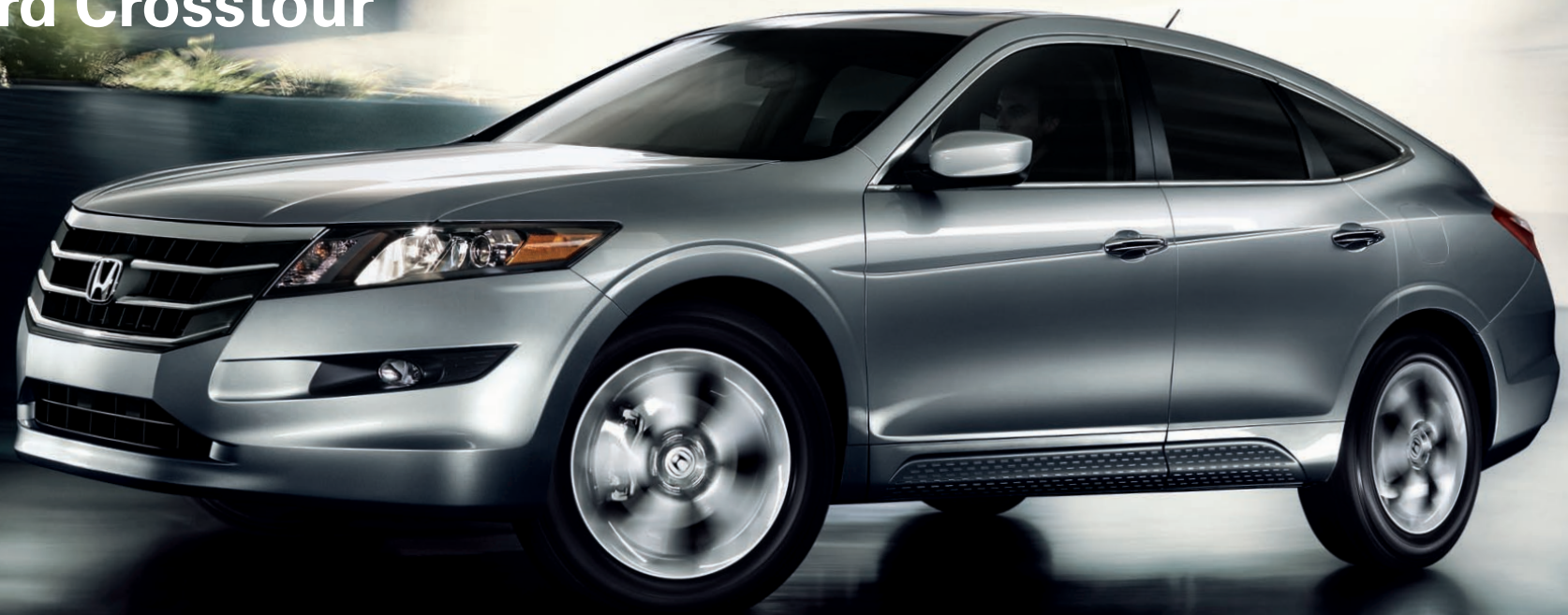
Accord Crosstour EX-L shown in Alabaster Silver Metallic.

Say hello to the modern vehicle. Smooth and sporty, with utility to spare, the all-new Accord Crosstour is a refreshingly new way to think about vehicles. The Crosstour offers a commanding view, and comfortable seating for five. The sloping rear tailgate opens to reveal a spacious cargo area. The 60/40 split rear seatback is spring-activated, and levers can be easily reached from the cabin or from the rear cargo area. 11 A removable, water-resistant under-floor utility box is just right for stashing gear. Plus, the carpeted rear floor panels can be flipped hard-side-up for durability. It's a whole new way to get ahead. crosstour.honda.com