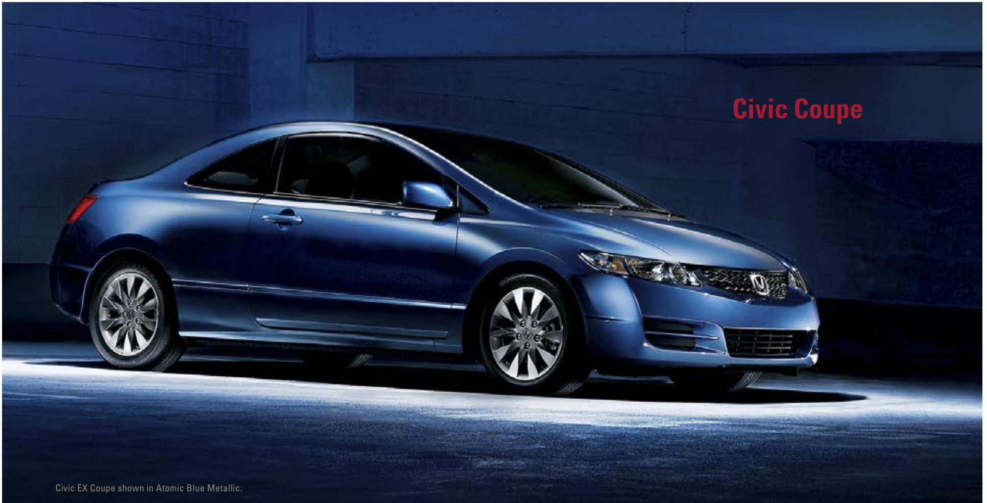
Civic EX Coupe shown in Atomic Blue Metallic.

Speed up the attraction. The catalyst? A Honda Civic Coupe. With a bolder front grille, sleeker front bumper and sharper moves, the new Civic Coupe will definitely spark a reaction. Inside, the amenities are just as attention-getting, like Honda's USB Audio Interface, 4 standard on EX models and above. The fun factor just increased exponentially. civic.honda.com