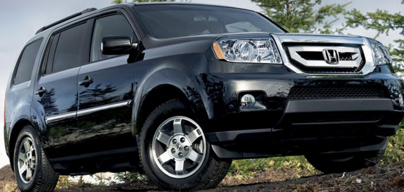
Pilot Touring shown in Formal Black.

Ride ready. It's all about discovering the moment. The instant where everything comes together perfectly. Achieving it is easier when you're ready for anything. With a powerful 3.5-liter V-6 engine, three comfortable rows of seats and up to 87 cu ft of cargo space, 1 the new Pilot is definitely your tool of choice. And if your style leans more towards luxury, a new Touring model adds features like a power tailgate, navigation system 6 and Bluetooth ®7 HandsFreeLink.® pilot.honda.com