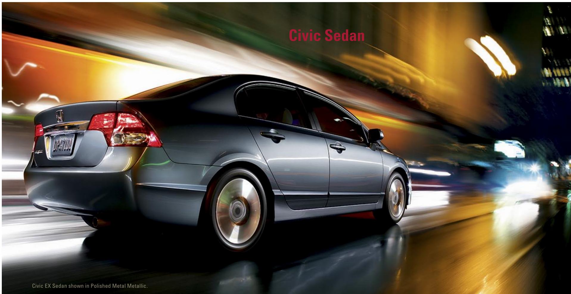
Civic EX Sedan shown in Polished Metal Metallic.

Raise your happiness quotient. Turn every day into an adventure, every commute into an escape with Civic Sedan. It adds just the right amount of rousing performance, keen-edged styling plus a generous dose of high tech. The interior is specifically formulated to be a full sensory experience. And with two new trims for 2009, you'll have no problem finding the Civic of your dreams. civic.honda.com