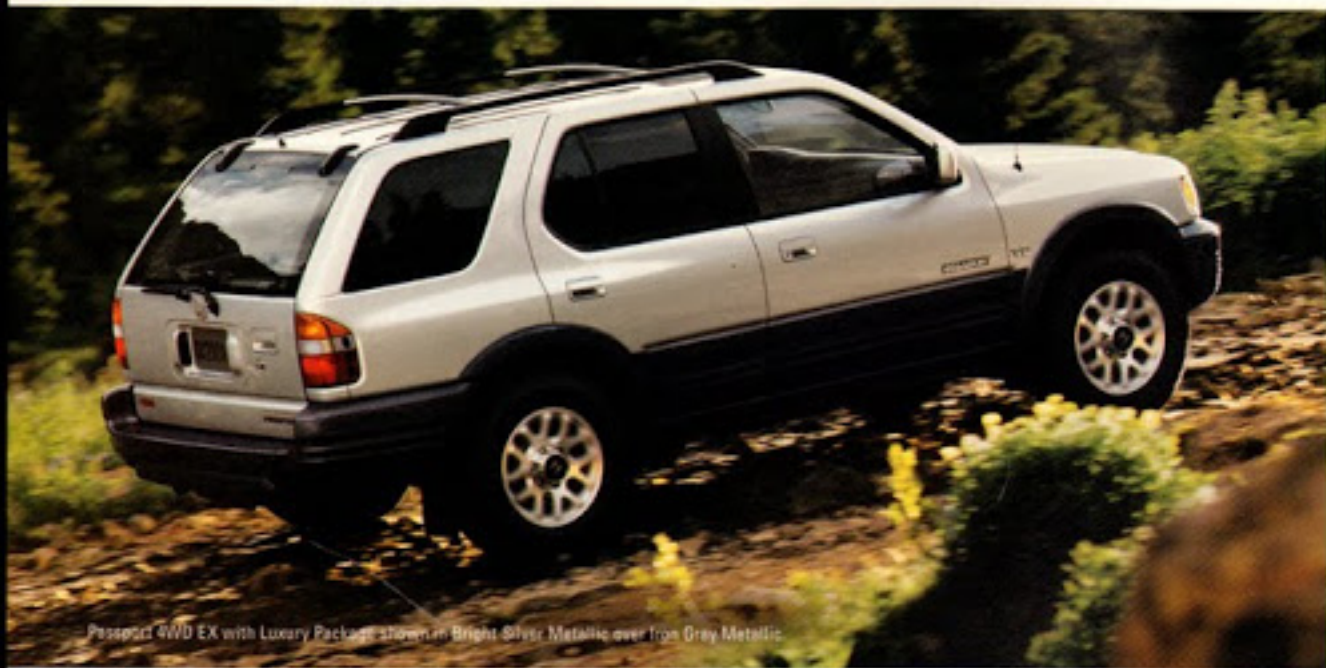
Passport 4WD EX with Luxury Package shown in Bright Silver Metallic over Iron Gray Metallic

Don't stop when the pavement runs out. It's okay, because you can move from 2WD on the road directly to 4WD off-road traction with the Passport's shift-on-the-fly feature. And when the going gets really tough, shift the transfer case to low-range and get some real mountain-moving leverage.