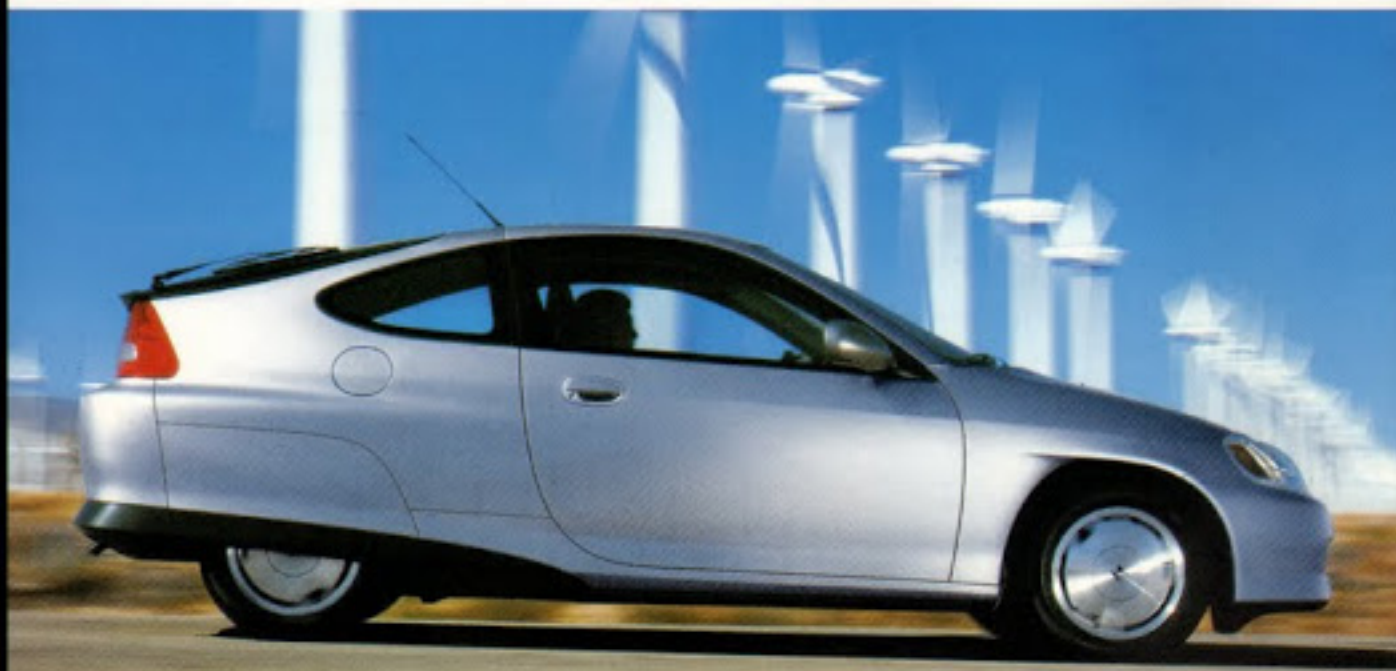
Insight shown in Silverstone Metallic.

Sporty. Fun to drive. And 68 mpg/highway. † This is what's possible when Honda sets its mind to creating the first gasoline-electric hybrid in America. It integrates a highly efficient gasoline engine with a powerful electric motor—and adds extraordinary aerodynamics and weight-reducing measures—for a responsive, lively coupe that can go up to 700 miles between fill-ups. † And it recharges itself, so you never have to plug it in.