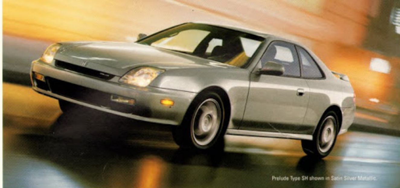
Prelude Type SH shown in Satin Silver Metallic.

Can you see the racecar beneath its sleek form? The Prelude is a direct descendant of Honda's long and storied racing heritage. So you'll certainly feel it—in the instant response of its 200-hp engine and the precision handling of its 4-wheel double wishbone suspension. And the Prelude's cockpit is designed for long-term enjoyment, with formfitting seats and a broad array of amenities. One drive, and you'll quickly see.