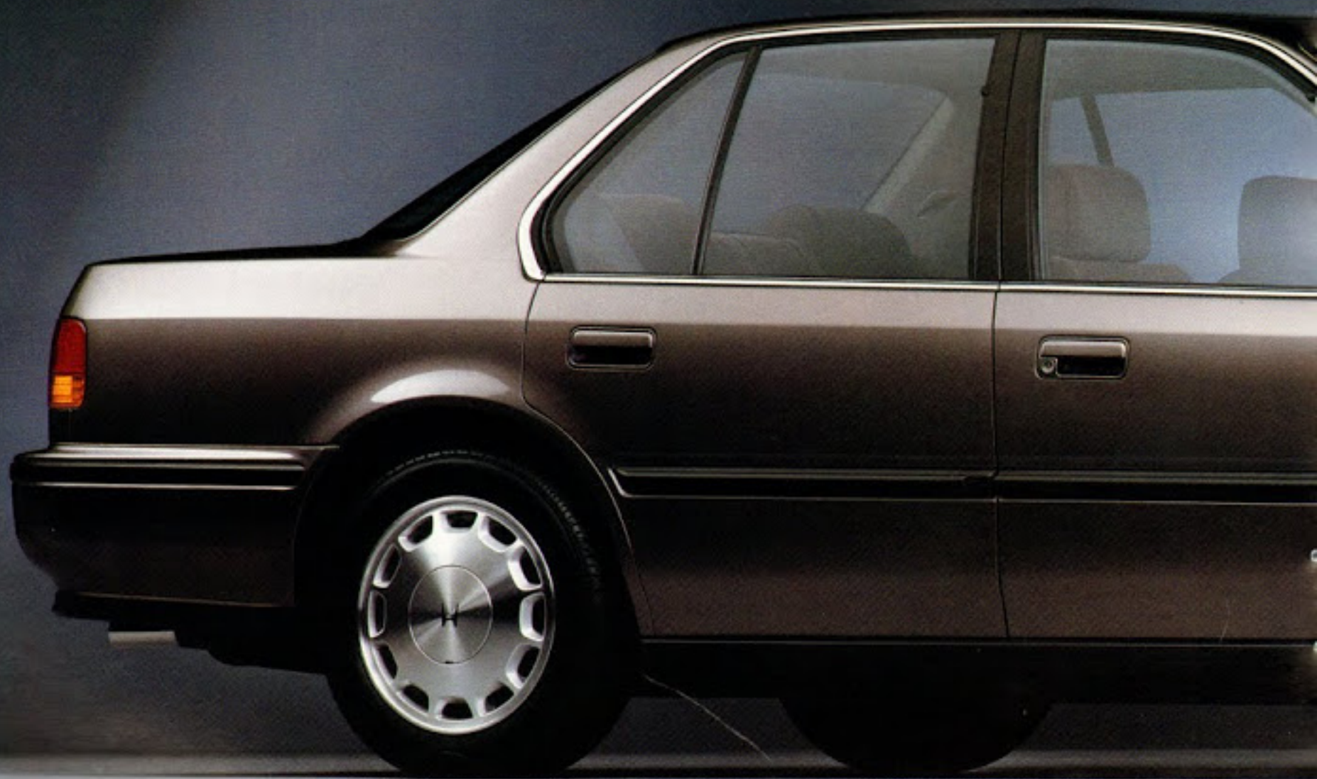
ACCORD EX SEDAN SHOWN IN ROSEWOOD BROWN METALLIC