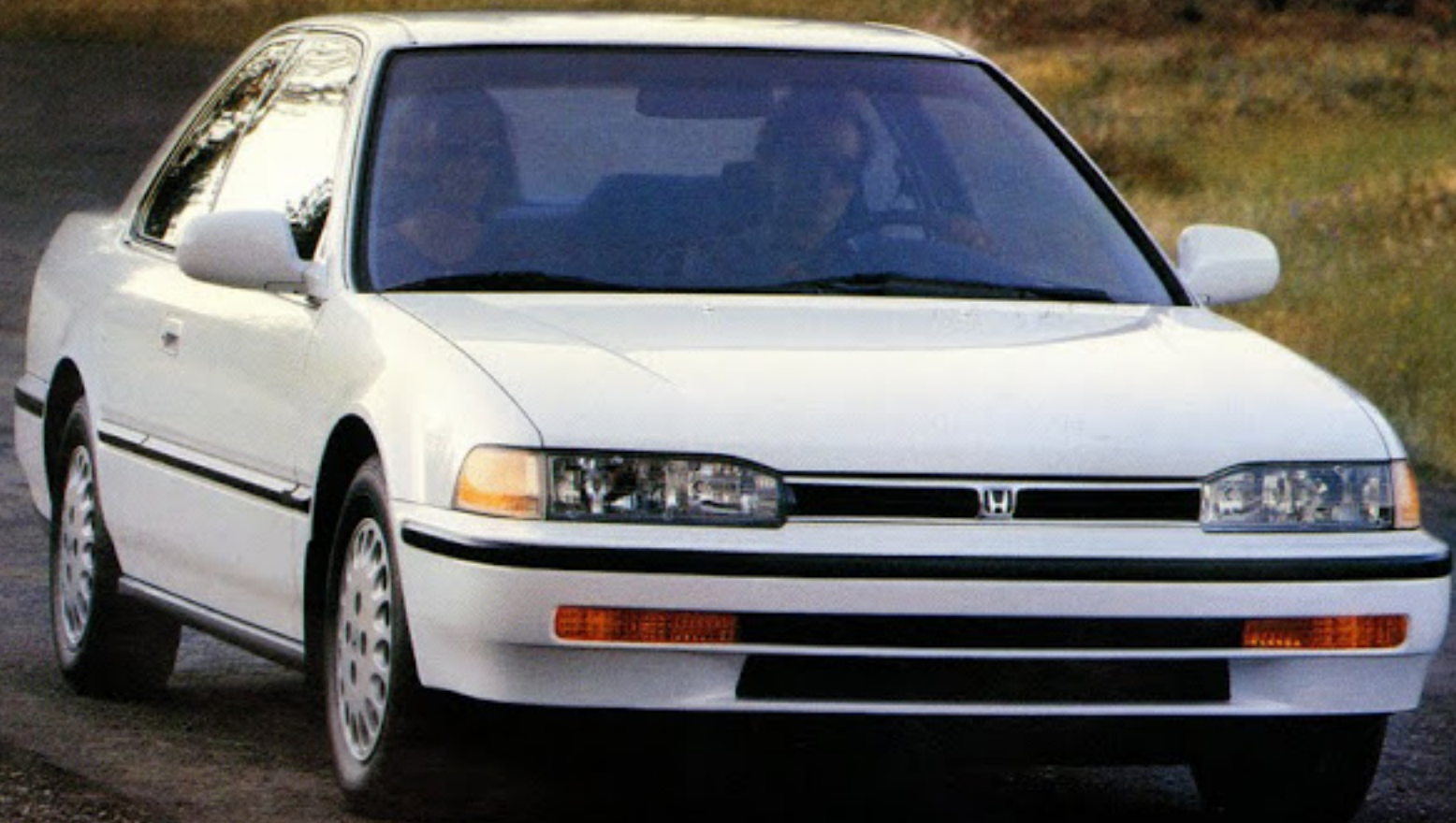
ACCORD LX COUPE SHOWN IN FROST WHITE®