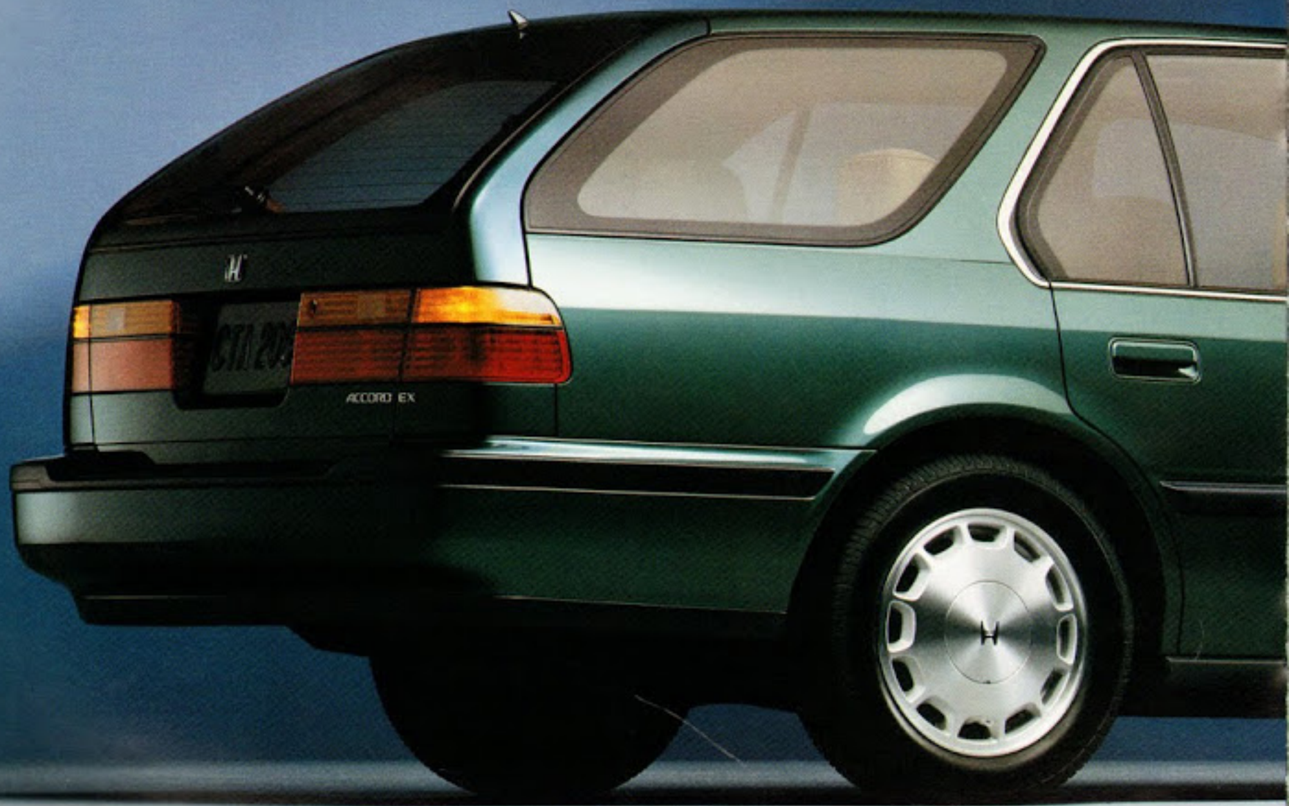
ACCORD EX WAGON SHOWN IN ARCADIA GREEN PEARL