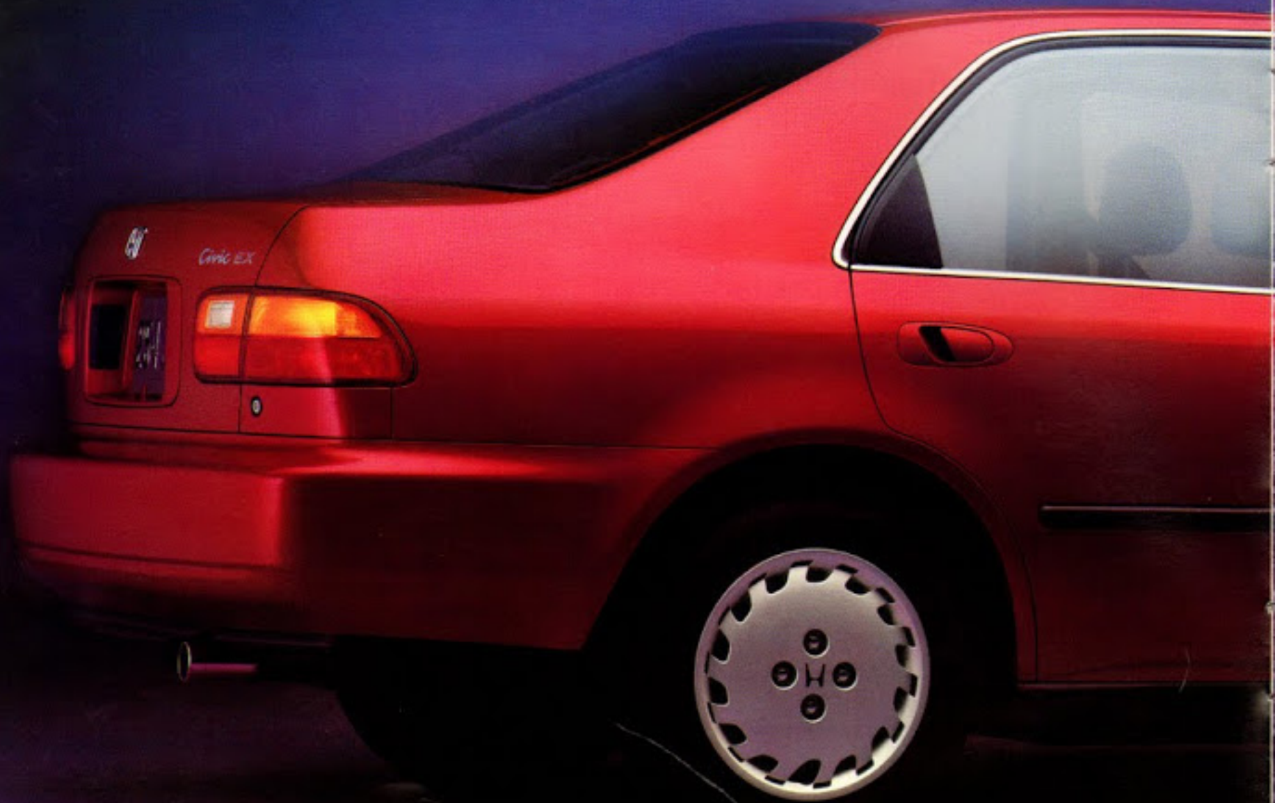
CIVIC EX SEDAN SHOWN IN TORINO RED PEARL