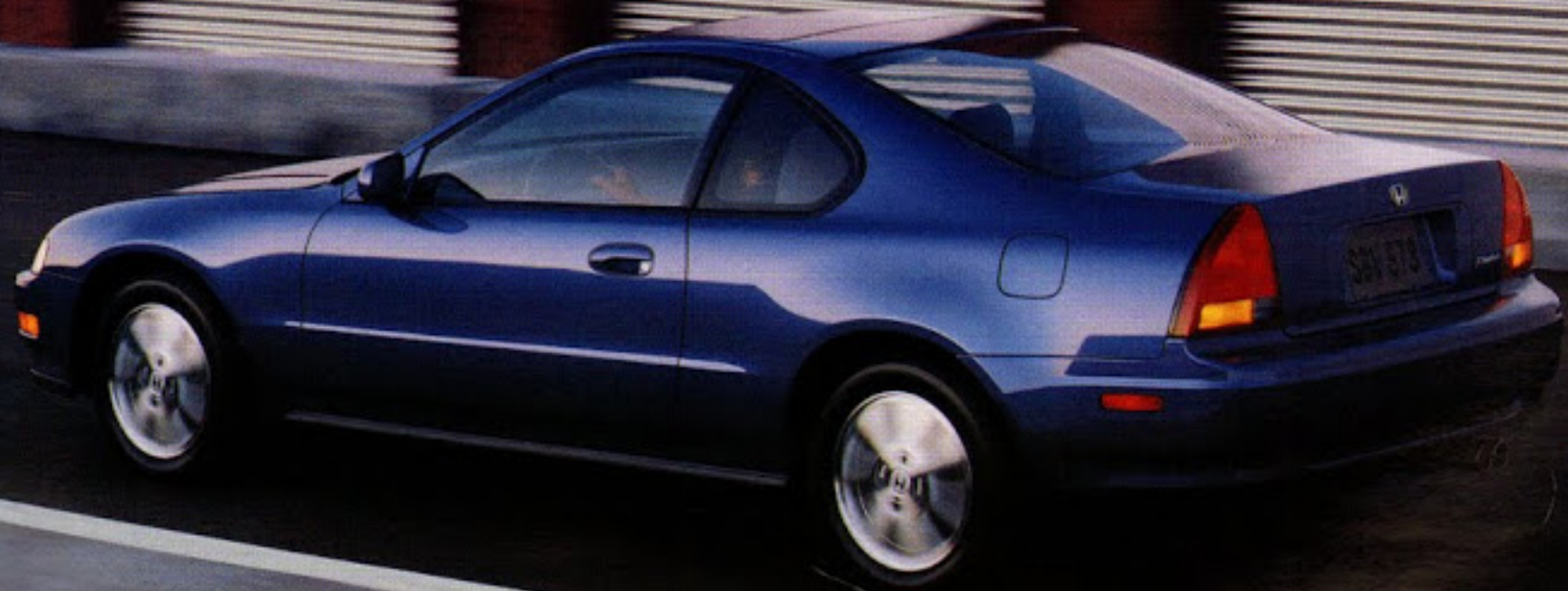
PRELUDE Si SHOWN IN FRESCO BLUE PEARL