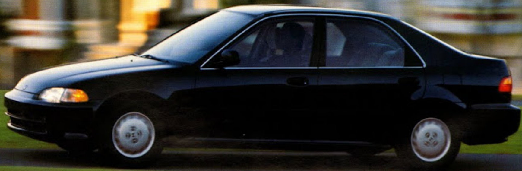
CIVIC LX SEDAN SHOWN IN PHANTOM GRAY PEARL.