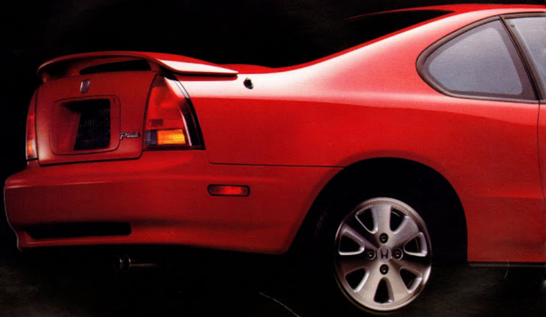
PRELUDE Si SHOWN IN MILANO RED WITH ACCESSORY SPOILER