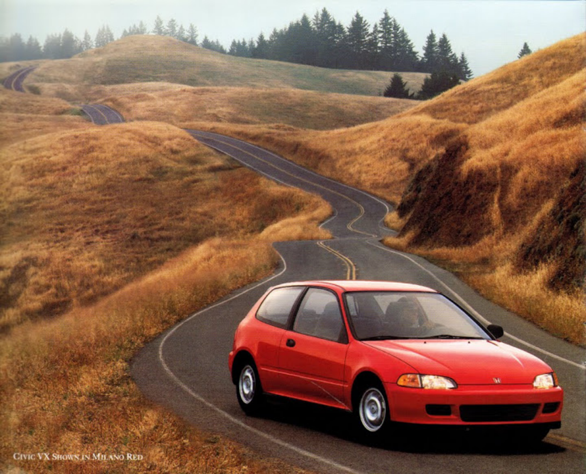
CIVIC VX SHOWN IN MILANO RED