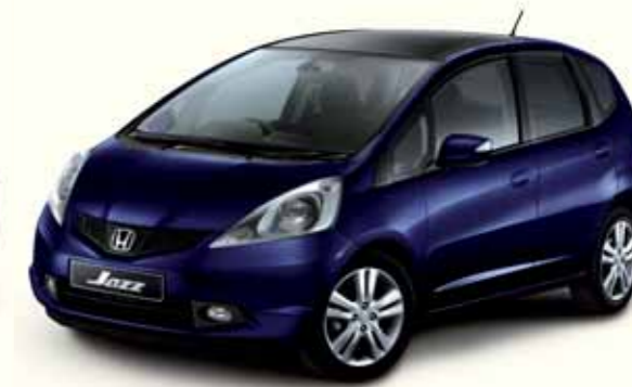
DEEP VIOLET PEARL