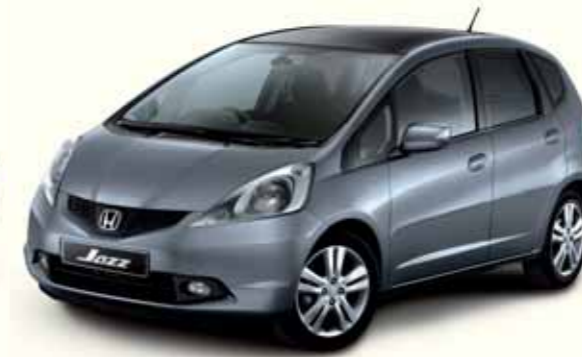
STORM SILVER METALLIC