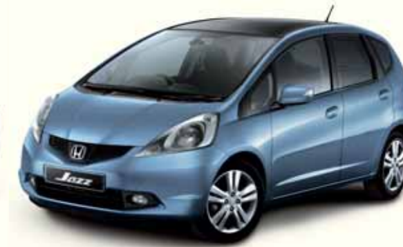
SHERBET BLUE METALLIC