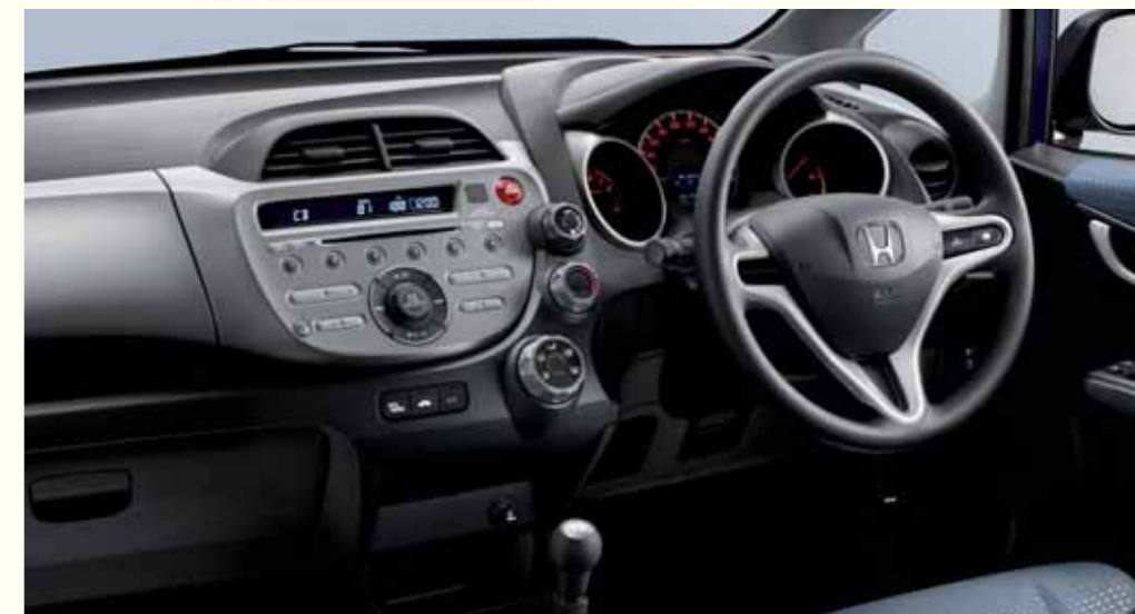
Model shown is 1.2 i-VTEC SE Manual