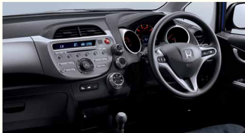
Model shown is 1.4 i-VTEC ES Manual