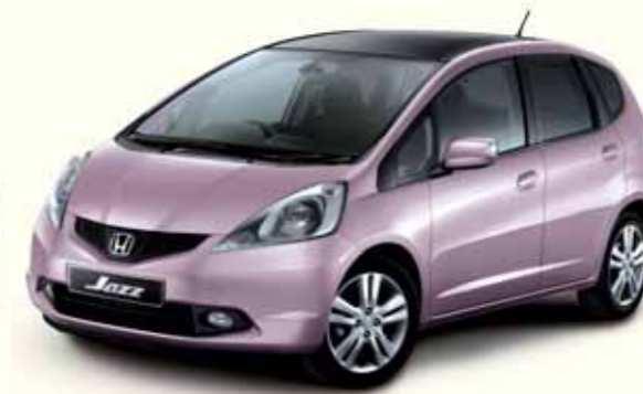
COOL ROSE METALLIC