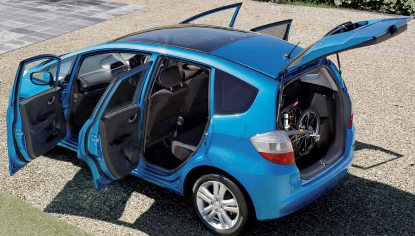
Model shown is 1.4 i-VTEC EX with 16" alloy wheels