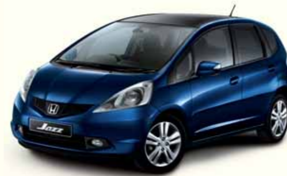
DEEP SAPPHIRE BLUE PEARL