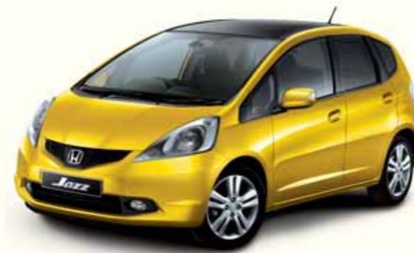
HELIOS YELLOW PEARL