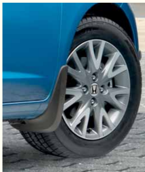
Shown with accessory 15" Crystal alloy wheels