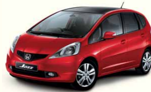
MILANO RED (SOLID)