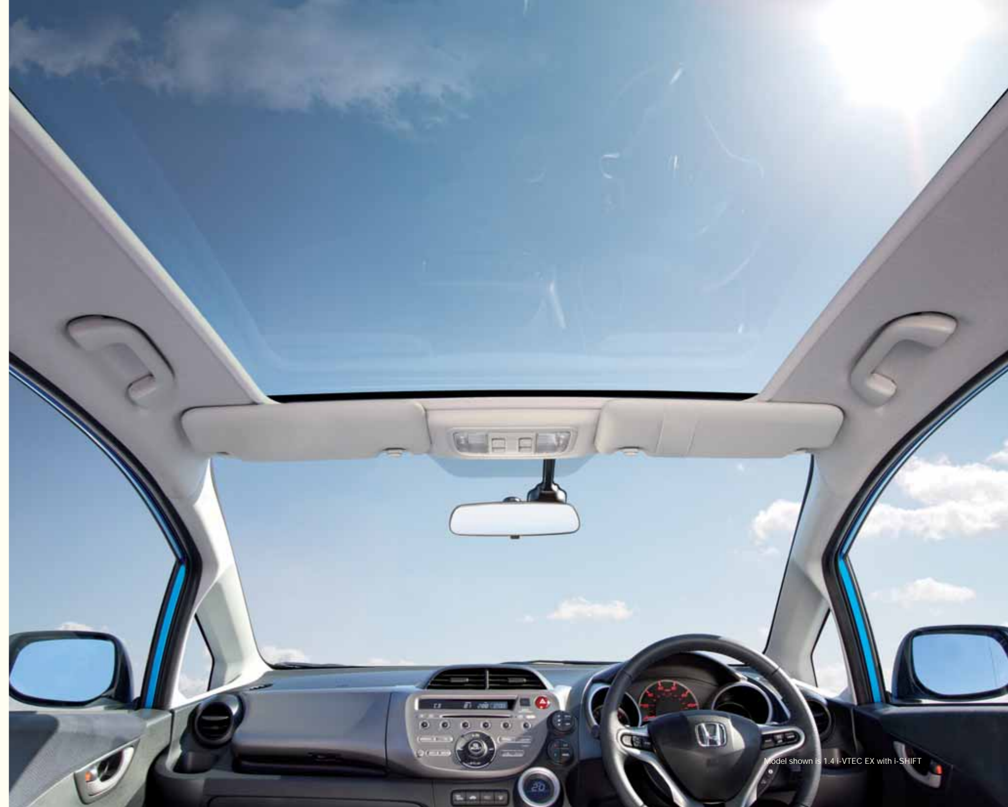
Model shown is 1.4 i-VTEC EX with i-SHIFT