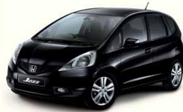
CRYSTAL BLACK PEARL