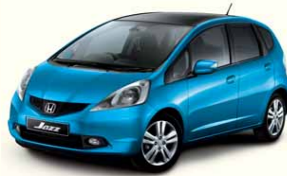
CERULEAN BLUE METALLIC

Crystal Black, Milano Red, Storm Silver, Sherbet Blue. These are just four of your colour options. In keeping with the Jazz's flexible approach we've provided ten distinctive colours to let you find the right choice for your personality.