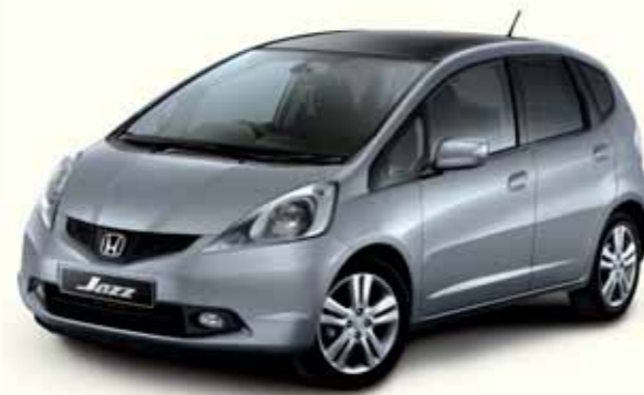
ALABASTER SILVER METALLIC