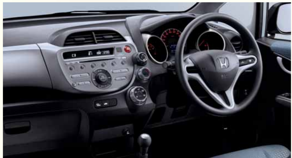
Model shown is 1.2 i-VTEC S Manual