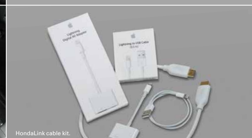
HondaLink cable kit.