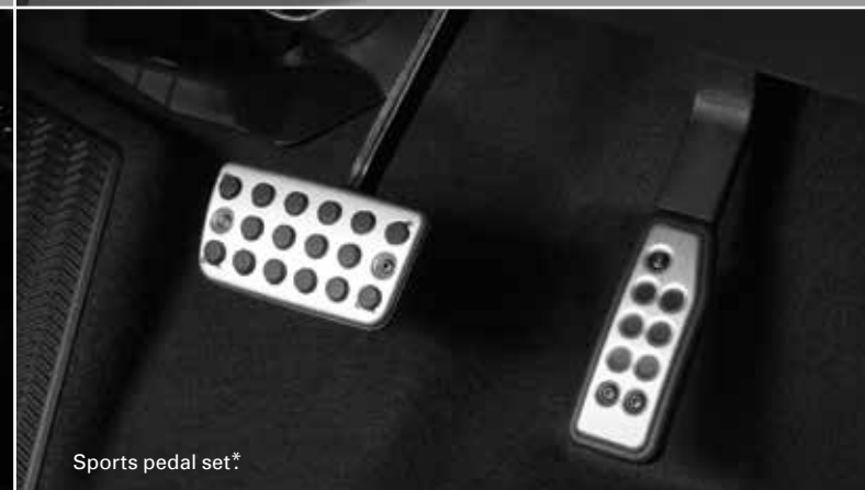
Sports pedal set *