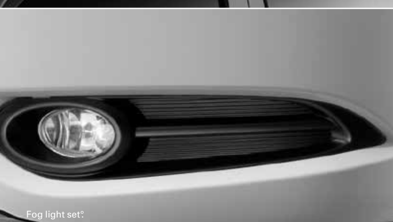
Fog light set ‡