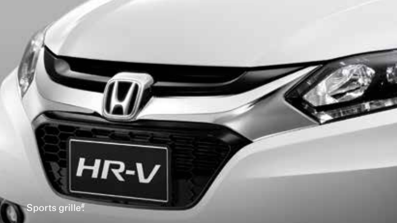
Sports grille ‡