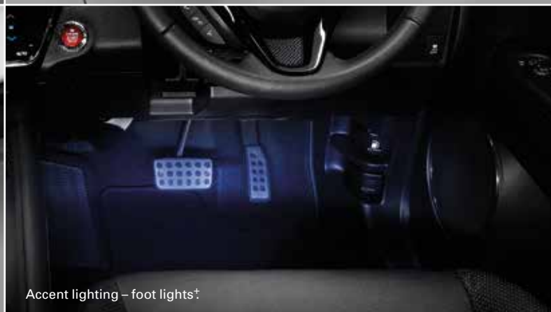
Accent lighting – foot lights ‡