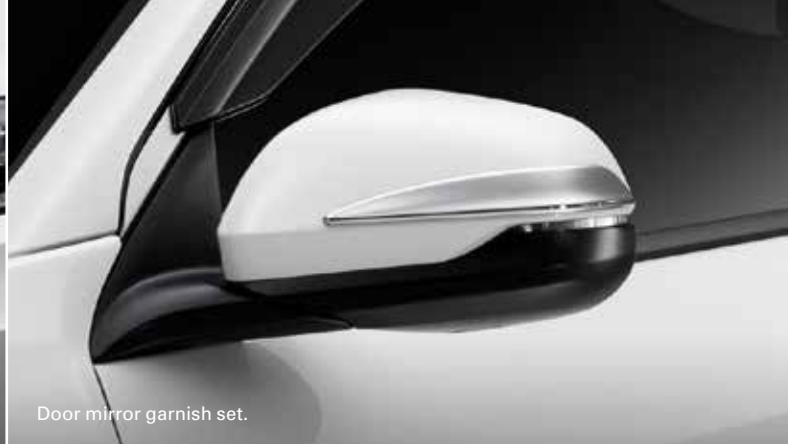
Door mirror garnish set.