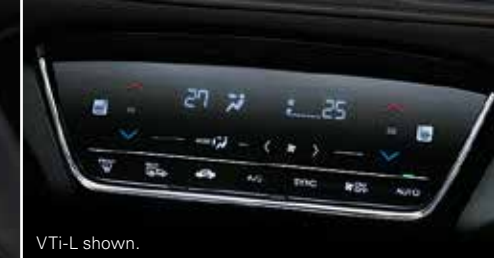
Electrostatic climate control

With a gentle push of the turn indicator, HR-V indicates three times before automatically turning off. For continuous indication, just press until you feel it lock into place.