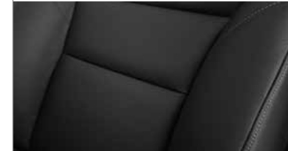
Black leather-appointed seat trim† – VTi-L models.