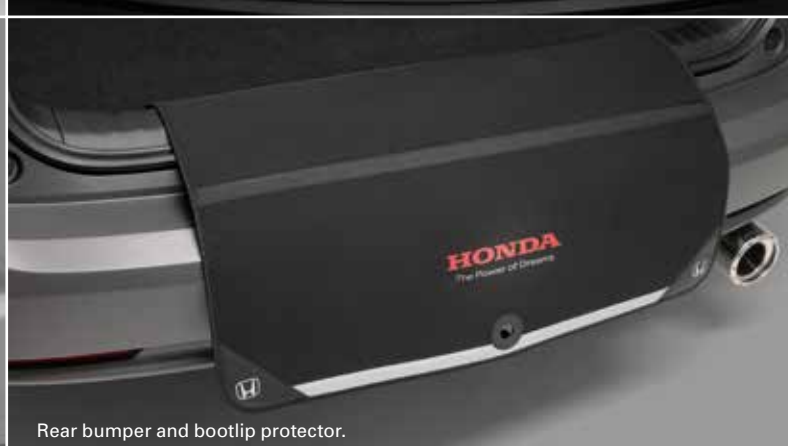
Rear bumper and bootlip protector.