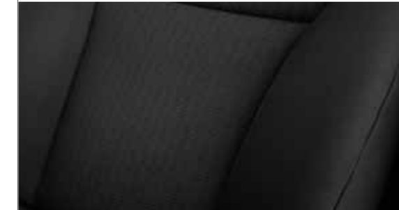
Black fabric seat trim – VTi and VTi-S models.