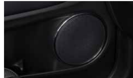
6-speaker audio system

Conduct the interior climate from the front seat using the button-free electrostatic climate control panel. Simply swipe up or down or tap to pinpoint your perfect cruising temperature.