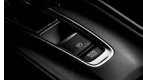
Electric Parking Brake (EPB)

When you're breaking new ground, it's handy to be able to see where you're going. The HR-V provides a multi-angle reversing camera – normal view, wide view and top-down view – which all display conveniently on the screen in front of you. But the most ingenious camera angle of all is LaneWatch. Designed to minimise one of the most notorious blind spots for any vehicle, LaneWatch comes standard on the VTi-S and above. Mounted beneath your left-hand door mirror, the blind spot camera appears on screen from the first moment you signal left. When it comes to safety, HR-V has you covered.