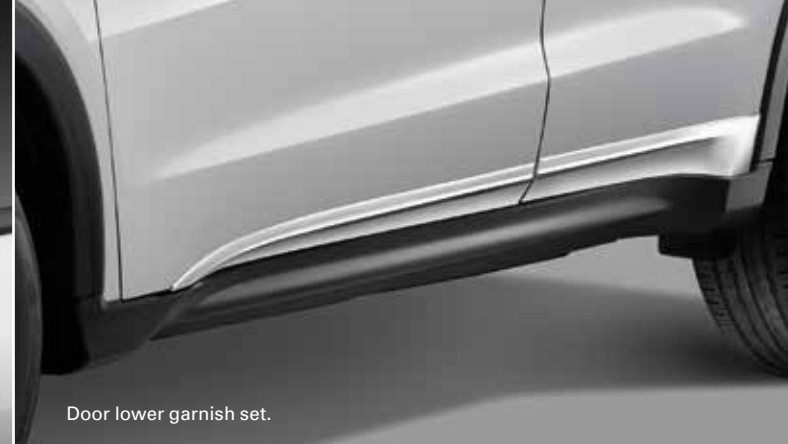
Door lower garnish set.