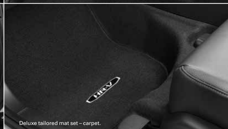
Deluxe tailored mat set – carpet.