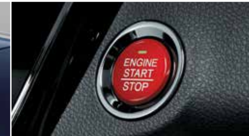
Smart entry with push button start

Because you never know where the next adventure could take you, it pays to be ready for anything. The roof rails with the Roof Rack Set accessory option extend the HR-V storage capacity even further. (VTi-S and above).