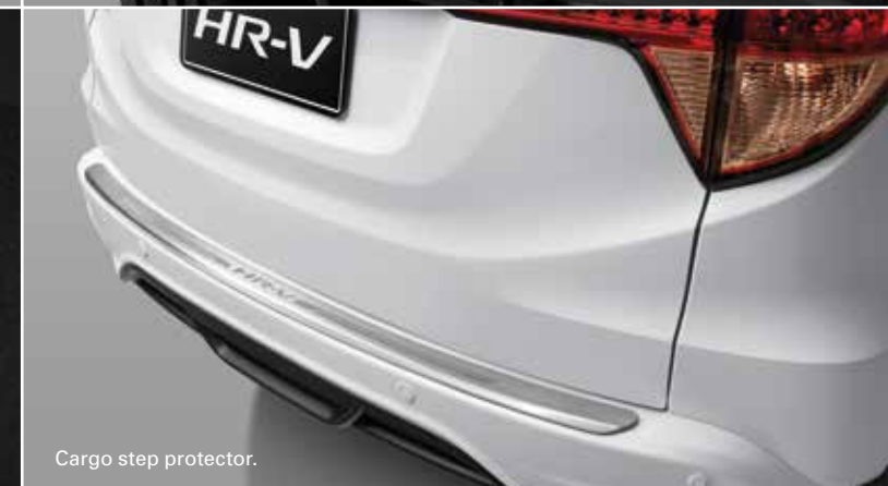
Cargo step protector.