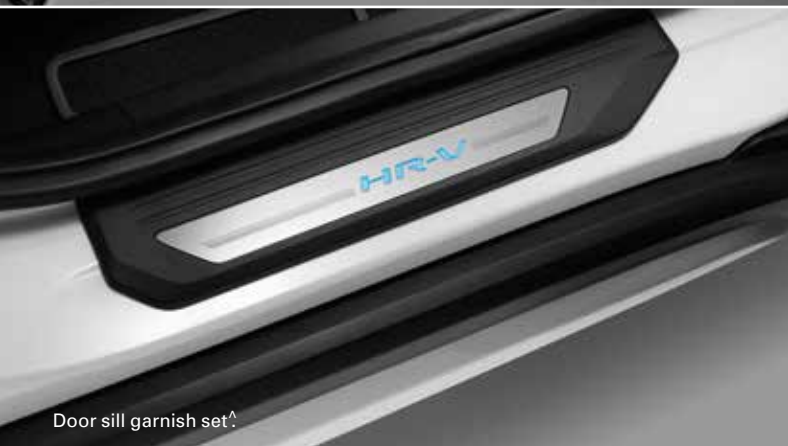
Door sill garnish set ^