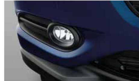
Front fog lights

Approach the car with key fob in pocket (or bag) and just like magic, the front door or boot will automatically release. Then take your place behind the wheel, push start, and you're on your way (VTi-S and above).