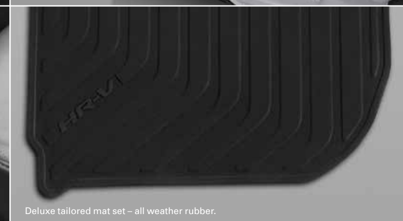
Deluxe tailored mat set – all weather rubber.