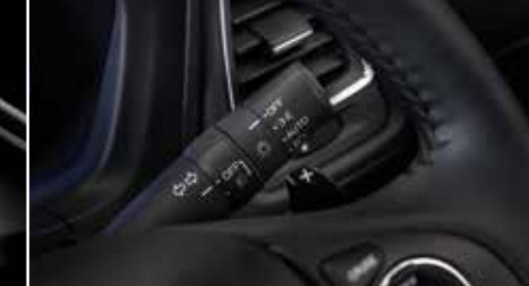
One touch turn signal

With just the flick of a switch, your car is in park mode, making clumsy handbrakes ancient history. When you're ready to get back on the road, EPB automatically disengages as you press the accelerator pedal as long as the driver seatbelt is fastened.