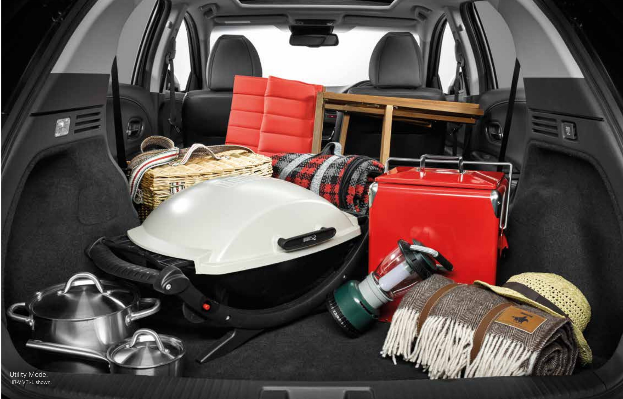
Utility Mode. HR-V VTi-L shown.