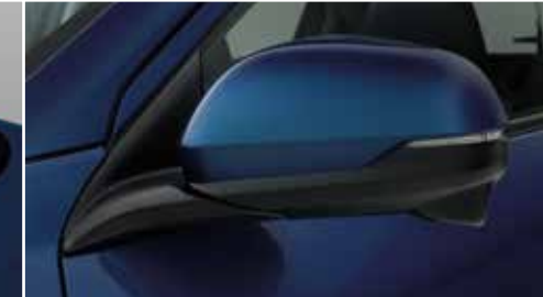
Retractable mirrors with integrated LED side indicators

Talk about the perfect accomplice. When the HR-V notices the first signs of rain, it can automatically engage the windscreen wipers. Once the weather has passed, it'll return them to the off position (VTi-S and above).