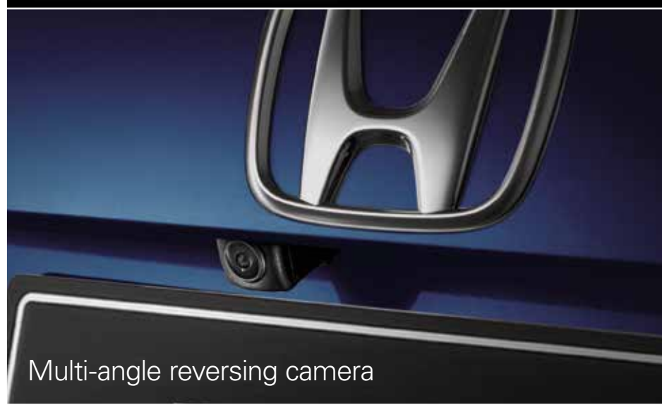
Multi-angle reversing camera