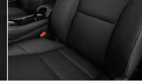
Leather-appointed+ heated front seats

Often it's the small details that enrich the bigger picture. So when you choose the advanced VTi-L model, you'll receive Honda's exceptionally well-crafted alloy sports pedals as part of the package (VTi-L only).