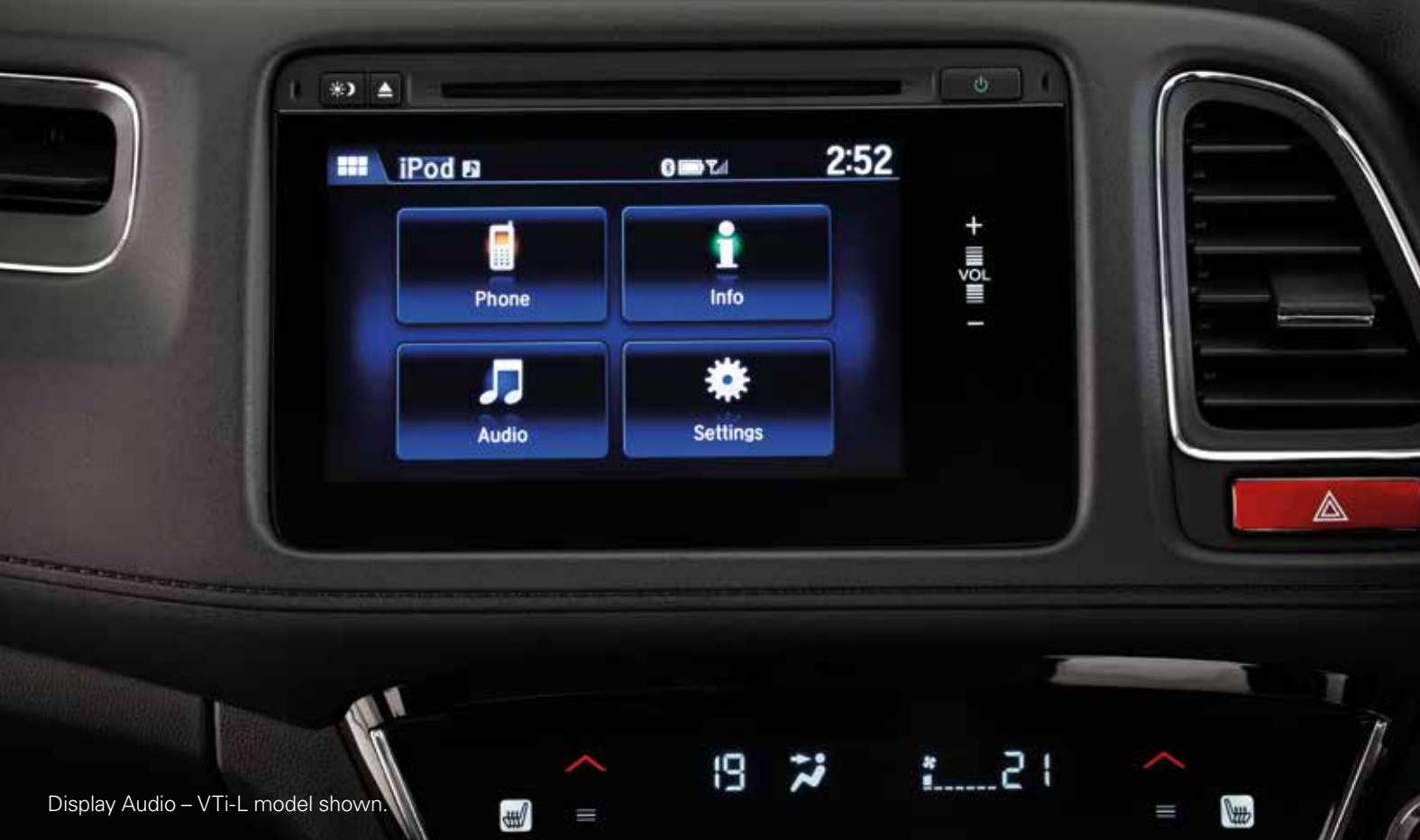
Display Audio – VTi-L model shown.