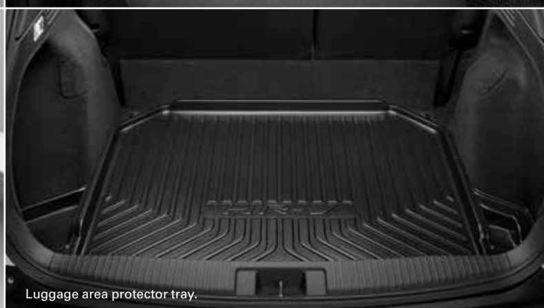
Luggage area protector tray.