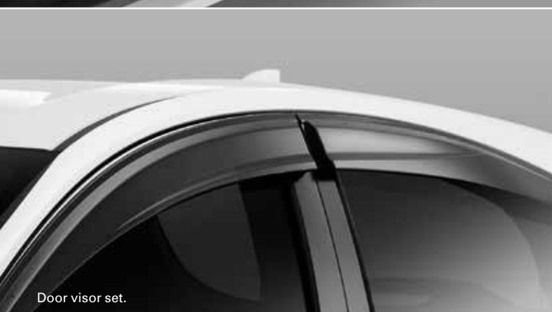
Door visor set.