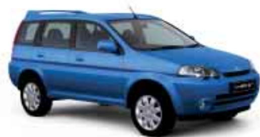
Vivid Blue Pearl