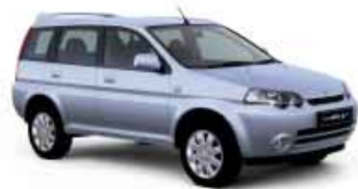
Clear Blue Silver Metallic Available from March 2004 onwards