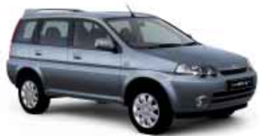
Cosmic Grey Pearl