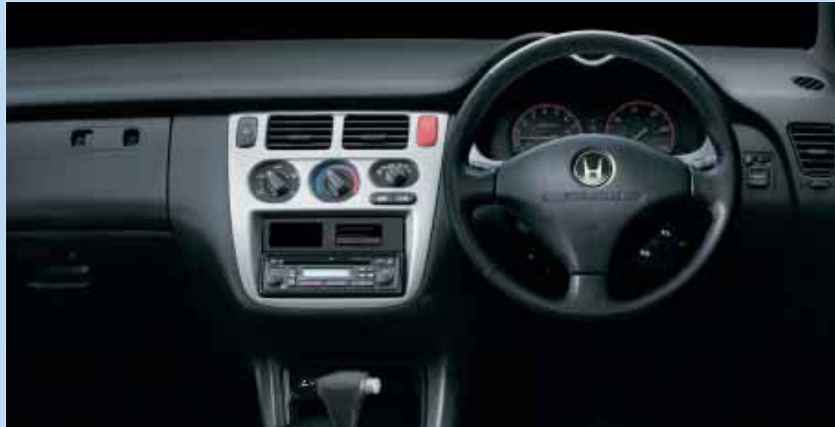
Model shown is HR-V with CVT

Available with all colour options. For full exterior colour options please see colour palette at back of brochure.