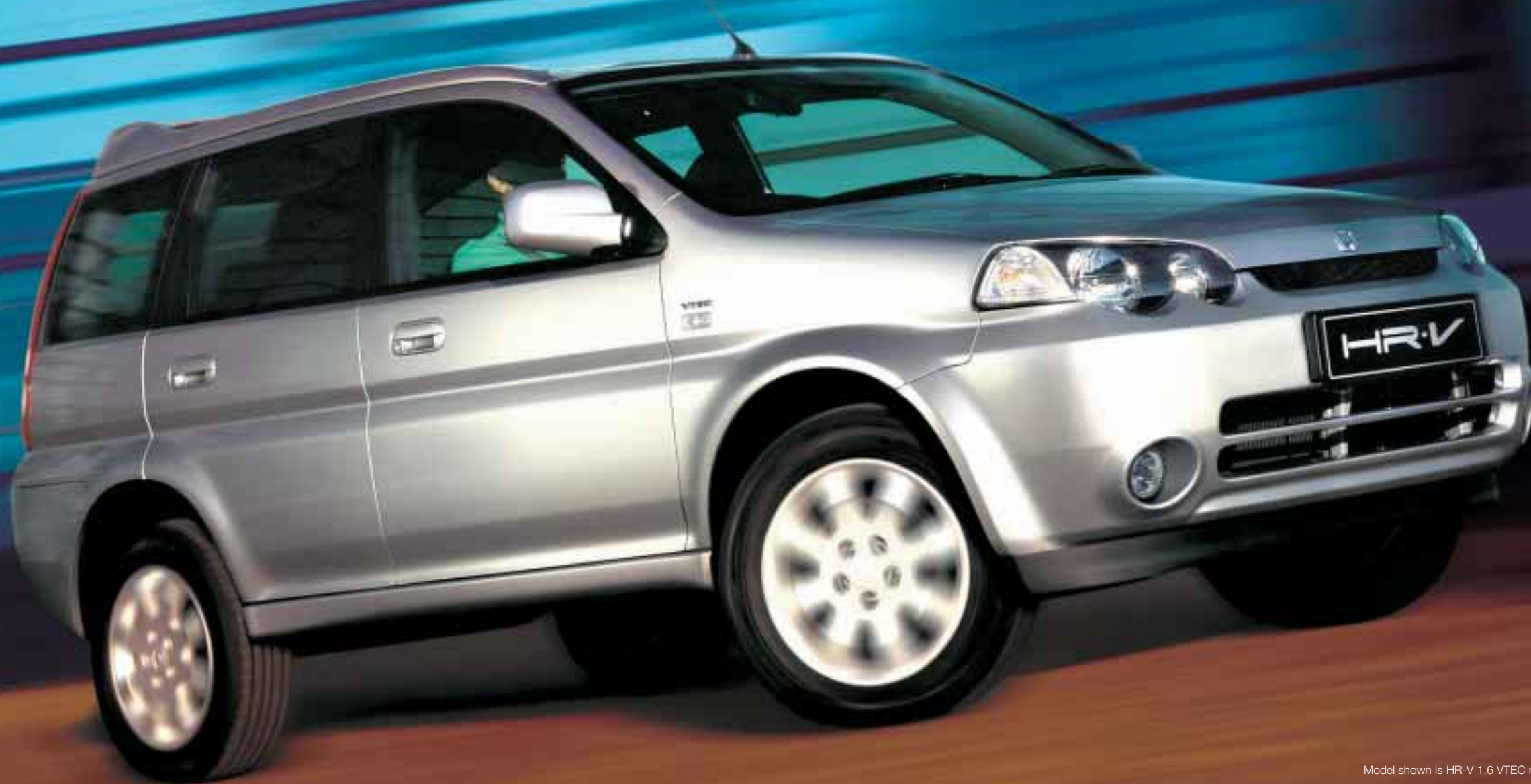
Model shown is HR-V 1.6 VTEC manual

All of which makes the HR-V a great way to escape everyday life. But with 603 litres of boot space and 50/50 split folding rear seats, you don't leave any of your luggage behind. Just your baggage.