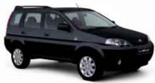
Nighthawk Black Pearl