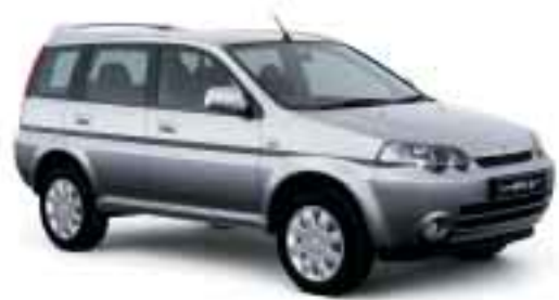
Satin Silver Metallic