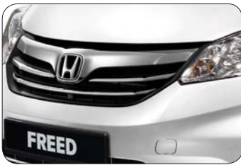
Chrome Front Grille.