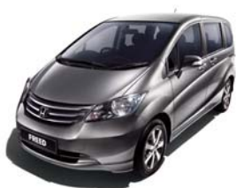
Polished Metal Metallic (NH-737M)