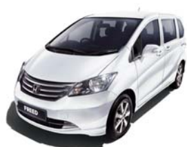
Brilliant White Pearl (NH-636P)