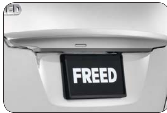
Chrome Rear License Plate Garnish.