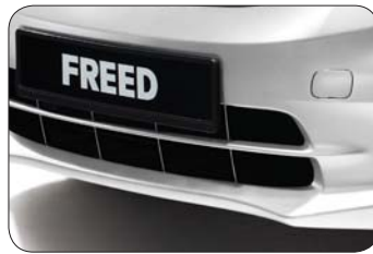
Stylish Front Bumper.