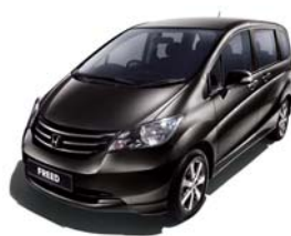
Crystal Black Pearl (NH-731P)