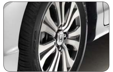
Sporty 15" Alloy Wheels.