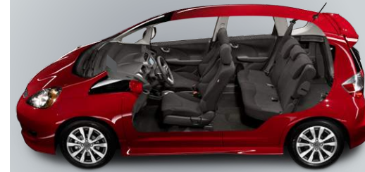
U.S. model shown.