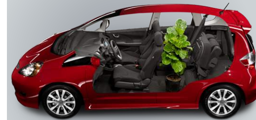
U.S. model shown.