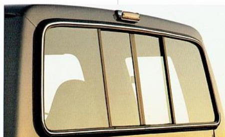
For increased ventilation, the sliding rear window has been a popular F-Series option.