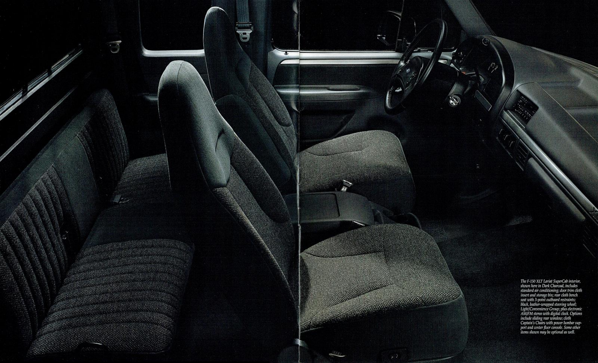
The F-150 XLT Lariat SuperCab interior, shown here in Dark Charcoal, includes standard air conditioning; door trim cloth insert and storage bin; rear cloth bench seat with 3-point outboard restraints; black, leather-wrapped steering wheel; Light/Convenience Group; plus electronic AM/FM stereo with digital clock. Options include sliding rear window; cloth Captain's Chairs with power lumbar support and center floor console. Some other items shown may be optional as well.