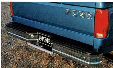
The step bumper option, shown above, makes it easy to access your pickup bed.