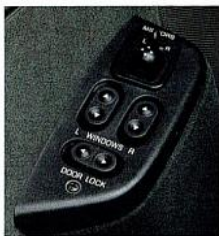
Controls to operate the optional power windows, power door locks and mirrors are conveniently located on the door-trim panel. A good example of the driver-friendly design of the 1992 F-Series.

Finally, we've installed three-point outboard safety restraints on the SuperCab optional rear bench seat—something that won't go unappreciated.