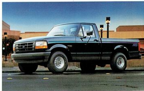
Shown above, the F-150 XLT Lariat "Nite" truck in Raven Black with special bodyside tape stripes. The "Nite" model interior includes a choice of colors—Dark Charcoal, Scarlet Red or Crystal Blue; a sliding rear window; "Nite" nomenclature on the instrument panel and special "Nite" floor mats.

The well-equipped XL comes customer-ready with popular standard amenities like a chrome grille; bright, manual mirrors; forged aluminum deep-dish wheels; electronic AM/FM stereo and digital clock; color-keyed cloth headliner; cloth and vinyl front bench seat plus vinyl rear jump seats on the SuperCab.