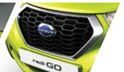
FRONT GRILLE Sleek horizontal lines combine with strong D-shaped contours formed by metal bars on either side to symbolise the spirit of Datsun in a contemporary way.