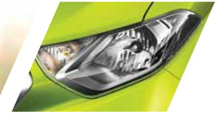
HEAD LAMPS Futuristically designed yet extremely functional, this iconic design with its stylish signature chrome finish differentiates the Datsun redi-GO from all the other cars on the road.

The Datsun redi-GO follows the 'YUKAN' (勇敢) design philosophy that seeks to create cars that are Brave and Bold, Compact yet Sleek with crisp and clean lines.