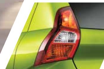
TAIL LAMP DESIGN The rear lamp clusters are positioned high up on the car's tail and have a stylish three-dimensional form.