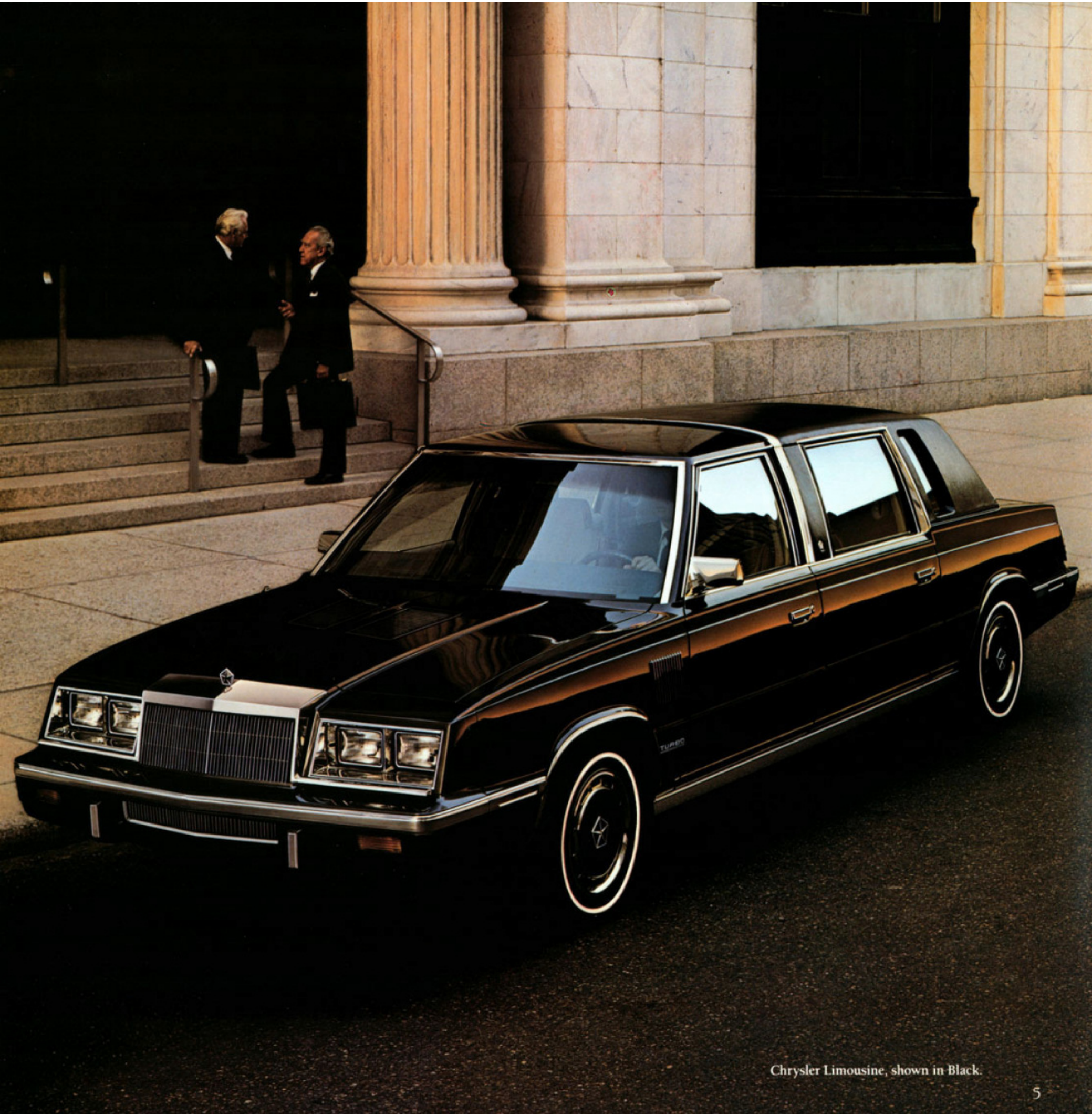
Chrysler Limousine, shown in Black.