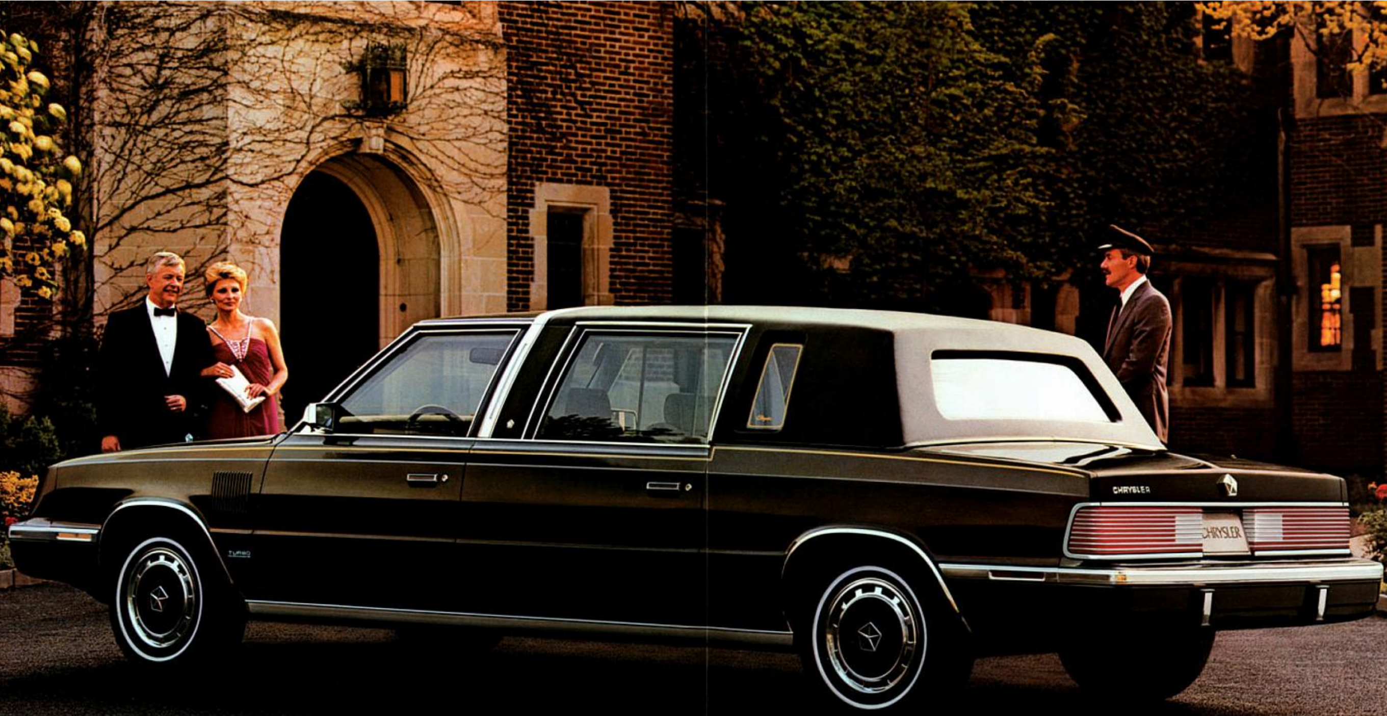
Chrysler Limousine, shown in Black.