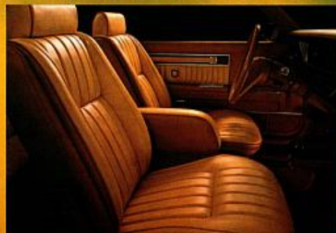
Optional Mark Cross Edition leather interior, shown in Almond/Cream.

W HY SIT AROUND waiting for a summer breeze to come up when you can create quite a stir yourself? Behind the windshield and the wheel of a 1986 LeBaron convertible. Breeze along with the top down. Or bolt along with the power up by adding the optional 2.2-liter EFI turbocharged engine...Vroom with a view. If that spark for driving excitement glows inside you...fan it to life in a LeBaron convertible.