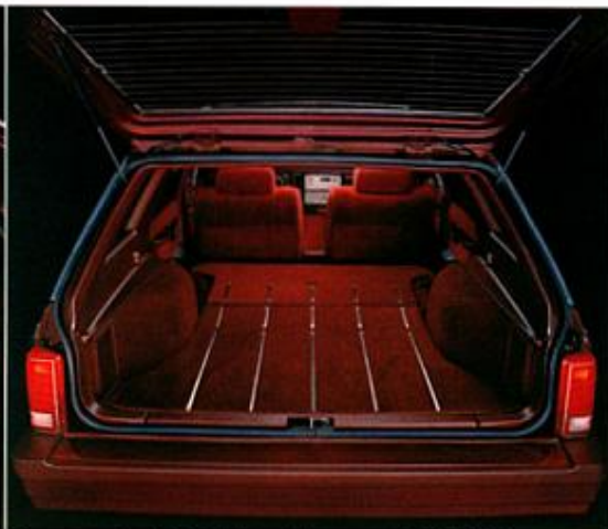
Cargo capacity: 67.1 cubic feet with rear seatback folded down.