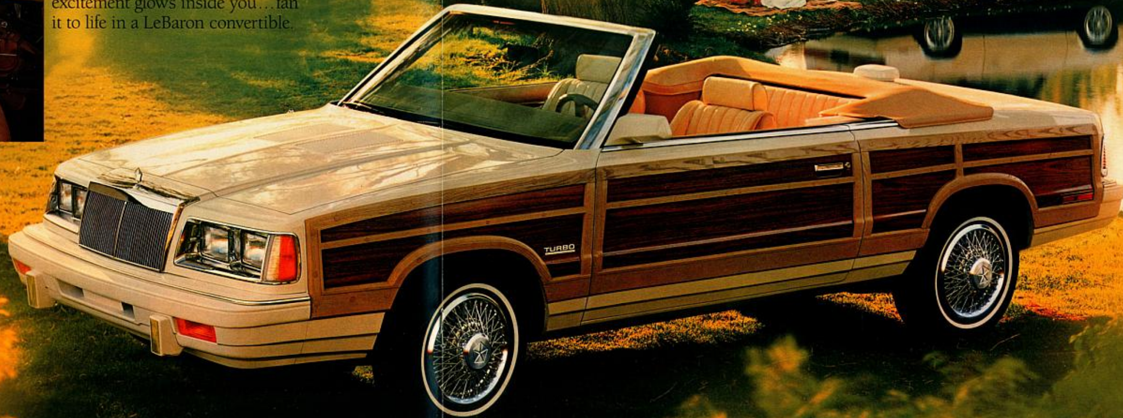
Chrysler LeBaron Town & Country convertible (foreground), shown in White. Chrysler LeBaron convertible, shown in Light Cream.