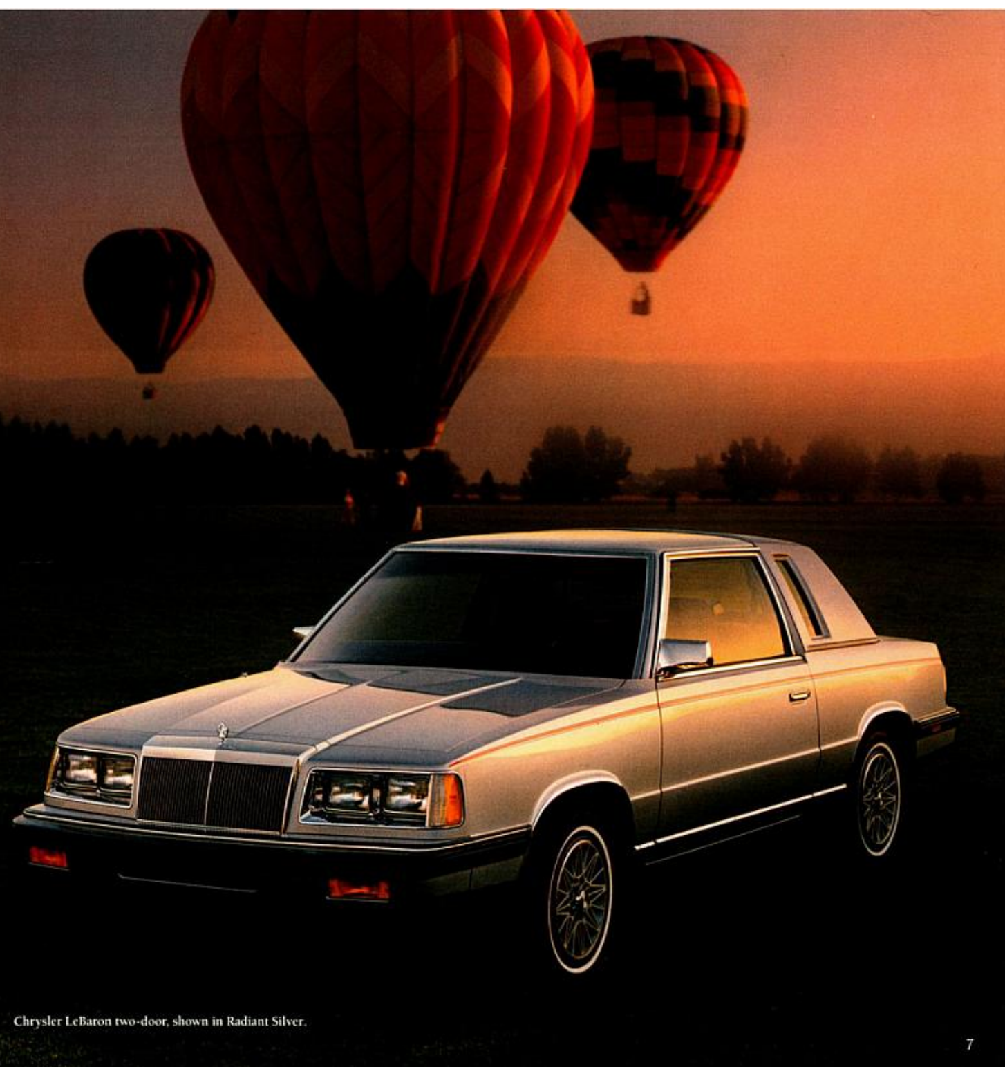
Chrysler LeBaron two-door, shown in Radiant Silver.