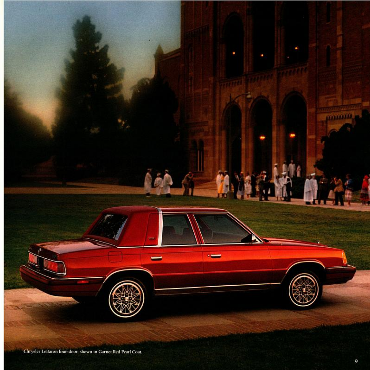
Chrysler LeBaron four-door, shown in Garnet Red Pearl Coat.