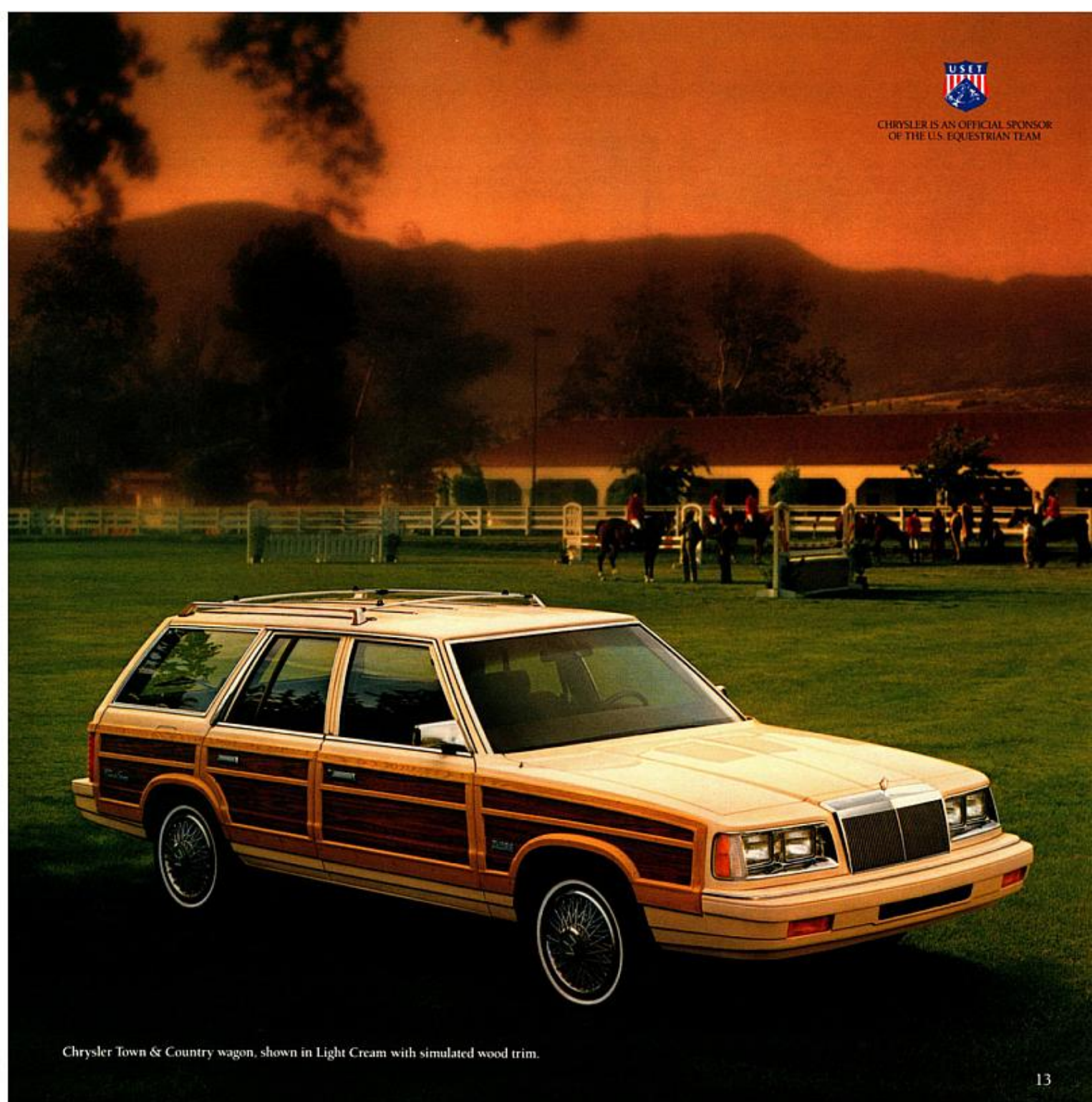
Chrysler Town & Country wagon, shown in Light Cream with simulated wood trim.