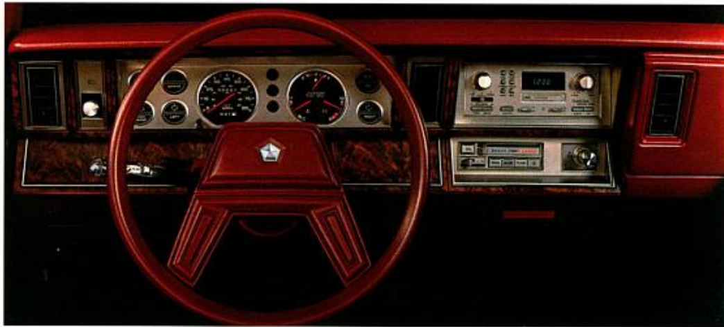
Redesigned instrument panel for 1986 LeBaron four-door.

T HE LEBARON four-door favors family togetherness, but not family stuck-togetherness. Even family can get too close for comfort. Roomy LeBaron won't cramp your family. Aerodynamically designed LeBaron won't cramp your style. Efficiently engineered LeBaron won't cramp your pocketbook. Its 2.2-liter four-cylinder engine with electronic fuel injection pulls six passengers...at family rates. And each of the kids can have his or her own room.