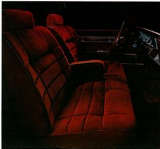
Standard cloth split-back bench seat with folding center armrest and adjustable head restraints, shown in Cordovan.

A WAGON should be dressed up, even if it's only going to work. Town & Country wagon, with its contemporary styling and simulated woodgrain paneling, is as well-suited for an evening on the town as it is for collecting crate-fulls in the country. A wagon should haul. Town & Country pulls its weight (and then some) with Chrysler's new standard 2.5-liter electronically fuel-injected balance shaft engine. It carries the family in comfort and carts in quantity. The 1986 Town & Country wagon. It'll transport you.