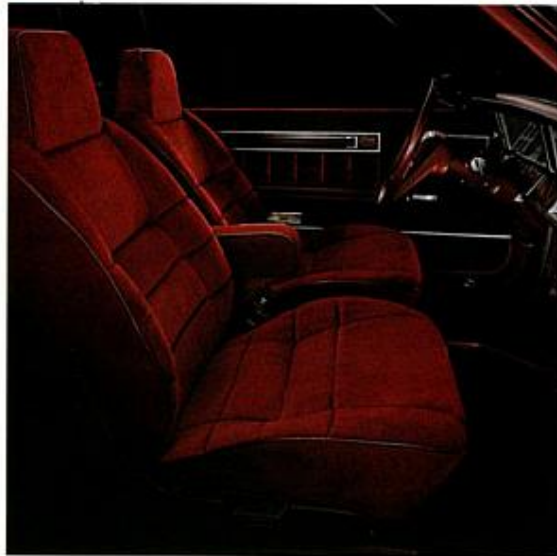
Optional cloth high-back bucket seats with folding center armrest, shown in Cordovan.

P ERHAPS this is the year for your foray into sportiness. A time to be a little daring. Without losing your dignity. The LeBaron two-door is not a radical departure from Chrysler traditions of comfort, convenience and quality. It is a proper car. But a car whose subtle sportiness keeps it on the lighter side of stodgy. It is a sensibly stylish car...a car of uncramped comfort, electronic convenience, and uncompromised quality.