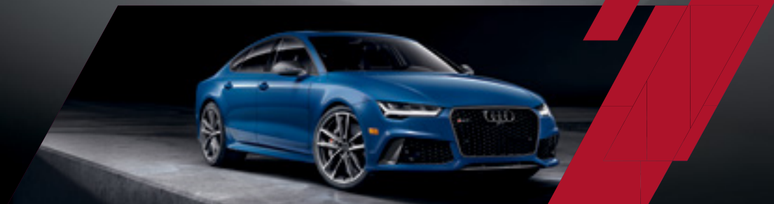
RS 7 / RS 7 performance