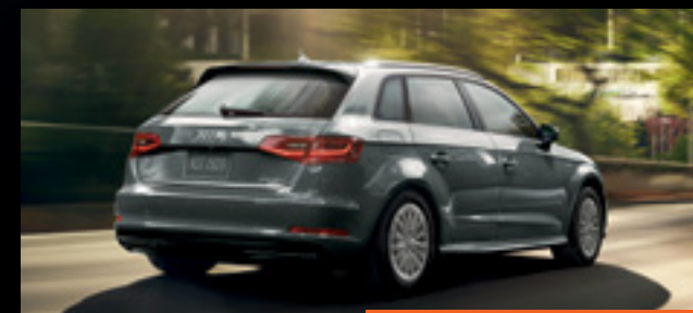
A3 Sportback e-tron®