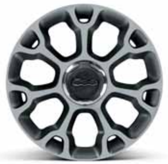
68Q 17" TREKKING ALLOY WHEELS MATT BLACK DIAMOND FINISHED AND M+S (MUD&SNOW) ALL-SEASON TYRES