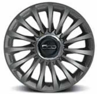
LINEACCESSORI 17" 225/45 R17 ECOREFLEX GREY ALLOY WHEELS