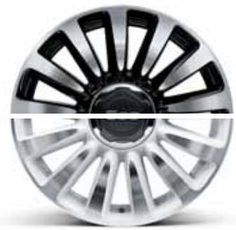
4WQ 16" ALLOY WHEELS WHITE DIAMOND FINISHED