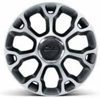
5EQ 17" TREKKING ALLOY WHEELS GLOSSY BLACK DIAMOND FINISHED AND M+S (MUD&SNOW) ALL-SEASON TYRES