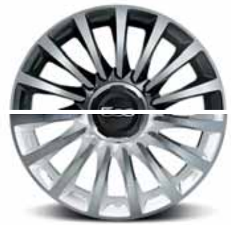
LINEACCESSORI 17" 225/45 R17 DIAMOND FINISHED WHITE ALLOY WHEELS