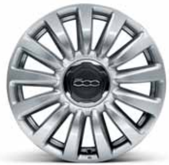
433 16" SILVER ALLOY WHEELS